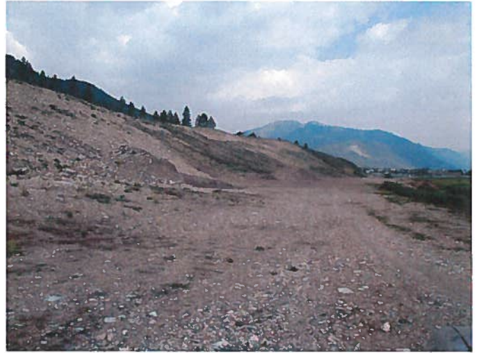
Figure 2: View of site, facing northwest, from the east side of the permit area.