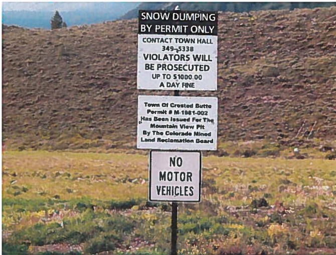
Figure 1: Mine ID sign located at site entrance.