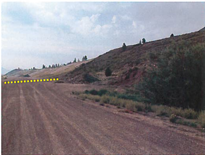
Figure 3: View of site, facing southeast, from the west side of the permit area. The yellow line is the approximate west permit boundary.