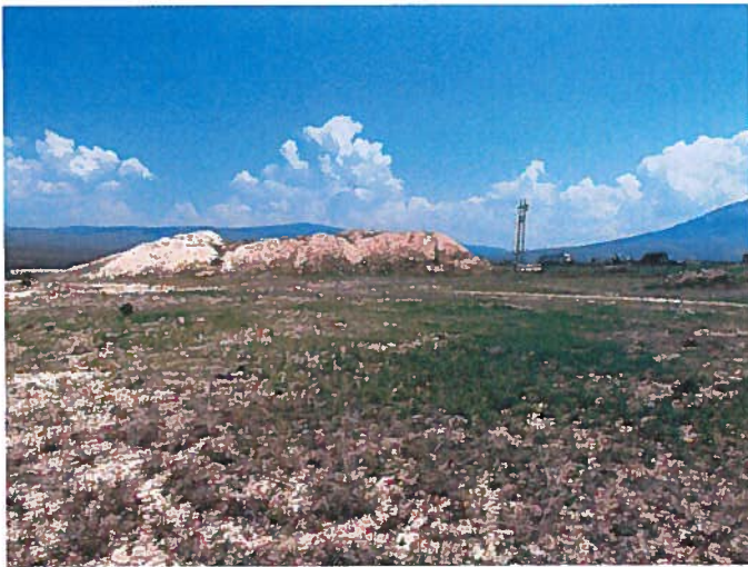
Figure 3: Topsoil pile located at the northeast side of the pit.