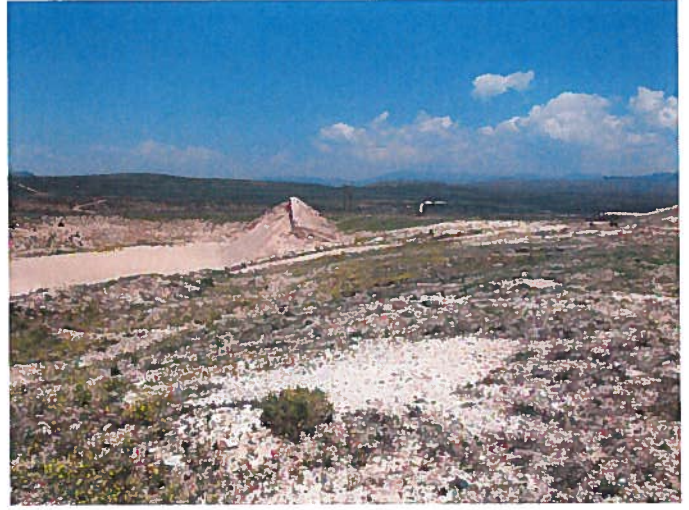
Figure 2: View toward the north pit area.