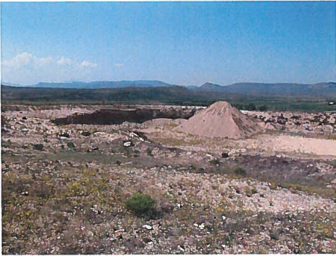
Figure 1: View toward the south highwall.