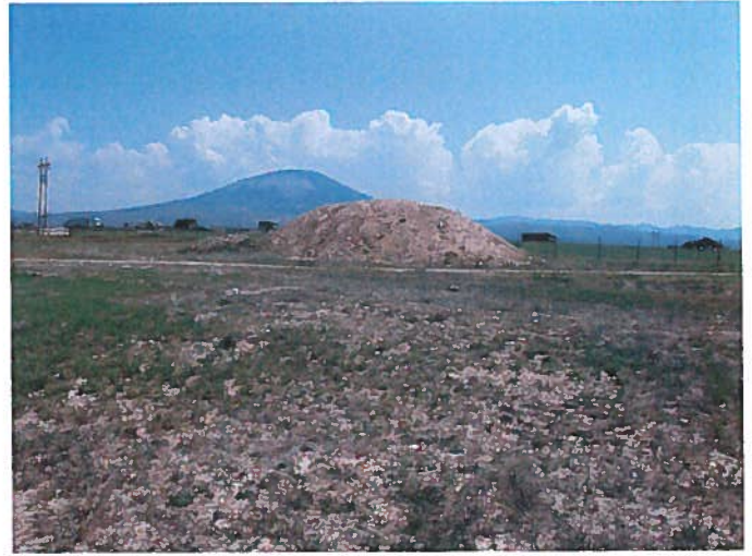
Figure 4: Topsoil pile located at the northeast side of the pit.