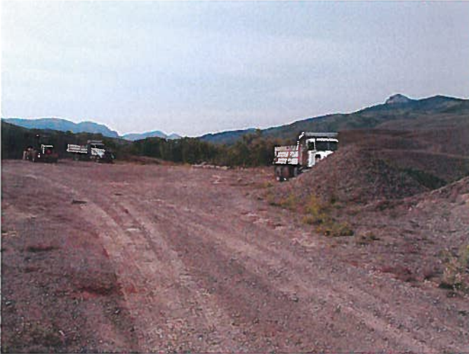
Figure 1: View facing south from near site entrance.