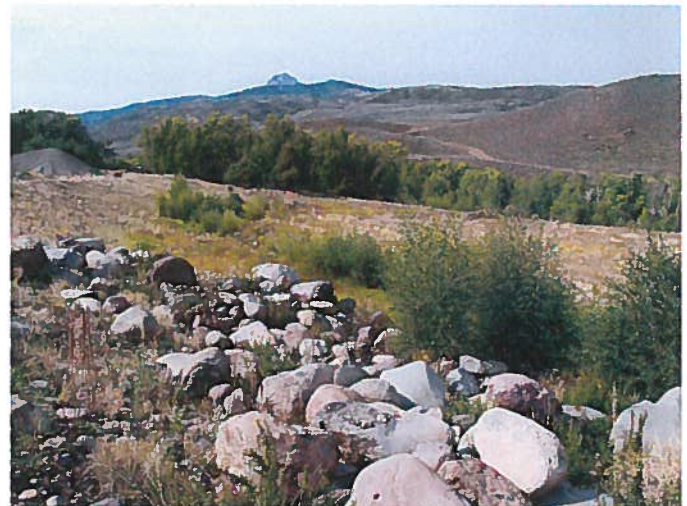
Figure 4: View facing southwest toward mined area.