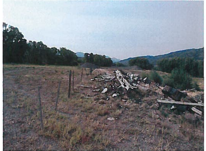
Figure 2: View facing south down fence line separating the original and amended permit boundaries. The amended area is seen on the left side of the fence.