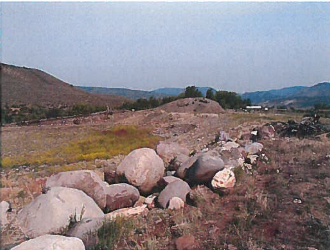
Figure 3: View facing northwest toward mine face and crushing area.