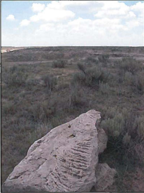
Photo 1. Boundary marker