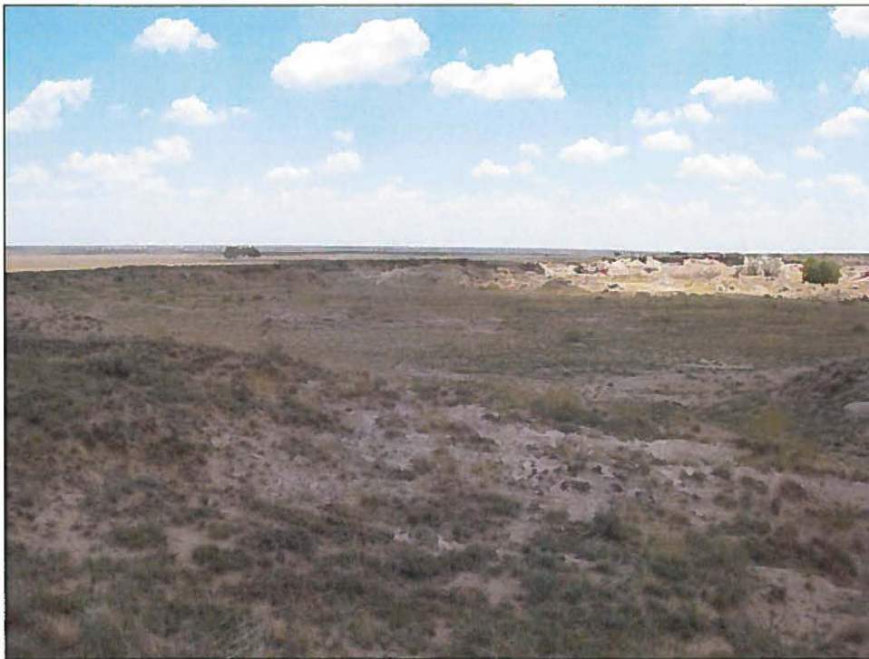
Photo 3. Looking northeast. Pre-law workings are in foreground. Highwall is visible in back.