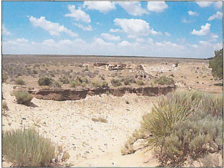
Photo 2. Eastern part of pit looking south.