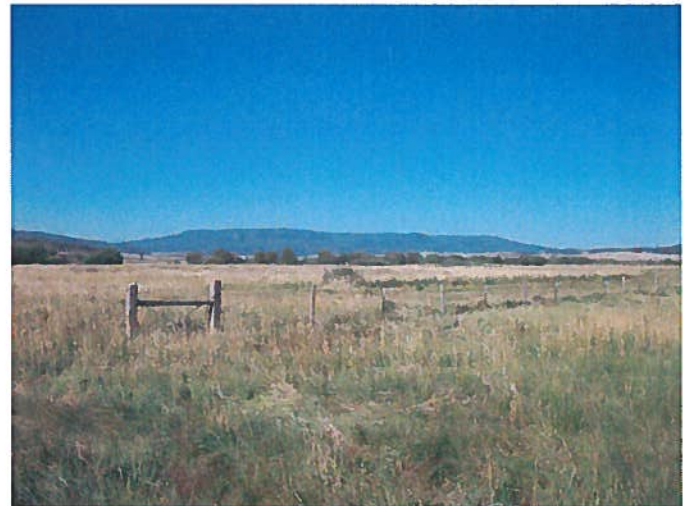
Figure 4: View from the northeast corner of the AM2 area, towards the southwest.