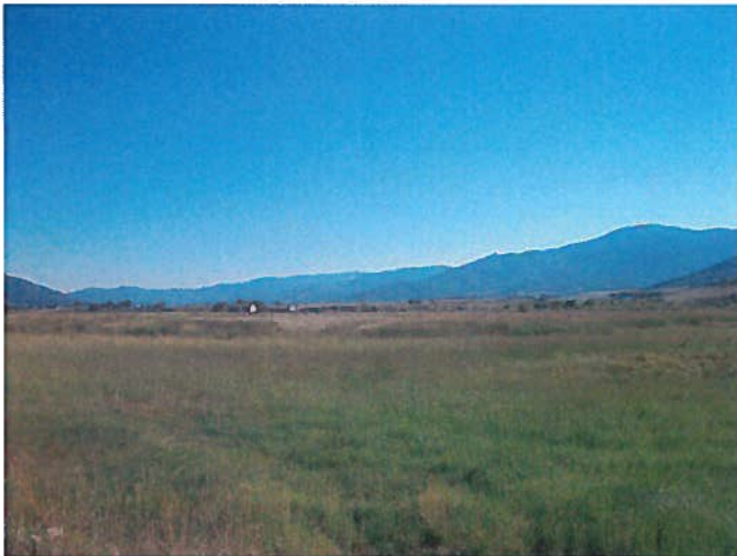
Figure 3: View from the southwest part of the AM2 area, towards the north.