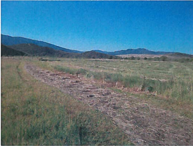
Figure 5: View from the Phase 3-4 area, south towards the Phase 1 process area.