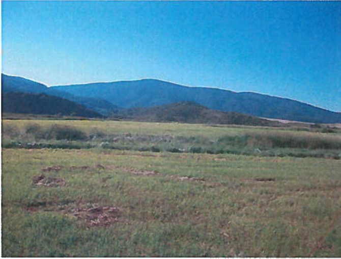
Figure 1: View from the southwest part of the AM2 area, towards the southeast.