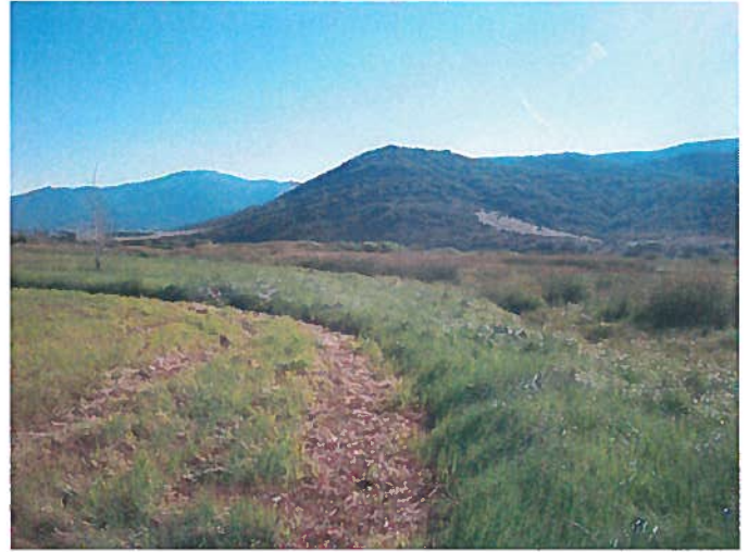
Figure 2: View from the southwest part of the AM2 area, towards the northwest.