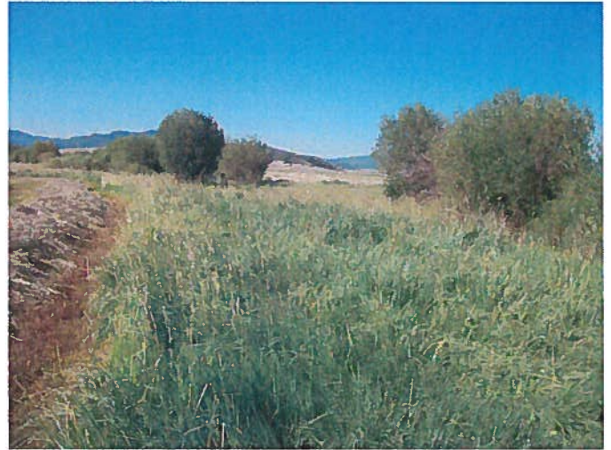
Figure 6: Yampa River bypass near the Phase 4 area.

Ed MacArthur Alpine Aggregates, LLC 1878 13th Street Steamboat Springs, CO 80487