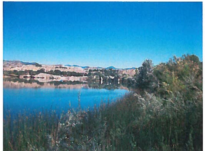
Figure 4: View of the reclaimed east shoreline from near the southeast corner of Parcel B.