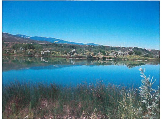
Figure 2: View from the west side of the boat house, facing southwest towards the reclaimed south shoreline and island located in Parcel B.