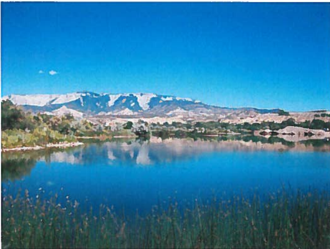
Figure 3: View of the reclaimed south shoreline and island from near the southeast corner of Parcel B.