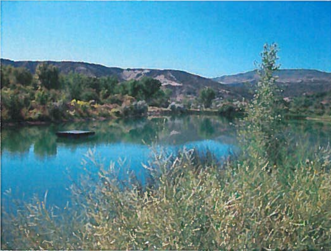
Figure 1: View from the west side of the boat house, facing southeast towards the reclaimed east shoreline in Parcel B.