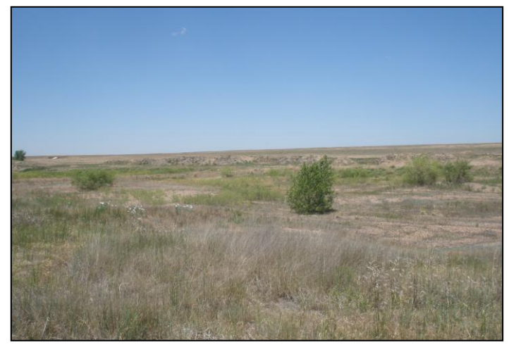
Figure 4 looking at the naturally reclaimed dry stream bed