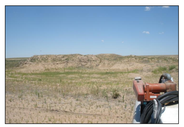
Figure 3 looking at the small overburden stockpile % \left\{ 1,2,\ldots ,n\right\}