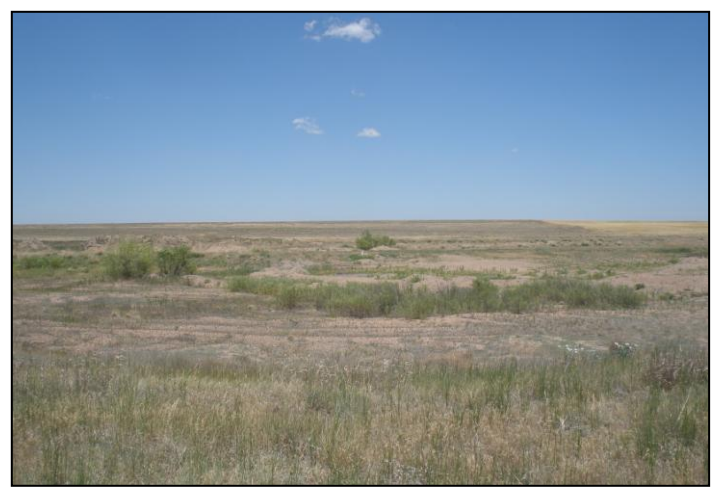
Figure 2 looking @ the active dry gulch which was mined