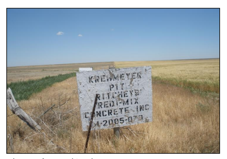
Figure 1 permit sign