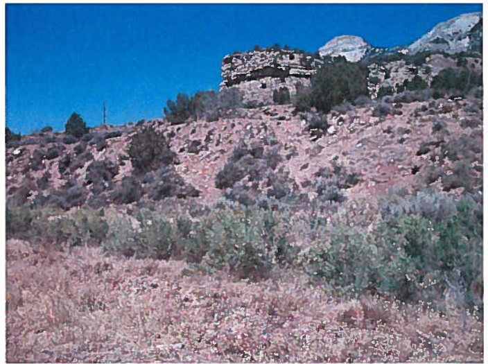
Figure 2: View, facing west, from the east side of the proposed permit area.