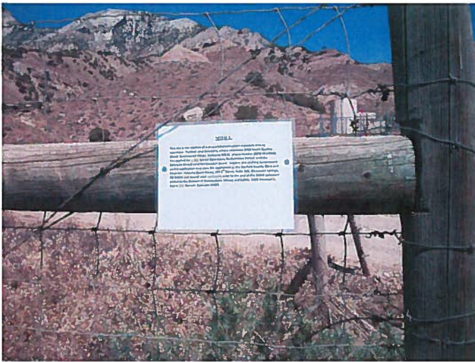
Figure 1: Notice posted at the existing site entrance in accordance with Rule 1.6.2(1)(b).