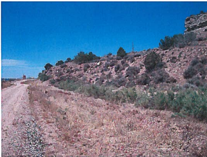
Figure 3: View, facing southwest, down the existing well pad access road.