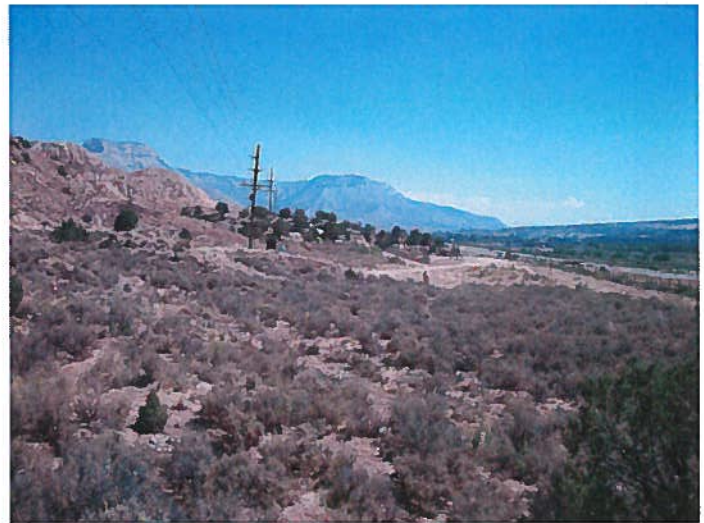
Figure 4: View, facing northeast, from the west side of the proposed permit area.