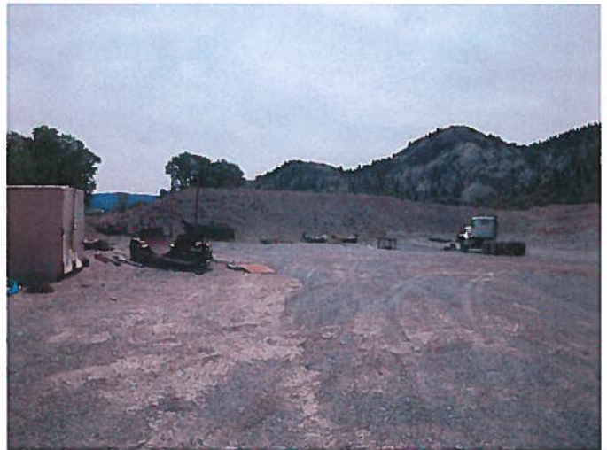
Figure 2: View, facing east, towards the east permit boundary.