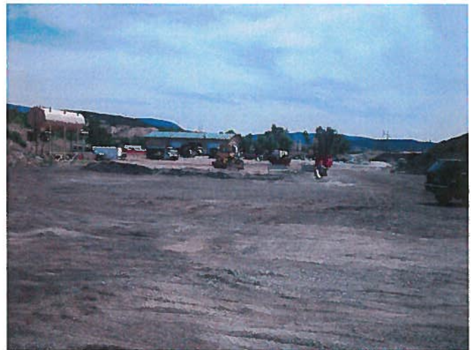
Figure 4: View, facing east, from the west end of the site.