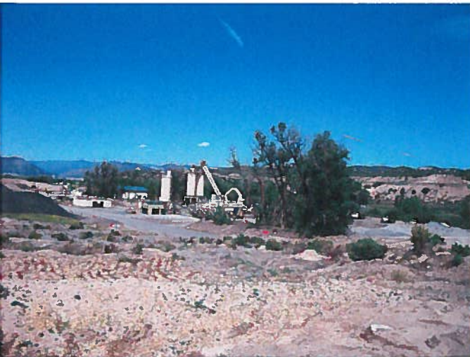
Figure 3: View, facing northwest, towards the plant area.