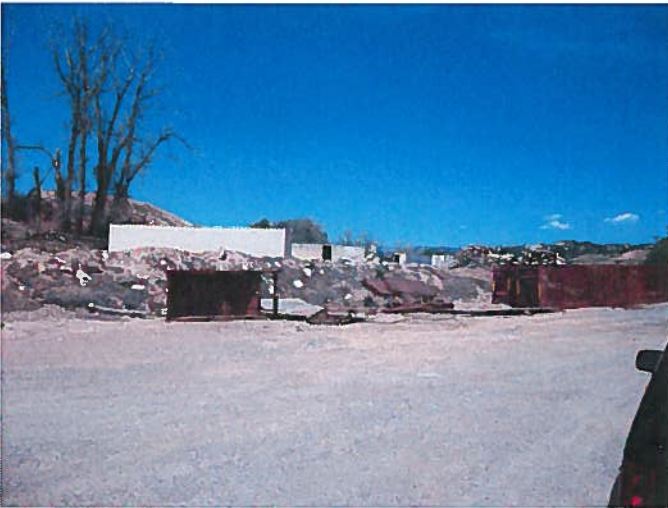
Figure 1: View, facing west, from the east end of the site.