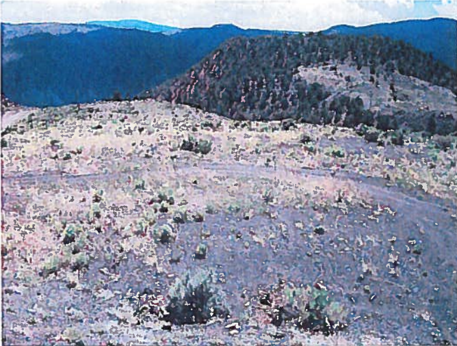
Figure 1: View from quarry area, facing south towards reclaimed area.