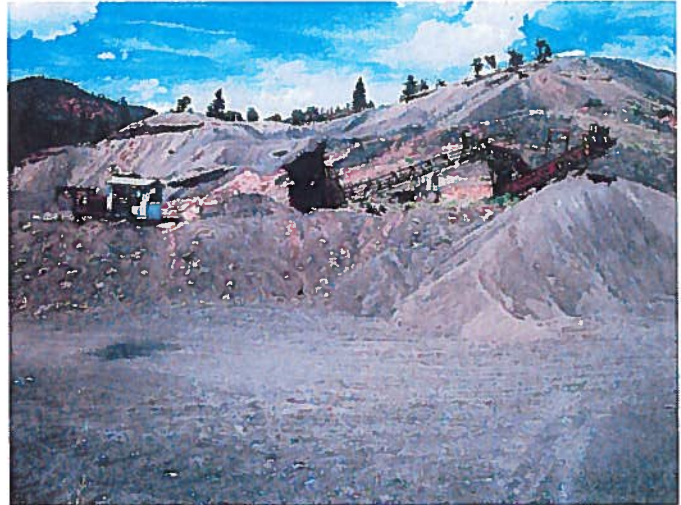
Figure 4: View facing north towards mine area.