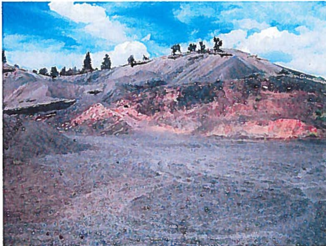
Figure 3: View facing north towards highwall.