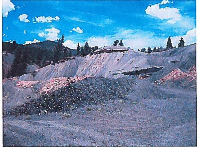
Figure 2: View facing north towards highwall.