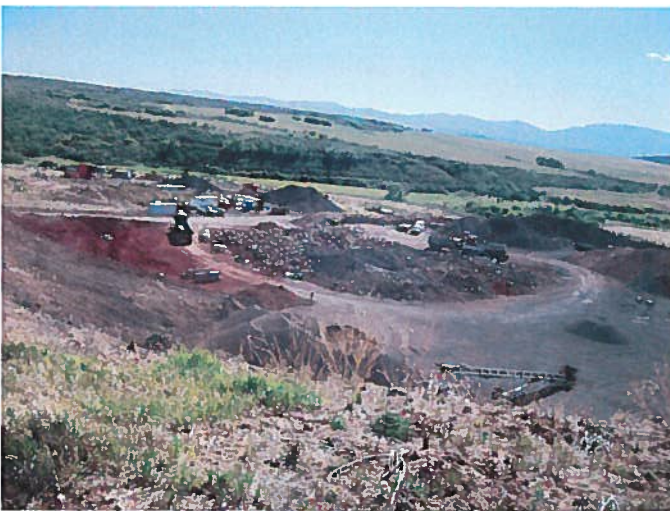
Figure 3: View facing west from top of highwall.