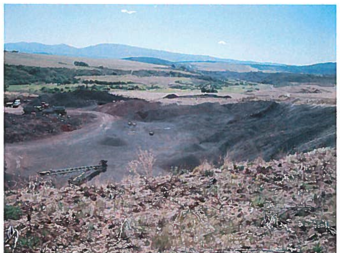
Figure 4: View facing southwest from top of highwall.