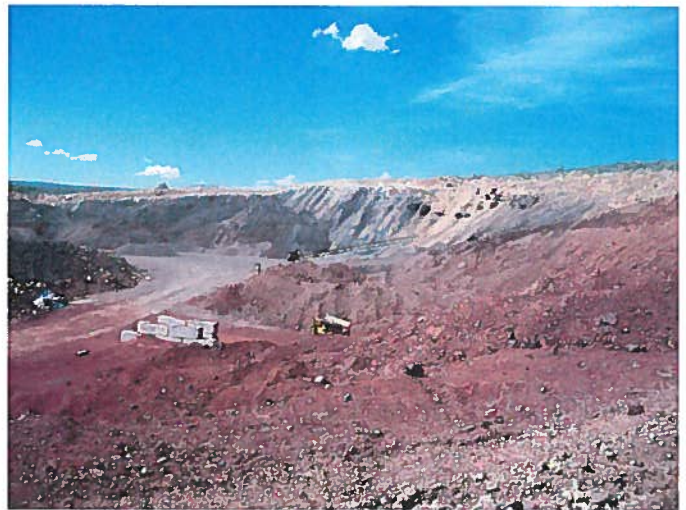
Figure 2: View towards highwall from near office area.