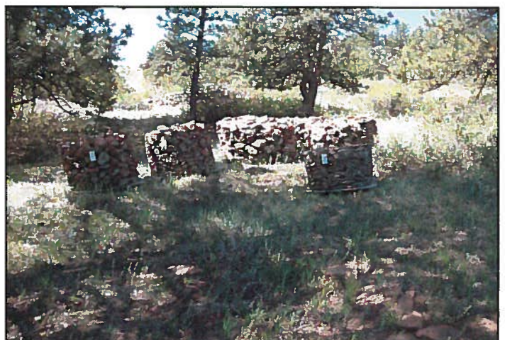
6. Stone on side of haul road.