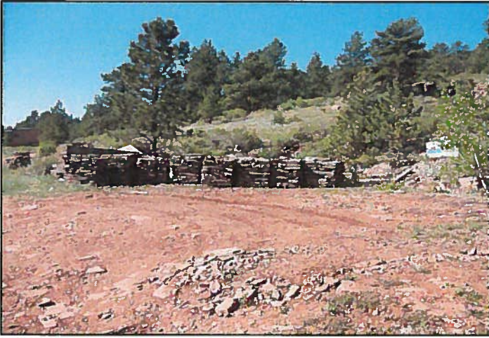
1. Storage Area, facing southwest.