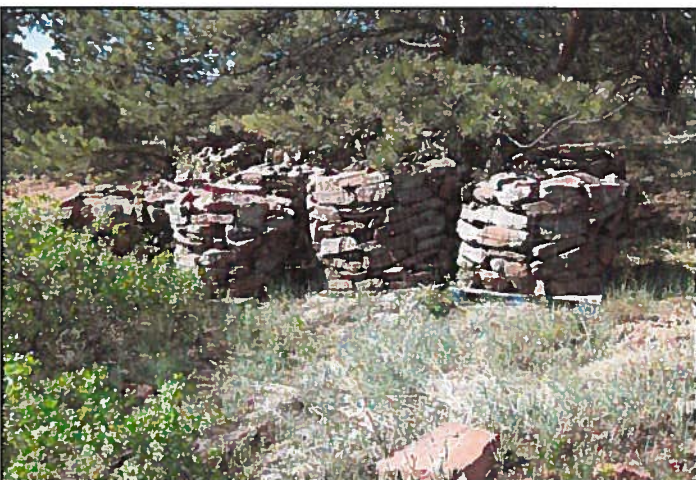
5. Stone on side of haul road.