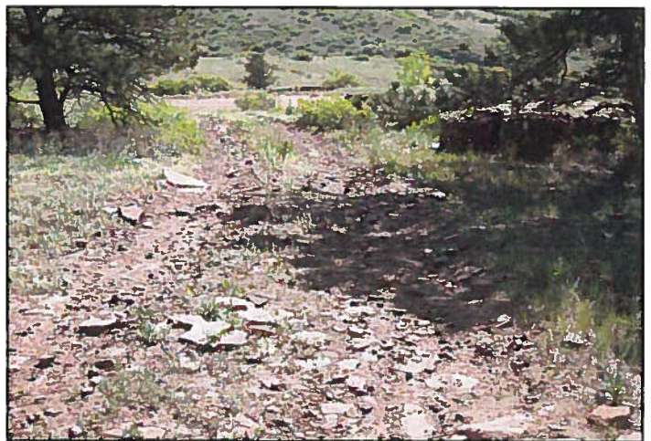
4. Haul road, facing east.