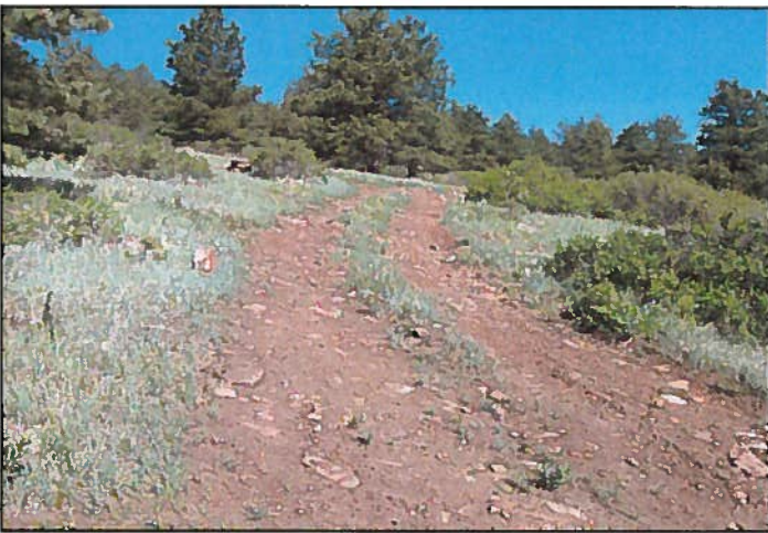
3. Haul road, facing west.