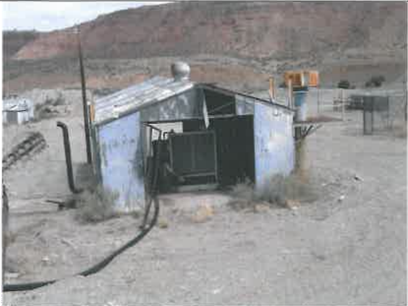
Sunday Mines Compressor Building Removed (after) Compressor to be removed by contractor.