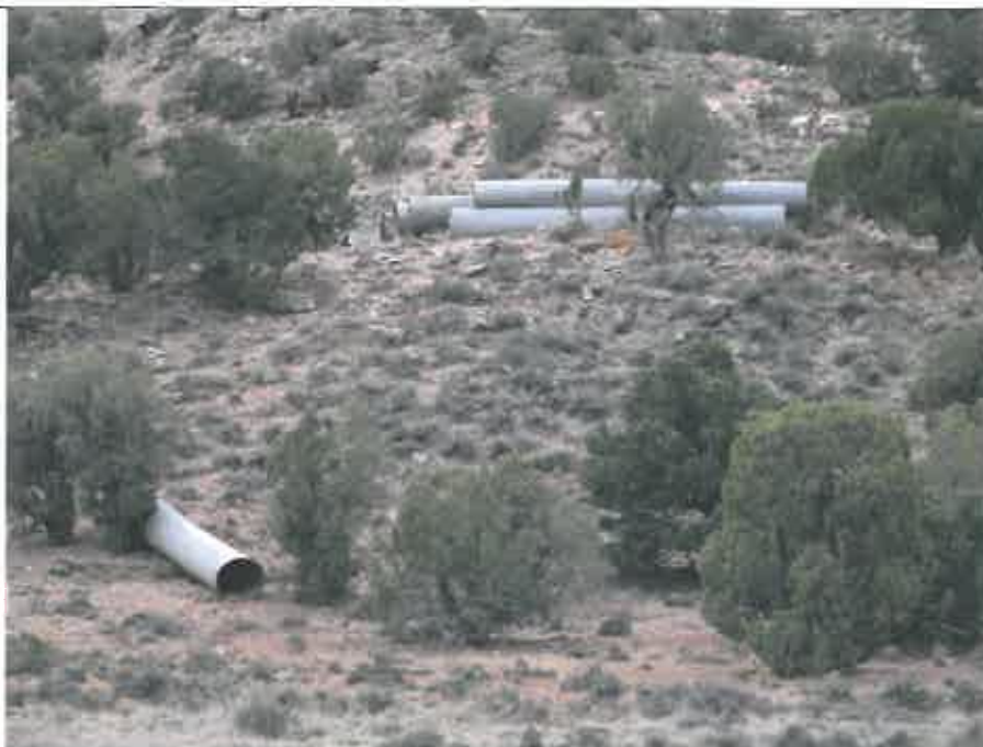
Metal culverts north of the Sunday Mine (after).