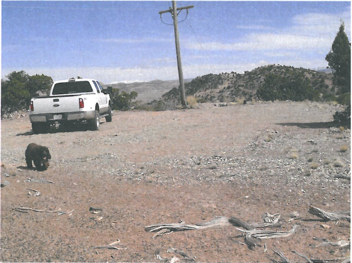
Reclaimed compressor building and slab site near the St. Jude #1 vent hole. The building slab was located just to the right of the power pole.