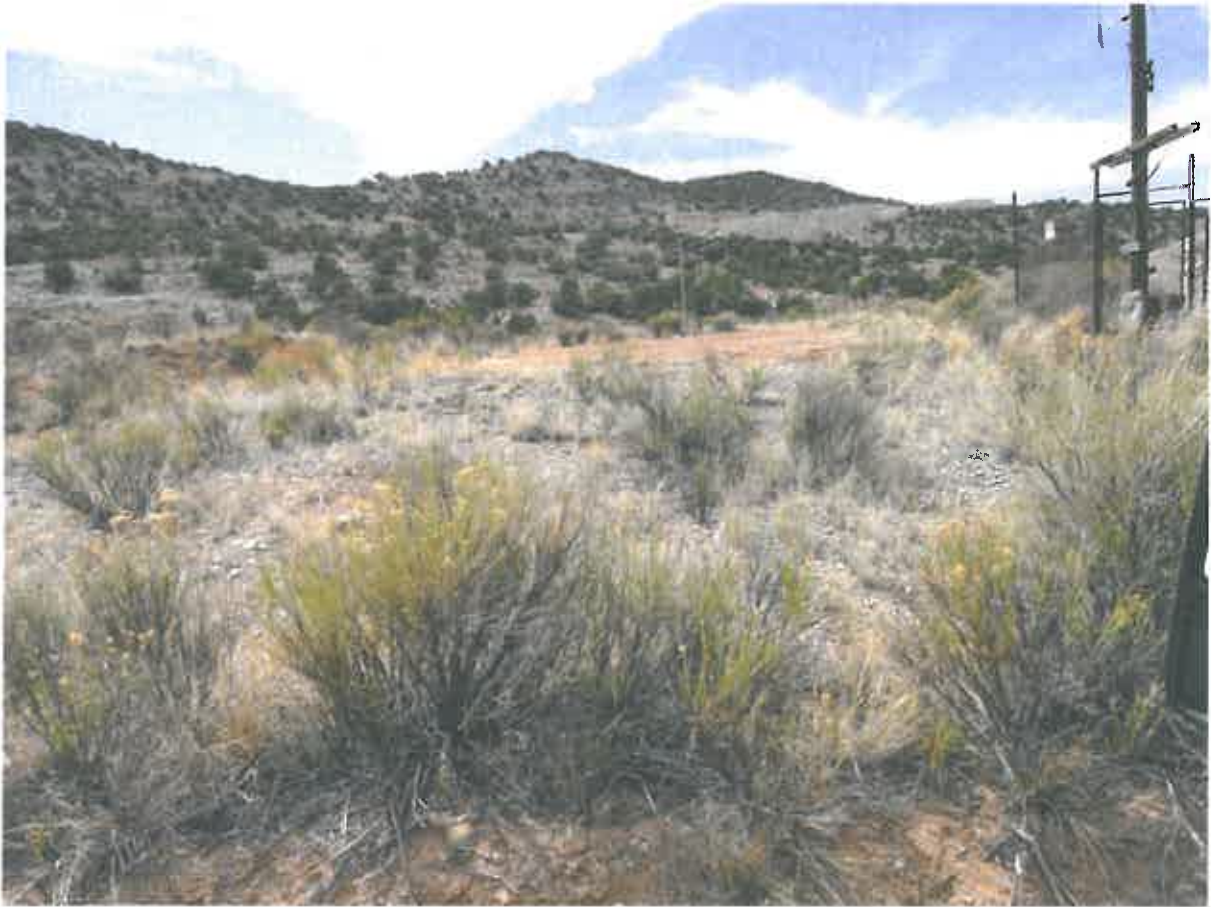
The old Carnation tire shop and slab site. All structures removed and vegetation established.