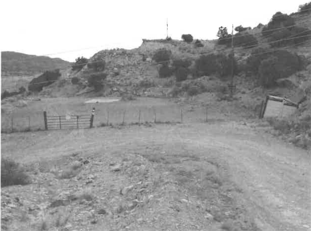
Carnation Portal – Building removed – slab and portal entry remain.