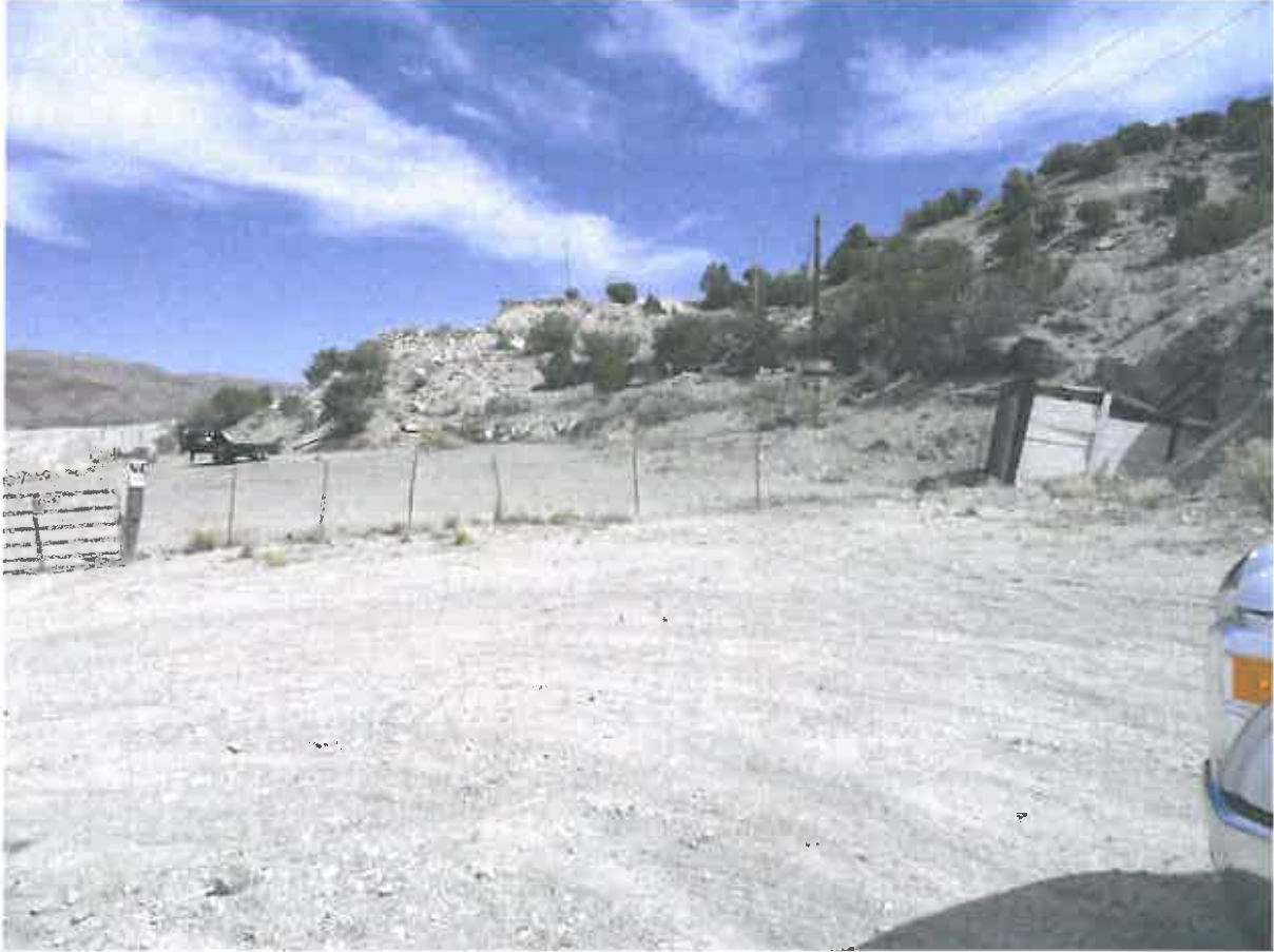
The Carnation yard with building removed. Trailer in photo is contractor conducting maintenance on storm water structures in the area.