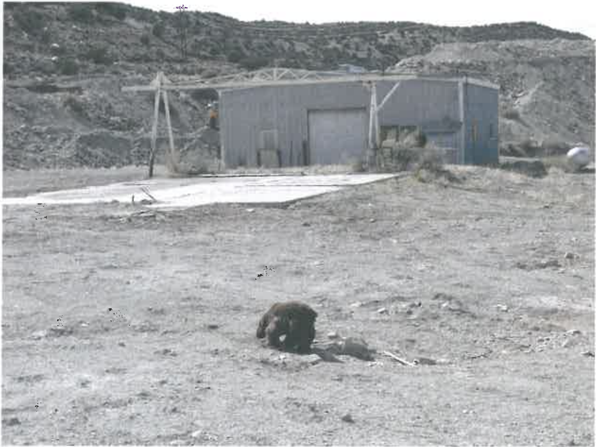
Sunday Mine - Slab is all that is left of the old tire and machine shop and attached structures. View on east side of the main Sunday shop.