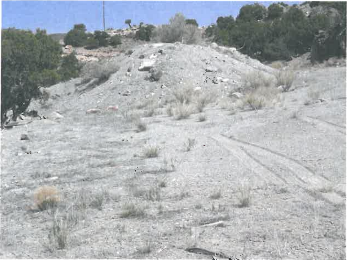
S-3 Vent. Backfilled and stable.