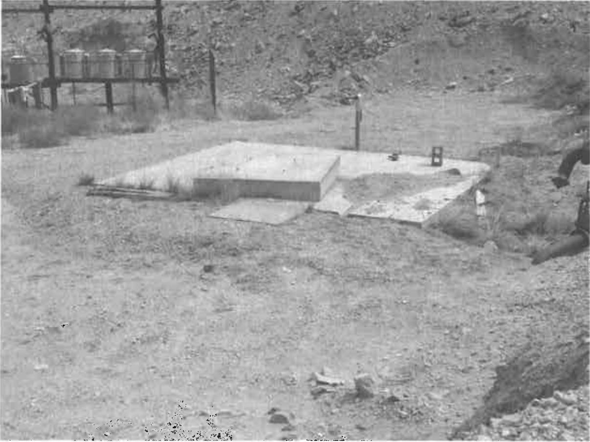
Small compressor building slab (location number 9 in overview photo); building removed.