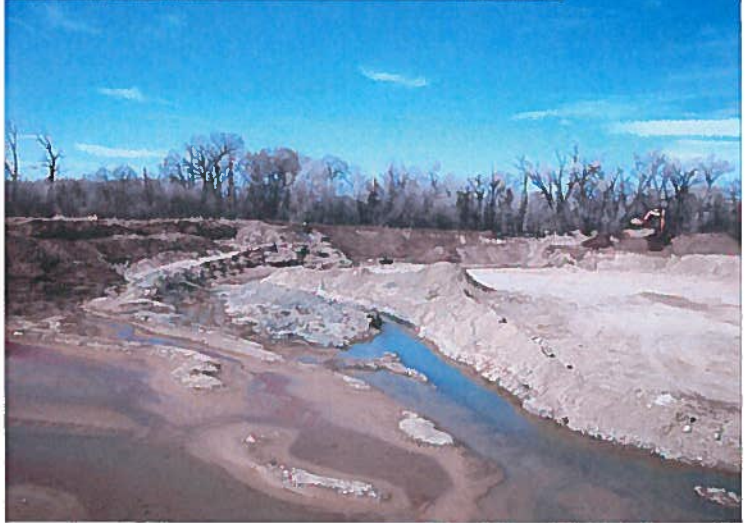
View toward southwest corner of the site, from the east side of the pit.