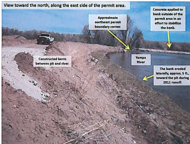
View toward the north, along the east side of the permit area.