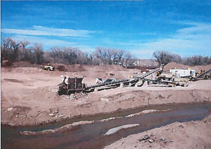
View toward west part of the site, from the east side of the pit.