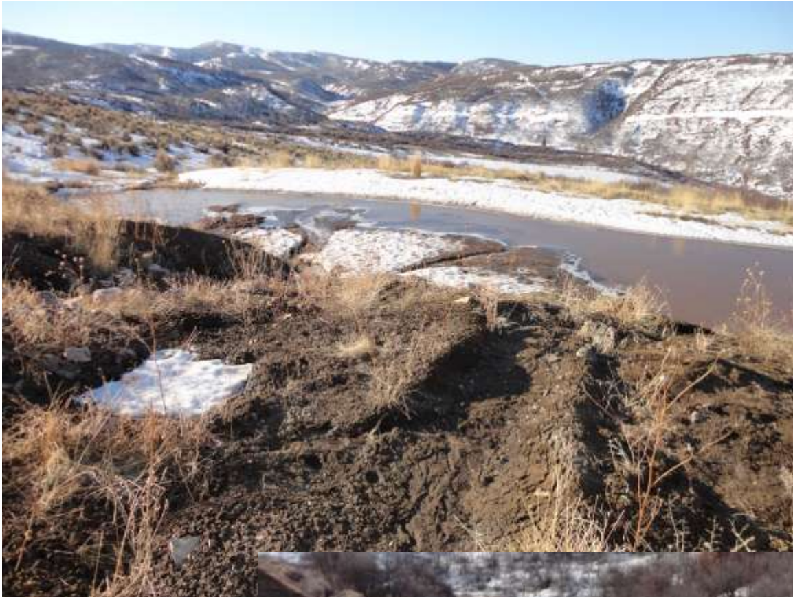
Sediment Delta in Stock Tank T2