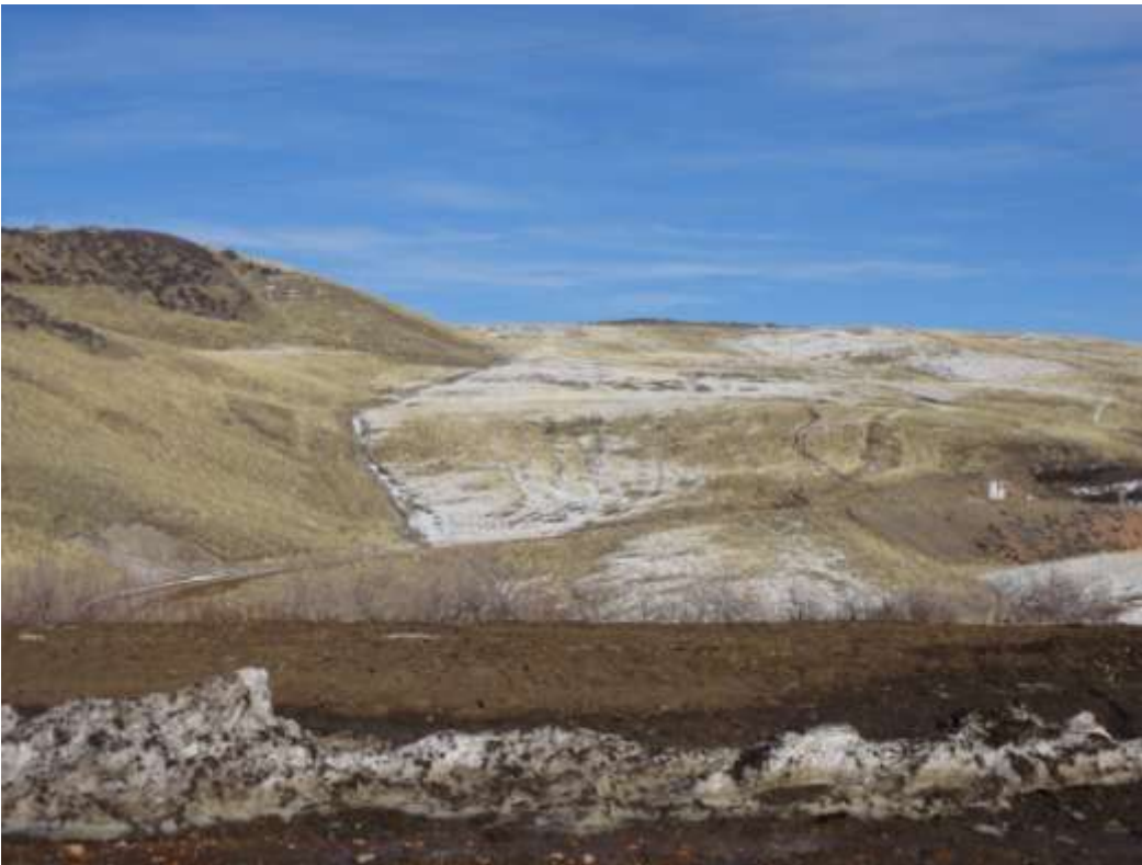
006 Drainage and Oil well site

Number of Partial Inspection this Fiscal Year: 11 Number of Complete Inspections this Fiscal Year: 3