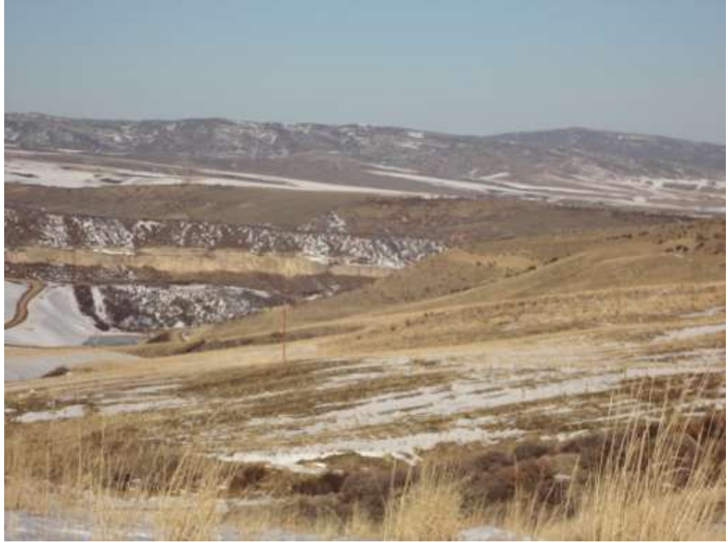
Looking down 006 Drainage to Pond 006