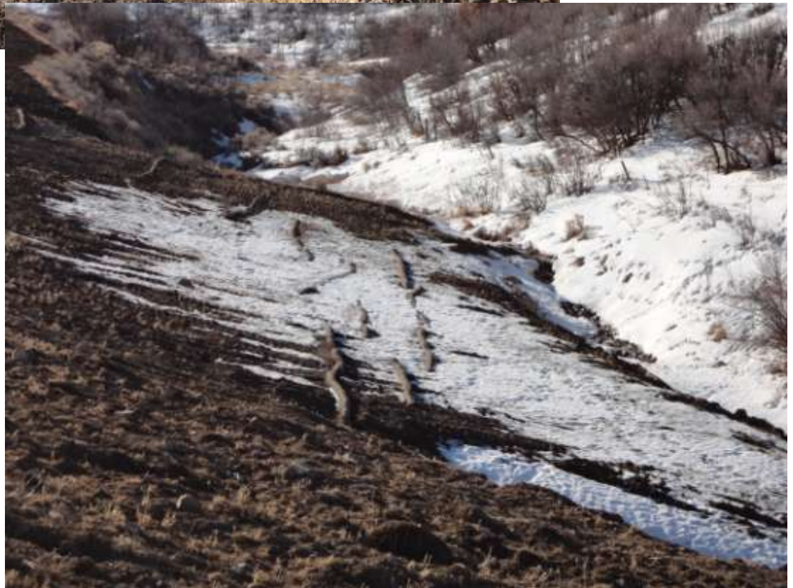
Reconstructed 006 Gulch

Number of Partial Inspection this Fiscal Year: 11 Number of Complete Inspections this Fiscal Year: 3