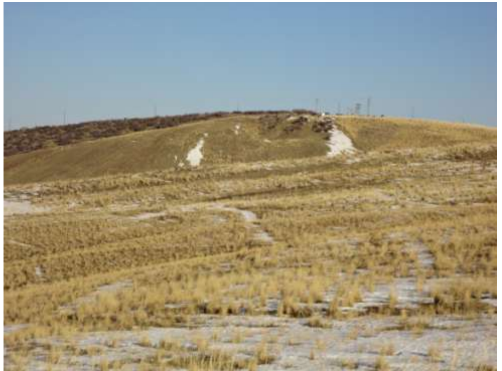
B Pit and Substation

Number of Partial Inspection this Fiscal Year: 11 Number of Complete Inspections this Fiscal Year: 3