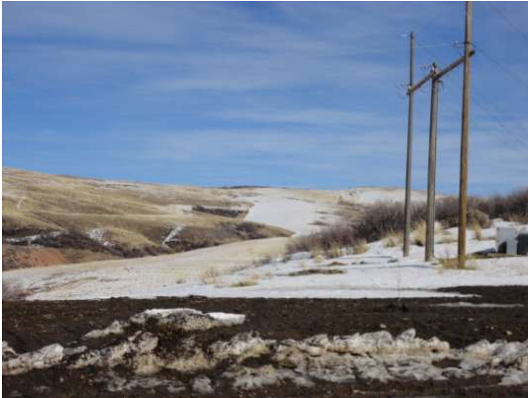
A Pit/Upper 006 Drainage