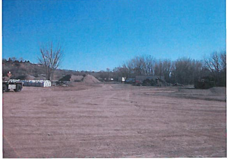
View from north side of office building, facing east.