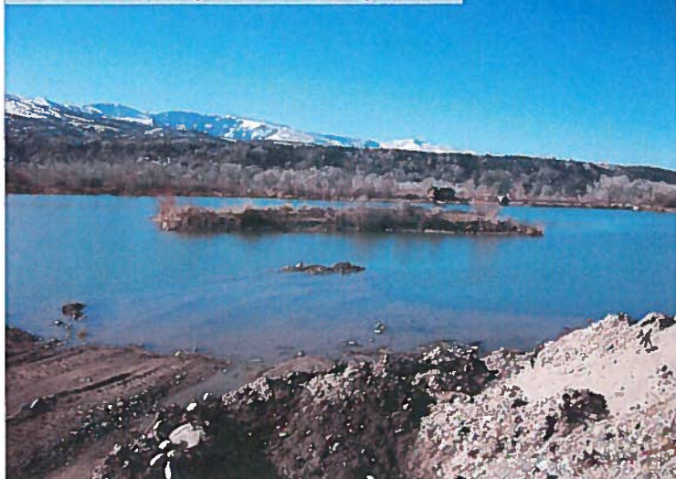
View from north-central part of lake bank, facing southwest.