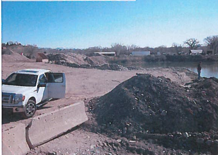
View from north-central part of lake bank, facing east.