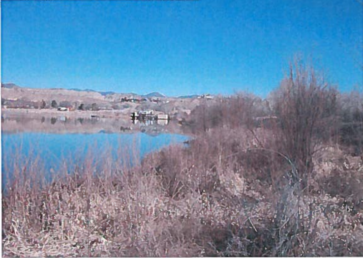
View from southeast corner of lake, facing north.