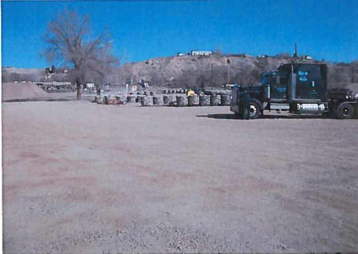
View from north side of office building, facing north.