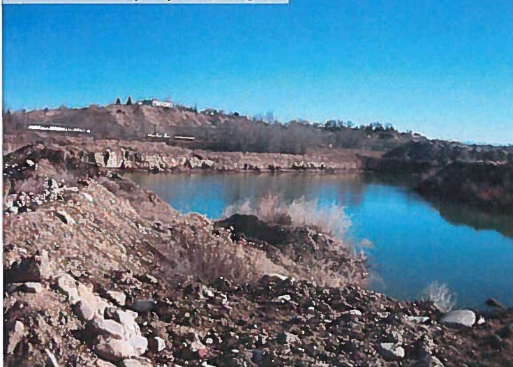
View from west side of pit in parcel D, facing east.