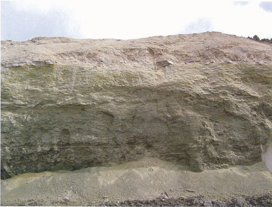
Photo 2: Bench 1 cut face cross-section; face is about 20 feet high.