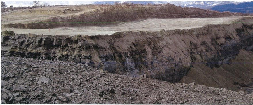
Photo 1: View of mine face showing Bench 1 material (upper face) and lower overburden material.