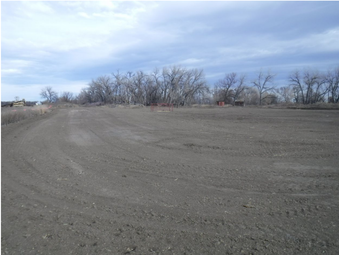
Photo 5: The permit area at the north end of the site affected by the oil and gas operation