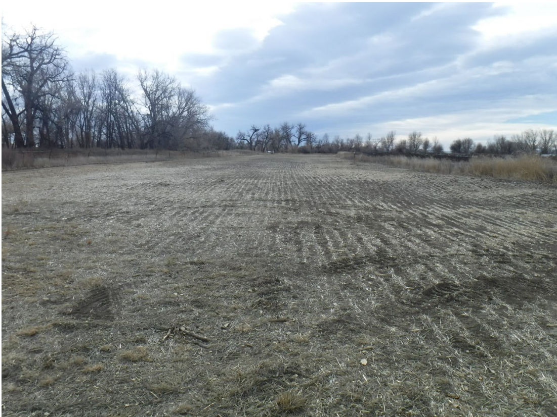
Photo 4: Looking south across the permit area from the northern end of the site