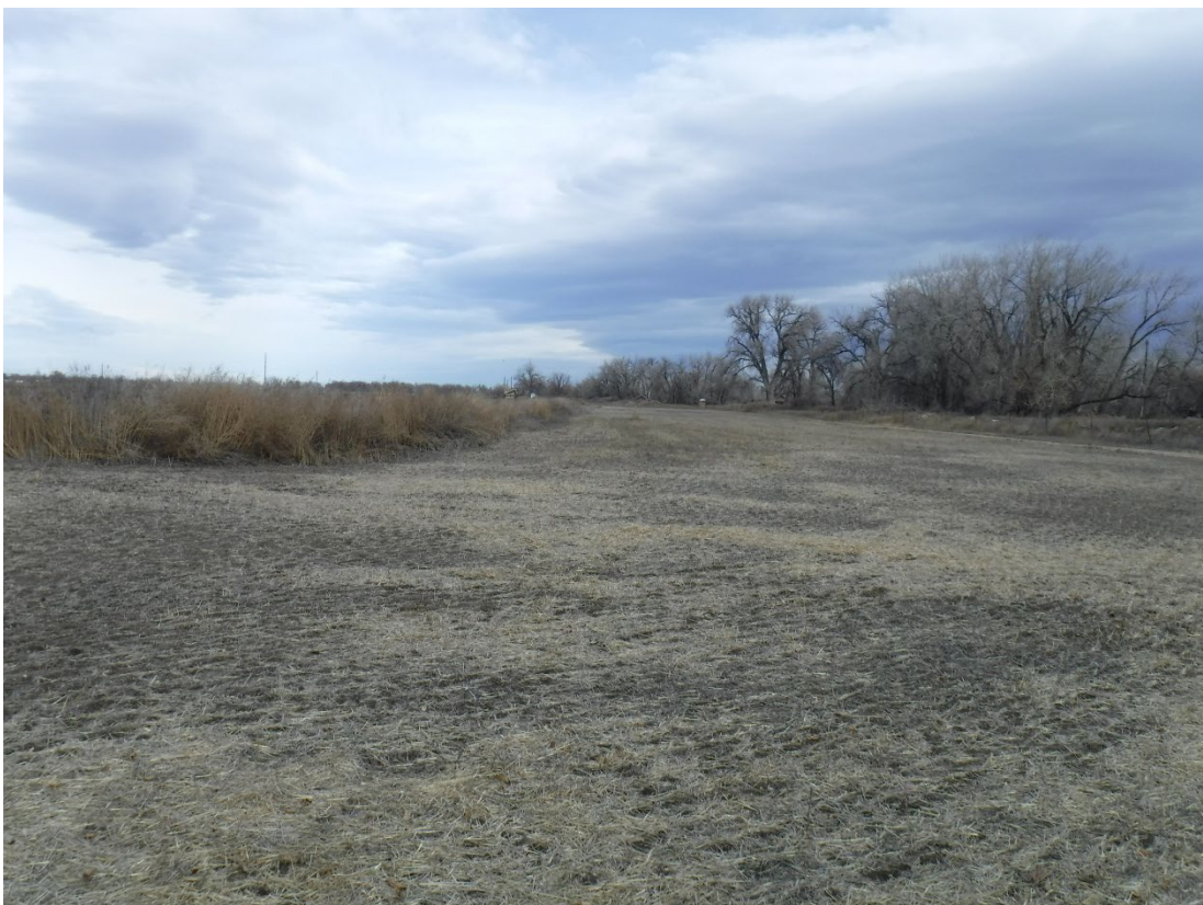
Photo 2: Looking north across the permit area from the southern end of the site