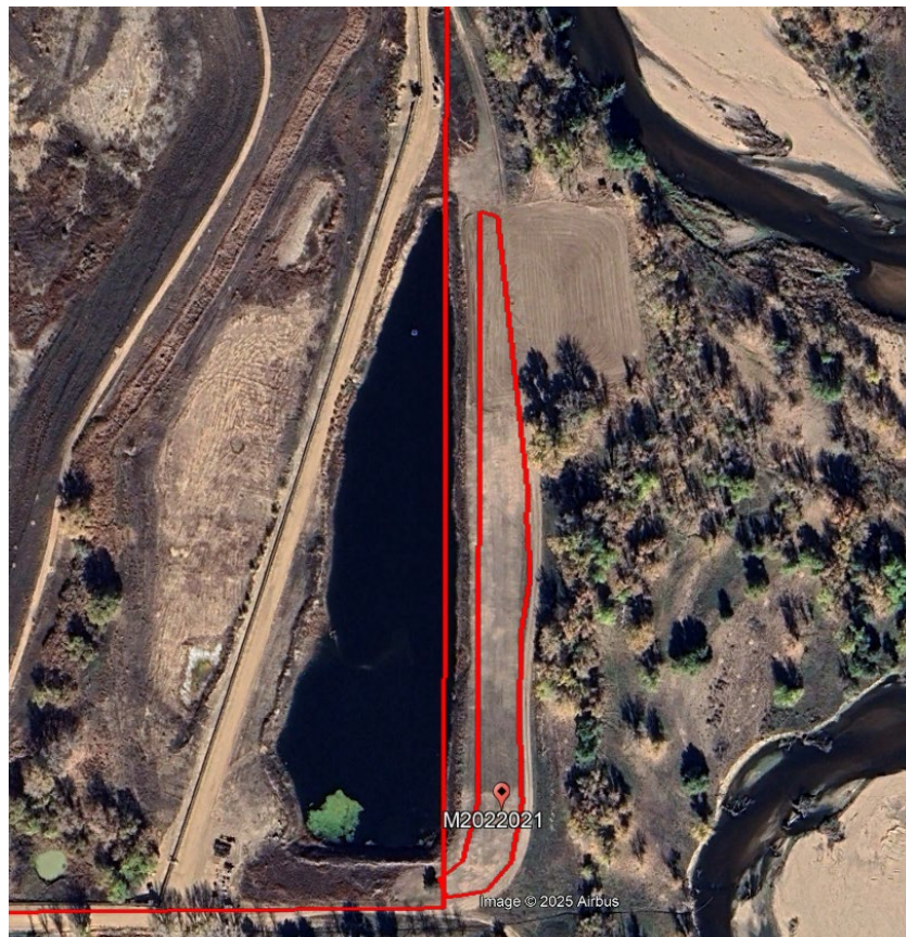
Photo 8: Aerial image from 11/2025 showing the site permit boundary and area affected by oil and gas operations