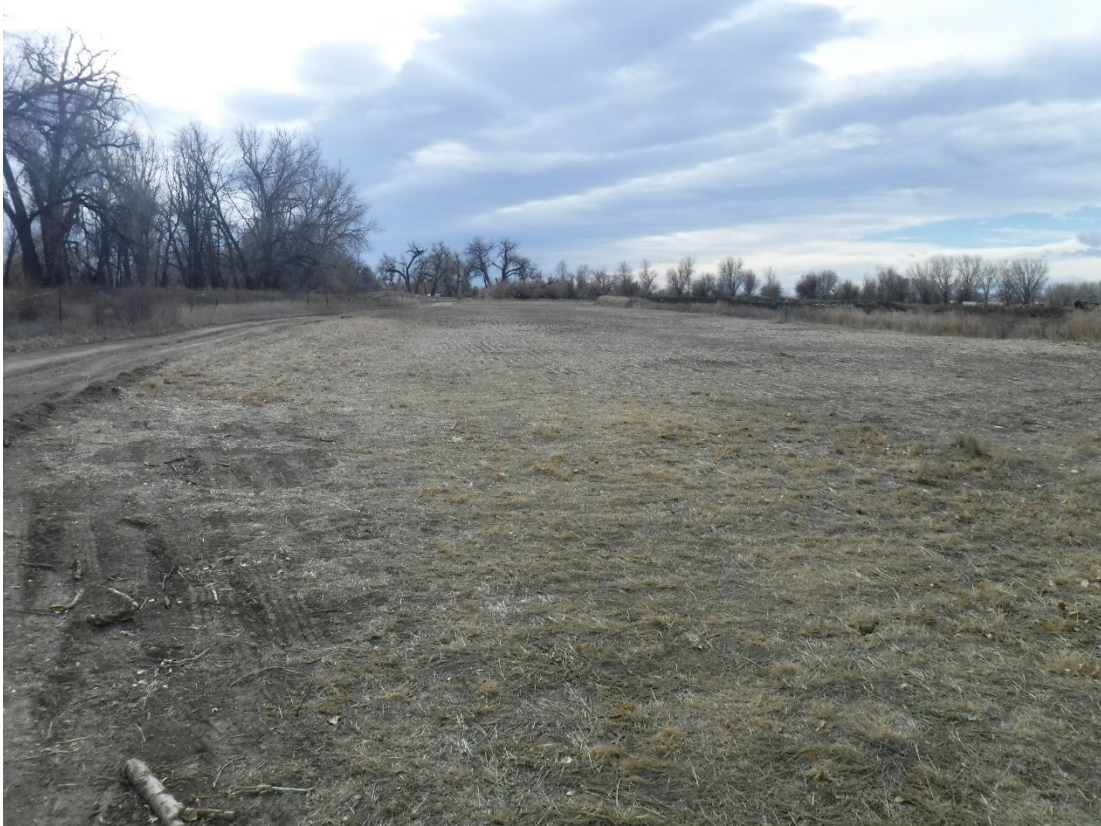
Photo 3: Looking south across the permit area from the northern end of the site