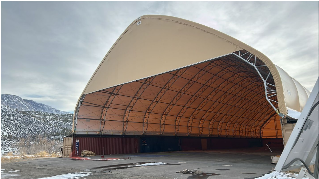
Figure 1: Temporary building