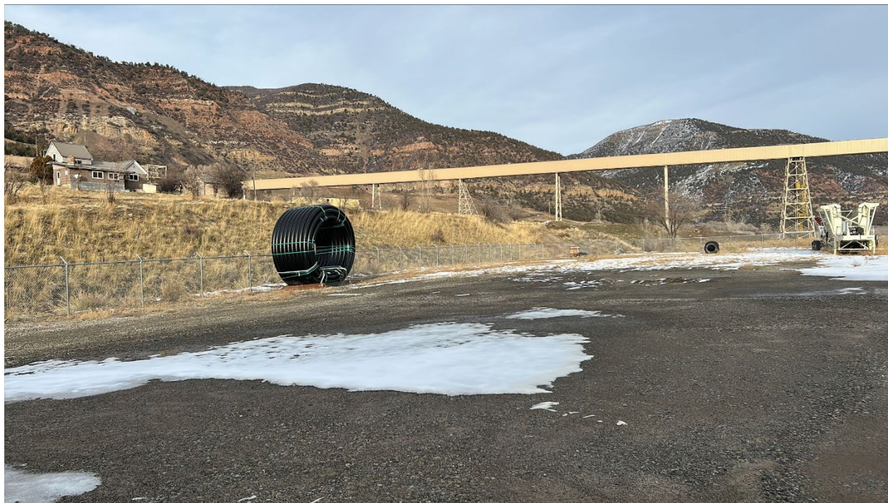
Figure 3: Lower pad and office building

Number of Partial Inspection this Fiscal Year: 4