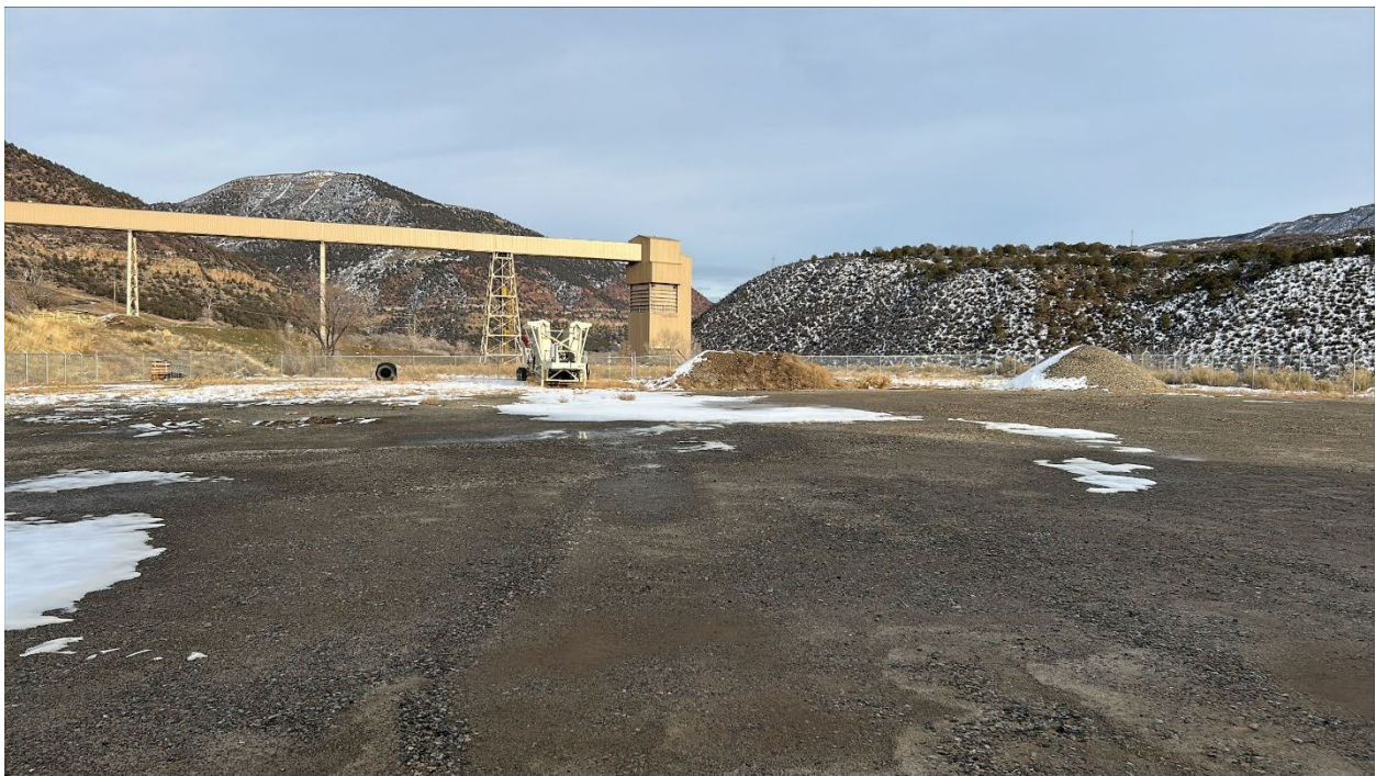
Figure 2: Lower pad

Number of Partial Inspection this Fiscal Year: 4