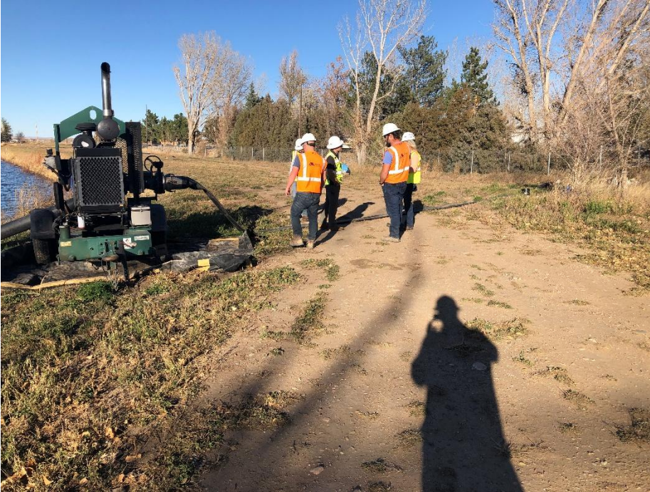
Photo 3. West pond, SE corner – looking northeast at pump (for lagged depletions) and dirt road