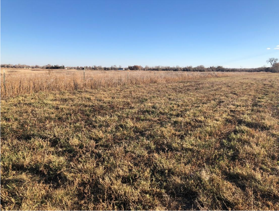
Photo 11. East pond, east side – more grasses along eastern permit boundary