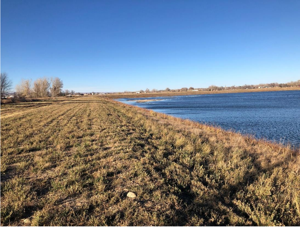
Photo 7. East pond, west side - looking north