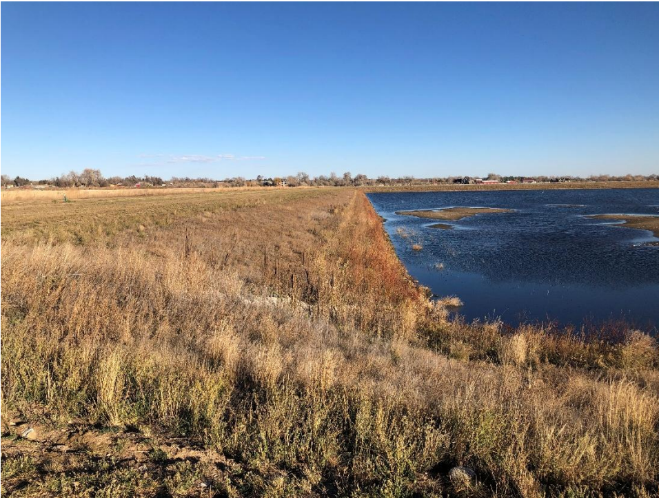
Photo 9. East pond, northwest corner - looking east