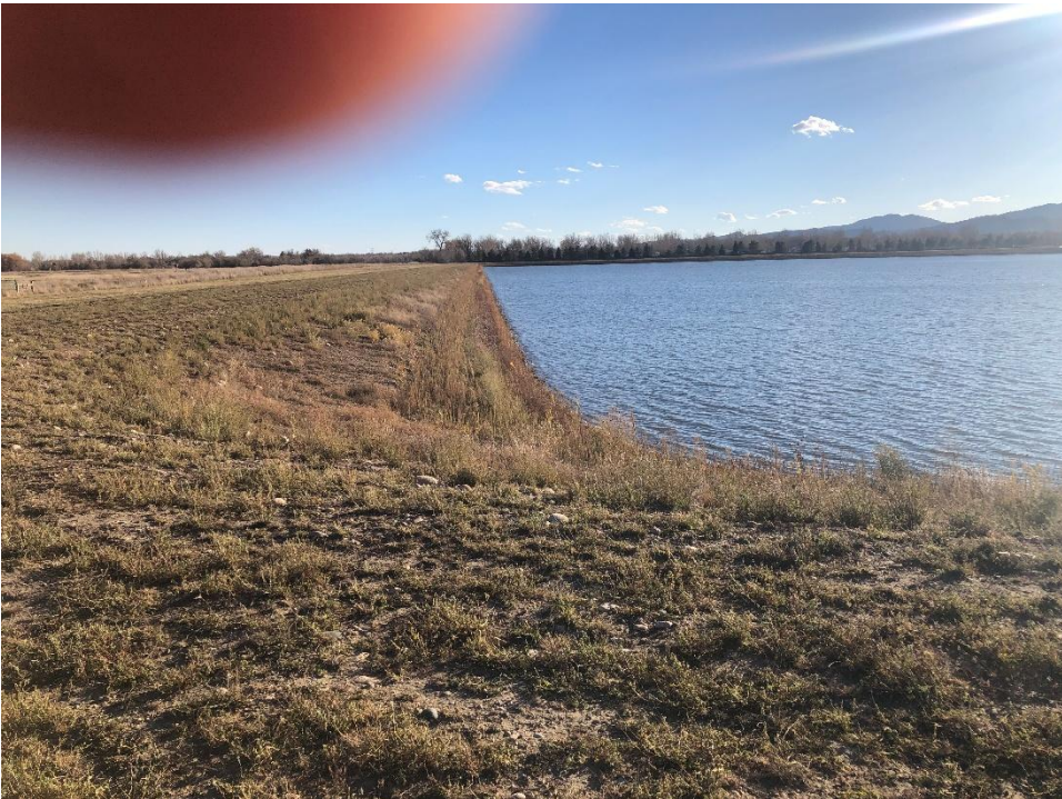
Photo 10. East pond, northeast corner - looking south