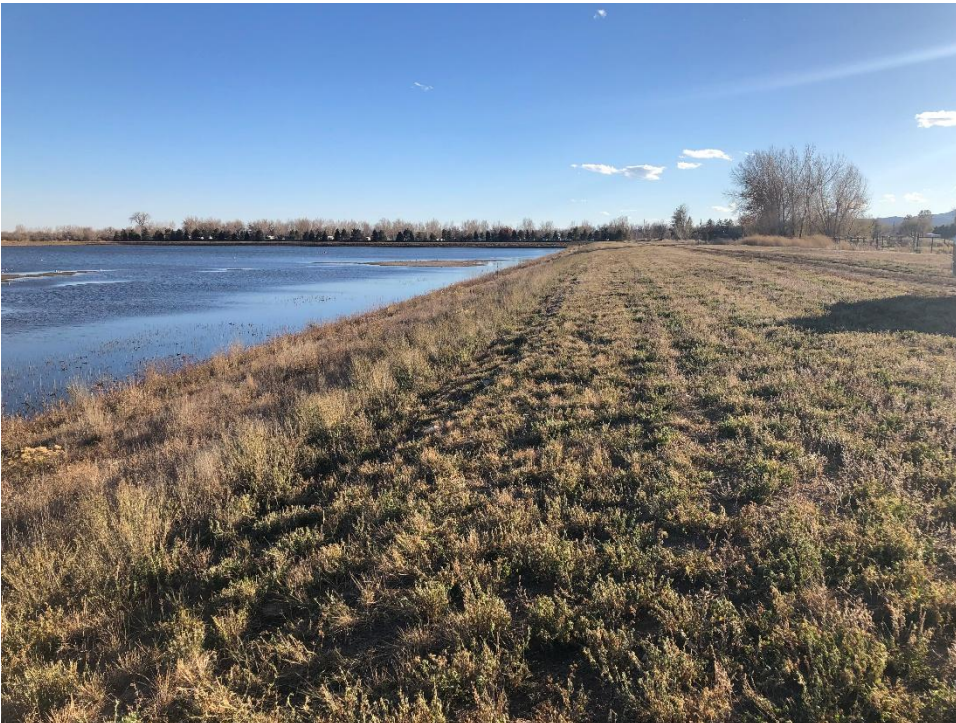
Photo 8. East pond, northwest corner - looking south