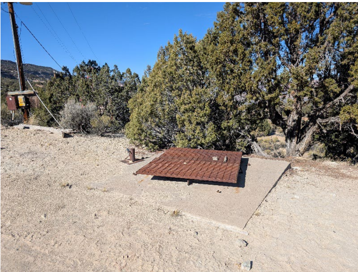
Vent shaft secured with steel grating welded to collar