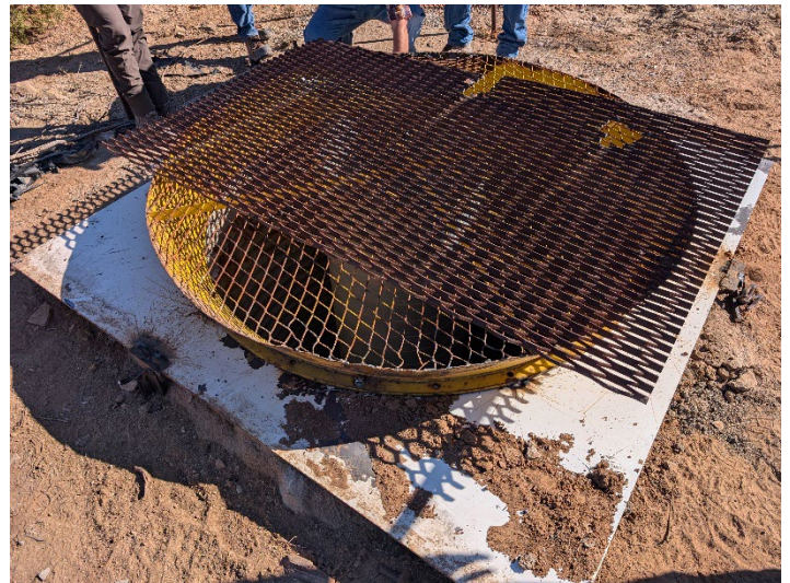
Ventilation fan shaft – fan removed, shaft not yet secured with the appropriate grating