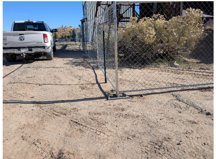
Head frame and hoist/compressor structures remain on site. Temporary fencing installed.