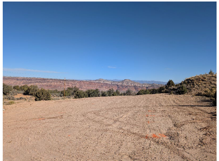
Ore bin area – debris removed, area regraded, seeded