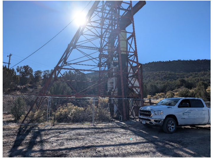
Head frame and hoist/compressor structures remain on site. Temporary fencing installed.