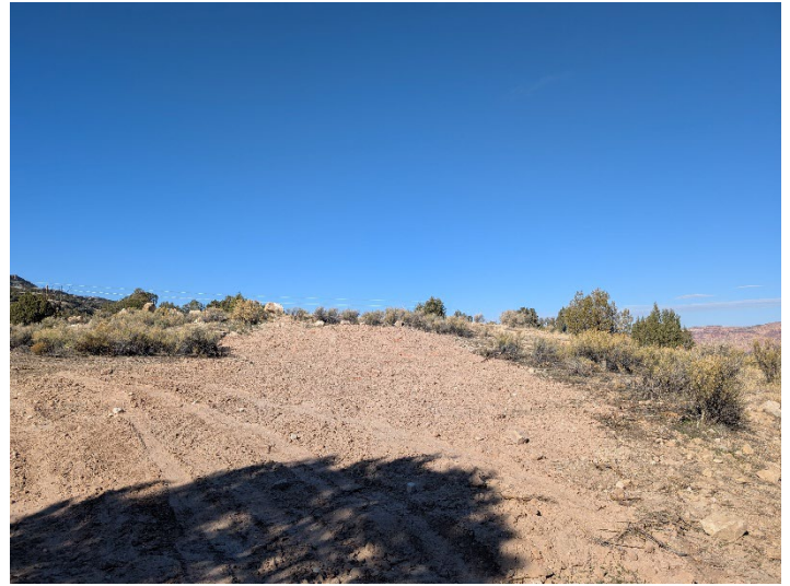
Joe Dandy Decline area – debris removed, area regraded, seeded