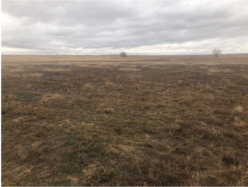
West side of Area 25 with many Russian thistle plants and recently mowed