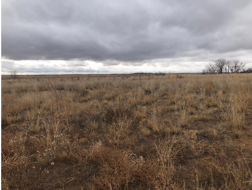
Area 38 with good cover (looking west from fence)