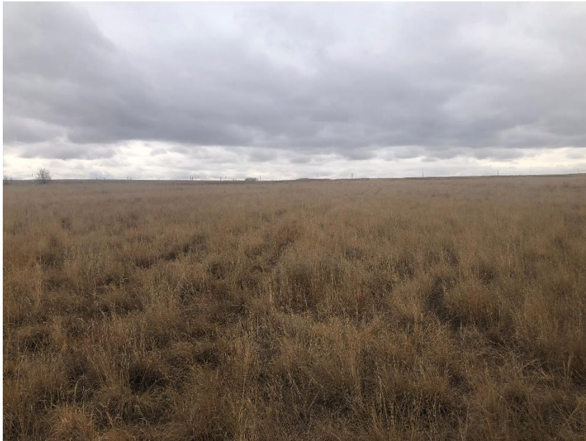
Good grass cover on the east side of Area 33

Number of Partial Inspection this Fiscal Year: 2