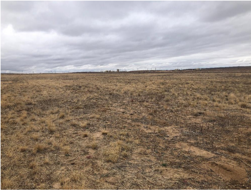
Area 37, recently mowed

Number of Partial Inspection this Fiscal Year: 2