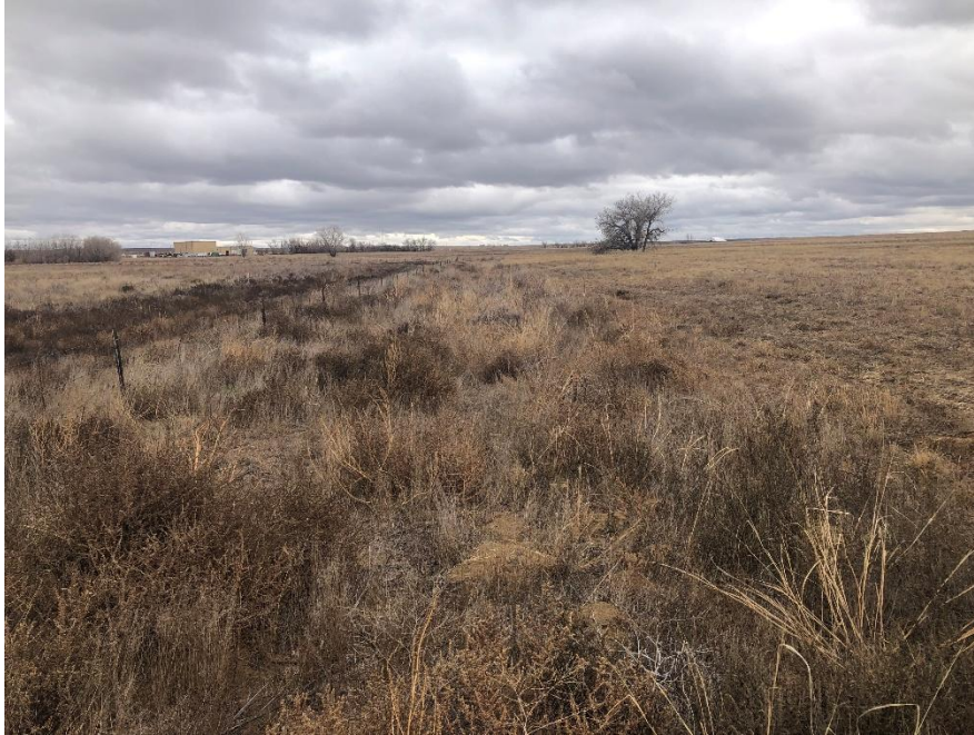
North boundary with good cover but many Russian thistle plants (looking southeast)