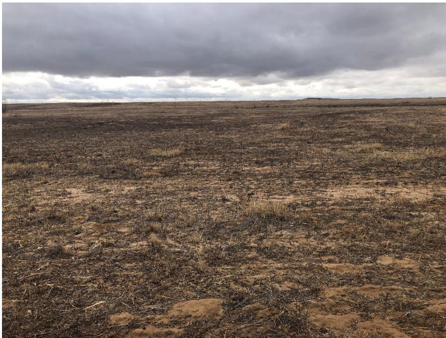
Area 34, mowed (looking west from fence)

Number of Partial Inspection this Fiscal Year: 2