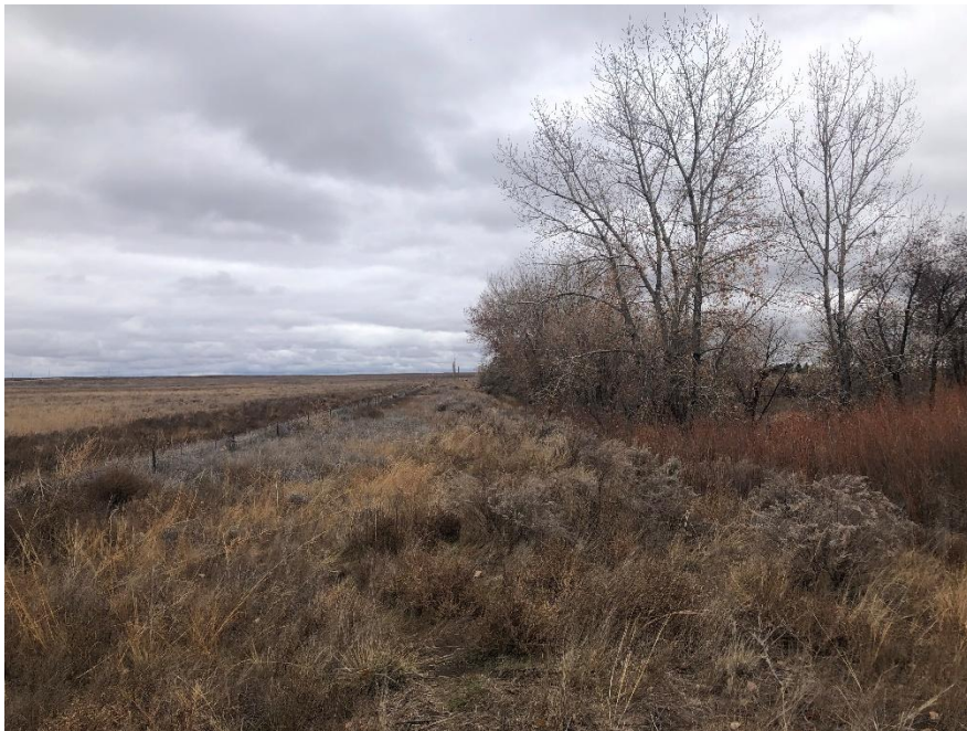
Area below Sediment Pond 2

Number of Partial Inspection this Fiscal Year: 2