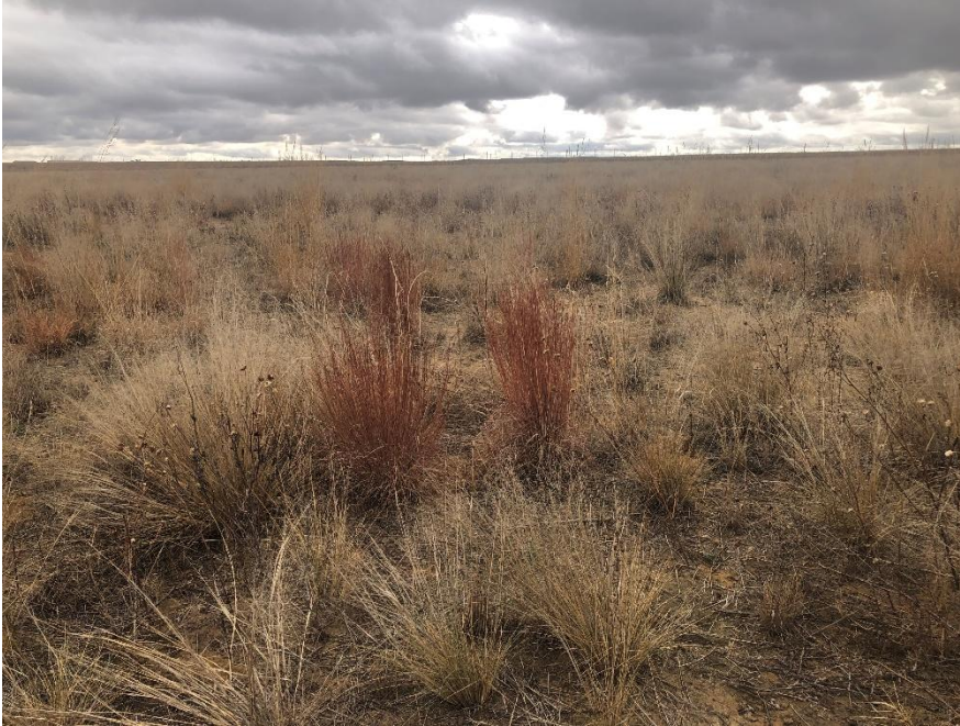
Good grass cover in middle of Area 36