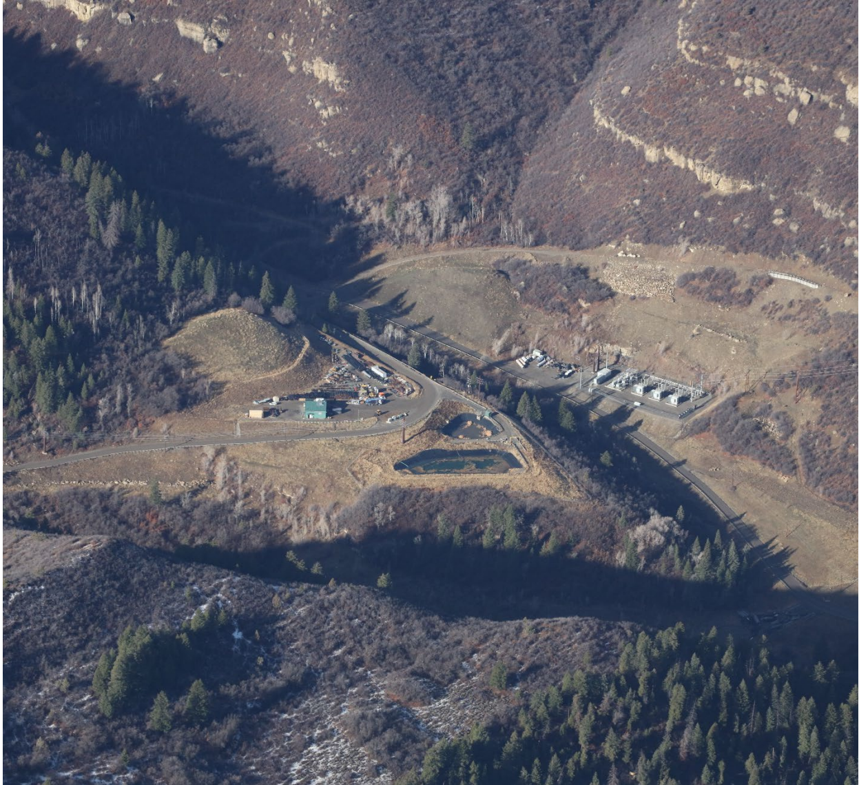
Figure 9: Sylvester Gulch Mine Water Pumping Facility

Number of Partial Inspection this Fiscal Year: 4