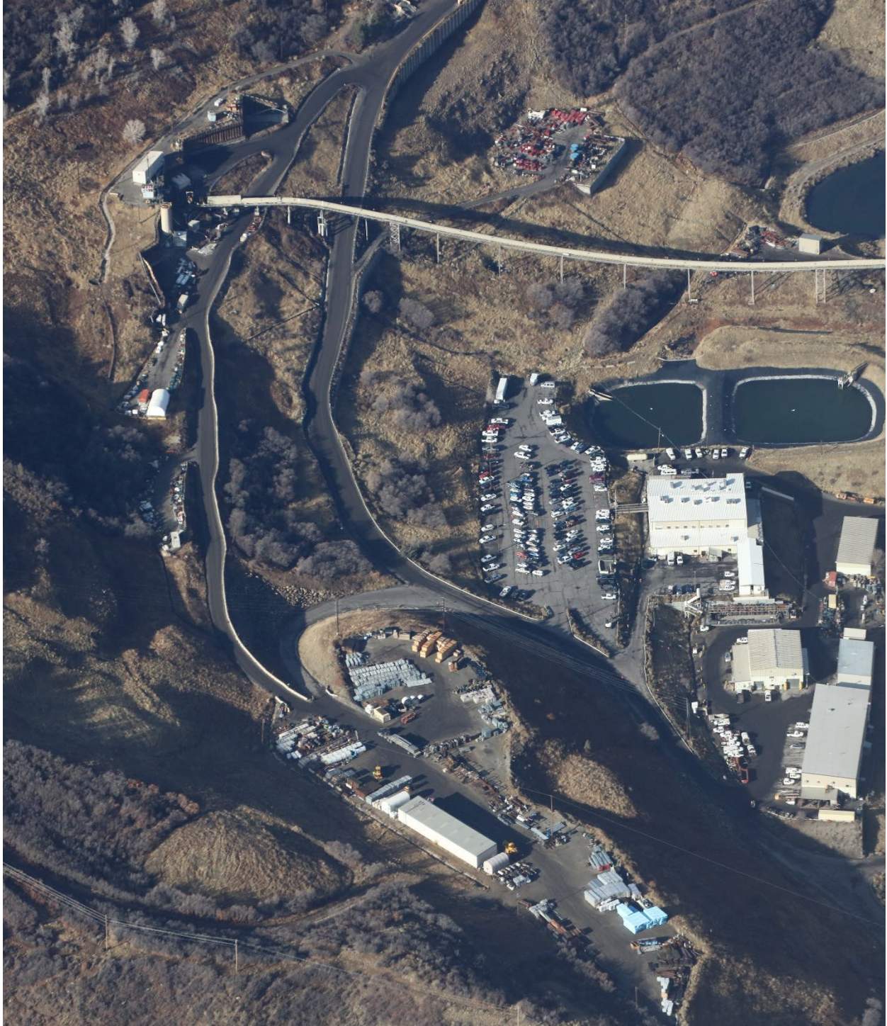
Figure 6 Office and shop buildings, FW ponds, MSB, C1 conveyor and portal

Number of Partial Inspection this Fiscal Year: 4