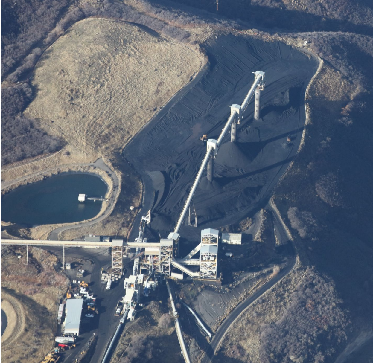
Figure 3: Run-of-mine coal stockpile

Number of Partial Inspection this Fiscal Year: 4