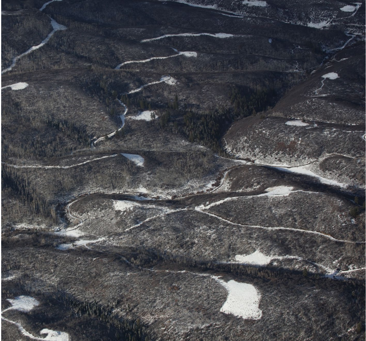
Figure 10: MVB pads and roads

Number of Partial Inspection this Fiscal Year: 4