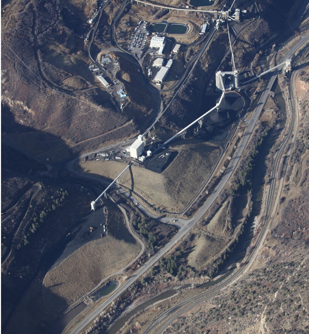
Figure 2: Overview of main facilities (east)

Number of Partial Inspection this Fiscal Year: 4