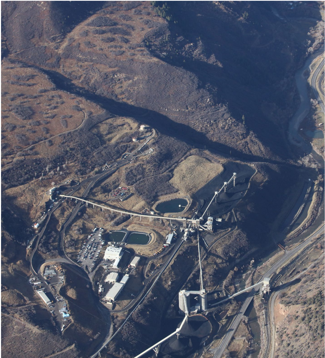
Figure 1: Overview of main facilities (west)

Number of Partial Inspection this Fiscal Year: 4