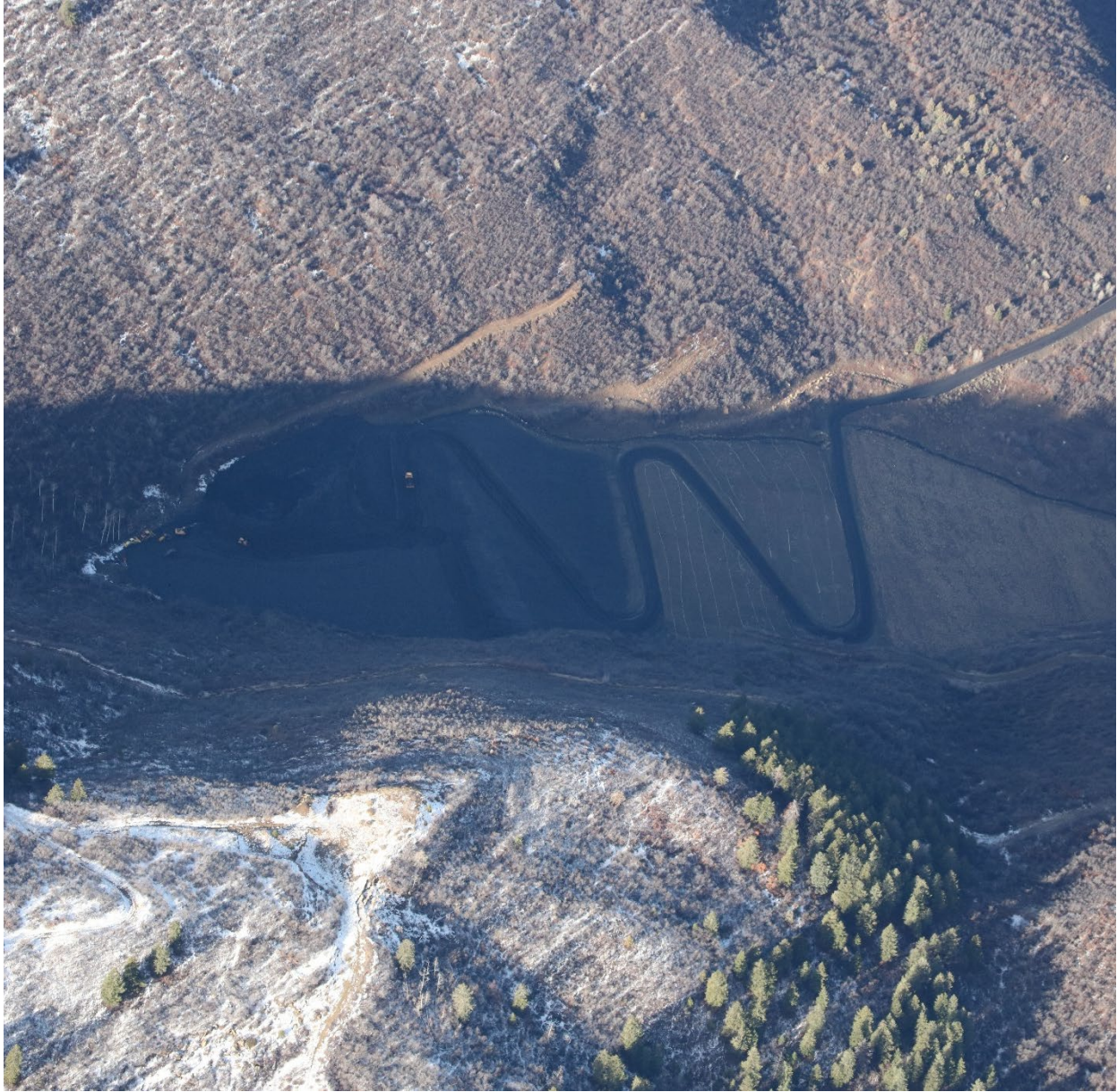
Figure 8: RPEE

Number of Partial Inspection this Fiscal Year: 4