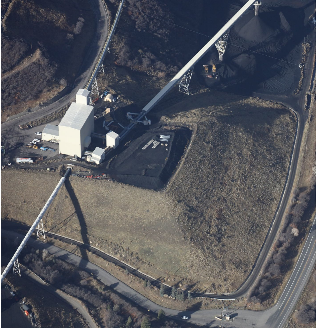
Figure 5: Prep plant and LRP

Number of Partial Inspection this Fiscal Year: 4