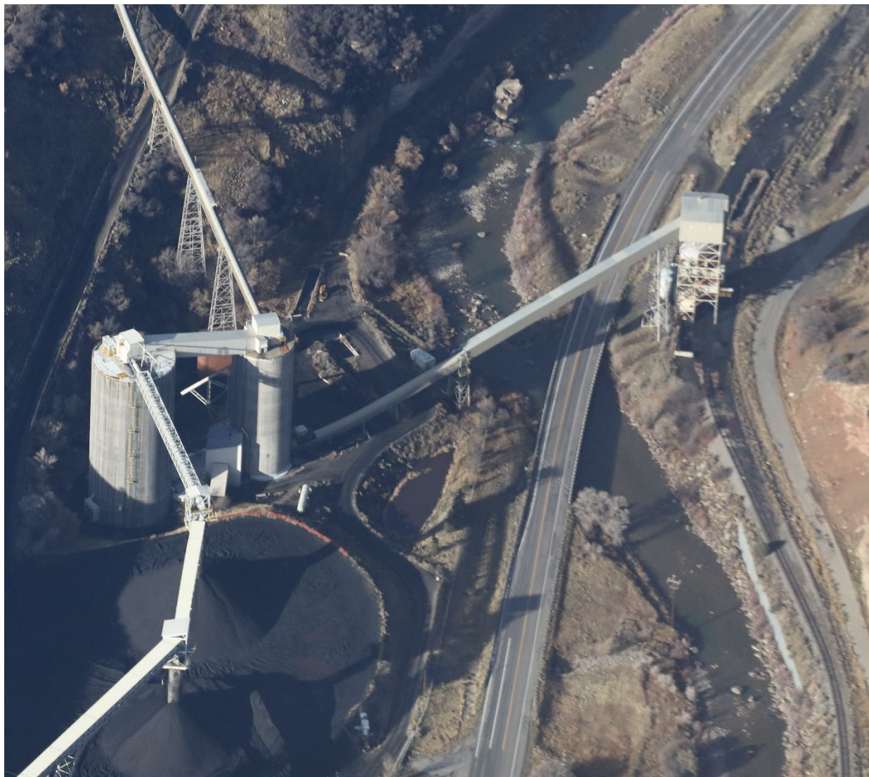
Figure 4: Silos, clean coal stockpile and train loadout

Number of Partial Inspection this Fiscal Year: 4