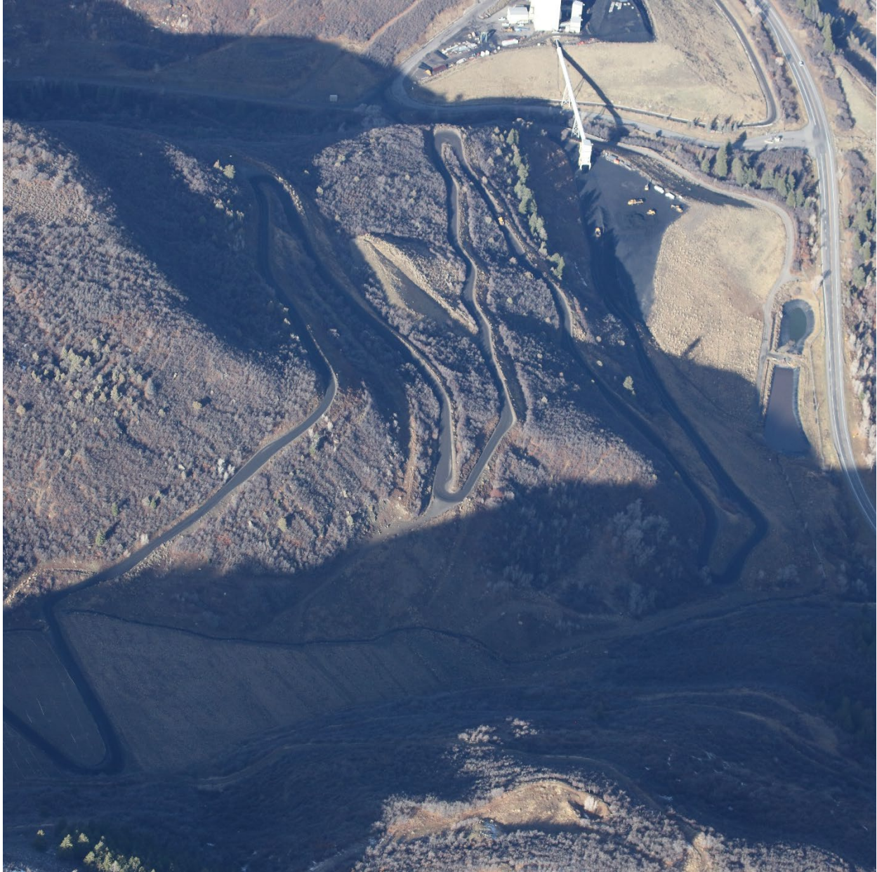
Figure 7: RPE and RPEE haul road

Number of Partial Inspection this Fiscal Year: 4