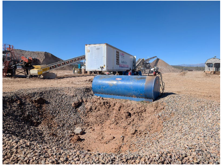
Fuel tank lacking secondary containment