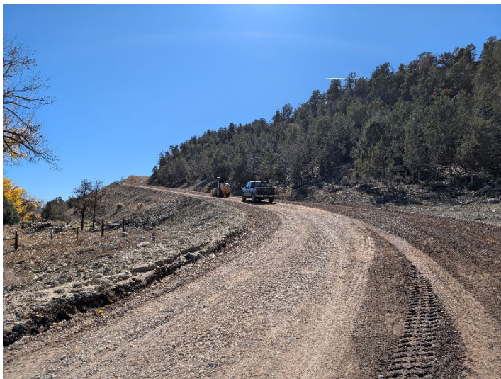
Access road to site