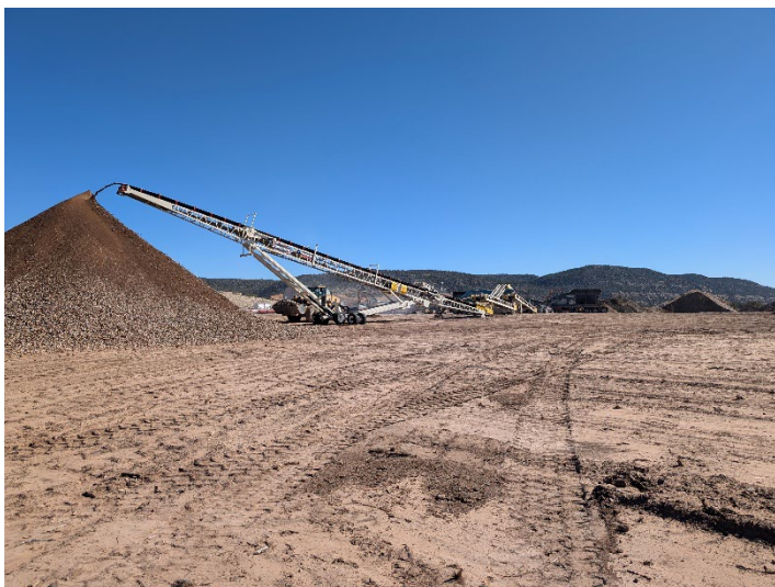
Crushing in Phase 1 area