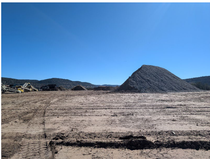
Current mining in Phase 1 area. Topsoil not yet cleared.