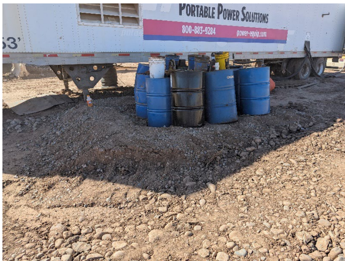
Oil barrels lacking secondary containment