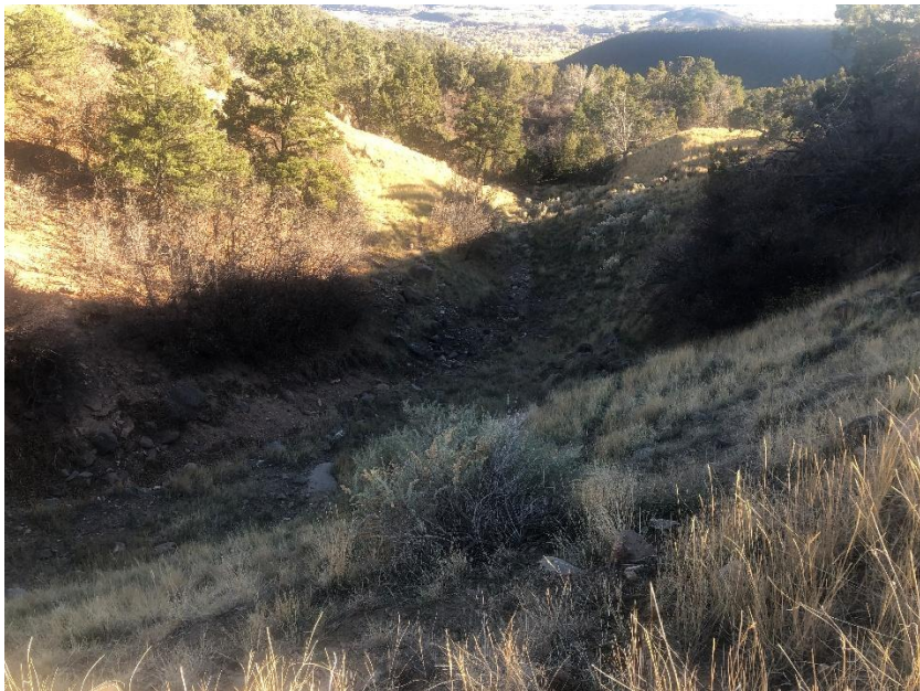
East Mine – looking down at reclaimed Pond 2

Number of Partial Inspection this Fiscal Year: 3