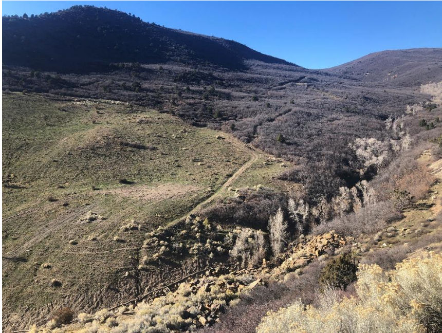
West Mine – road along northern side of main portion