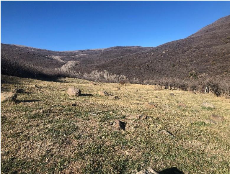
West Mine – reclaimed fan area

Number of Partial Inspection this Fiscal Year: 3