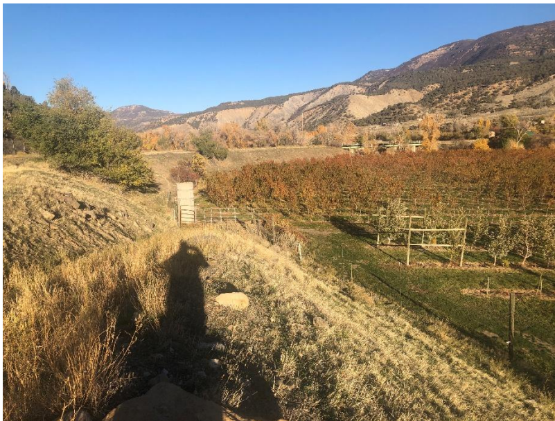
Loadout, looking toward bridge

Number of Partial Inspection this Fiscal Year: 3