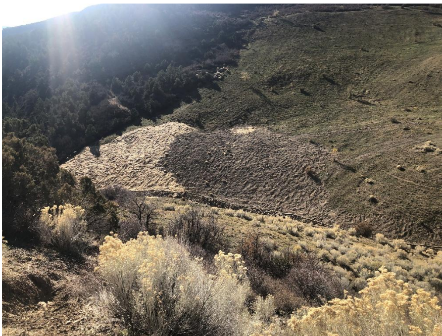
West Mine – straw on portion of reclamation

Number of Partial Inspection this Fiscal Year: 3