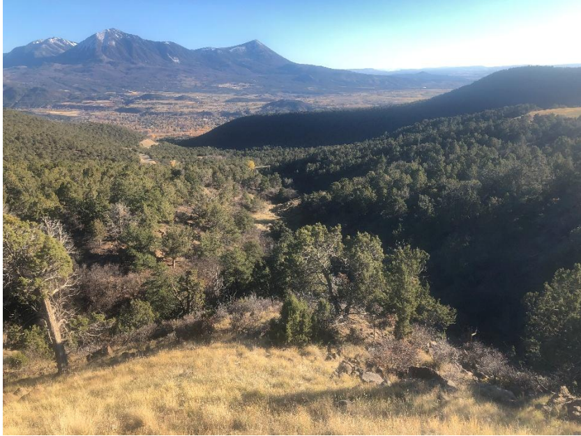
East Mine – looking down at reclaimed Ponds 3 and 4