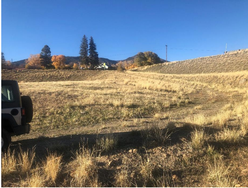
Coal storage by highway, looking up toward highway