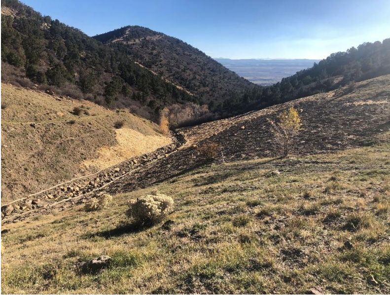
West Mine – reclaimed creek