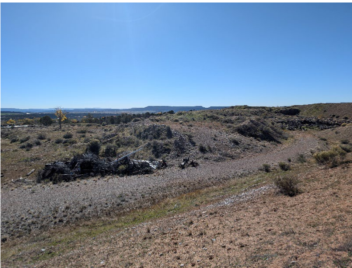
From north end of Phase 3 area, facing south