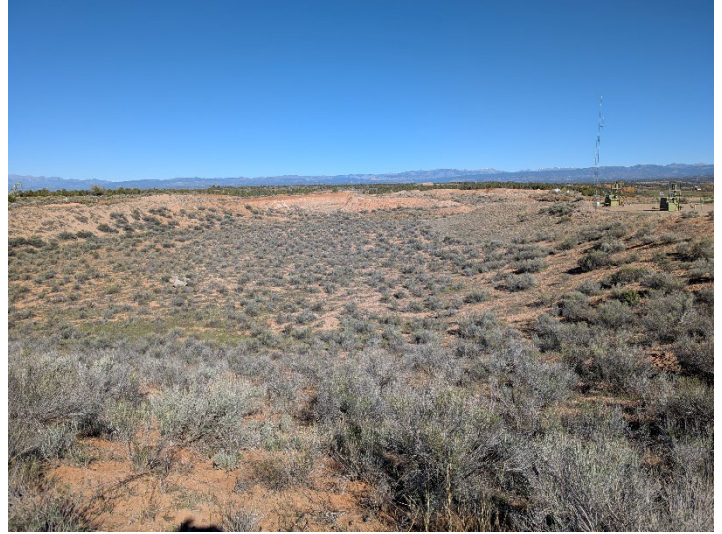
From south side of Phase 1 area, facing north