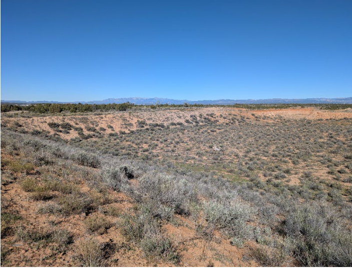
From south side of Phase 1 area, facing north