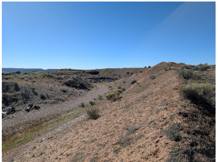
From north end of Phase 3 area, facing south