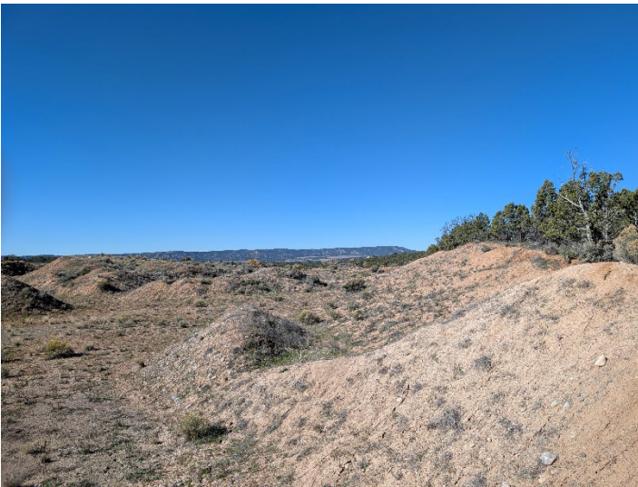
From NE corner of site, in Phase 2 area, facing west