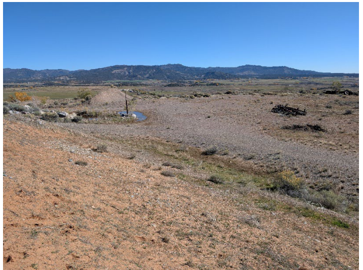
From north end of Phase 3 area, facing south