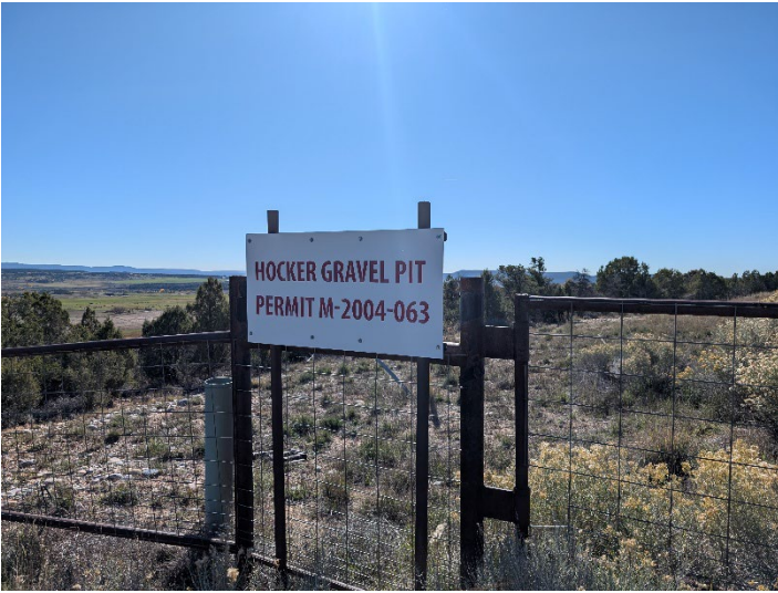
Sign at site entrance