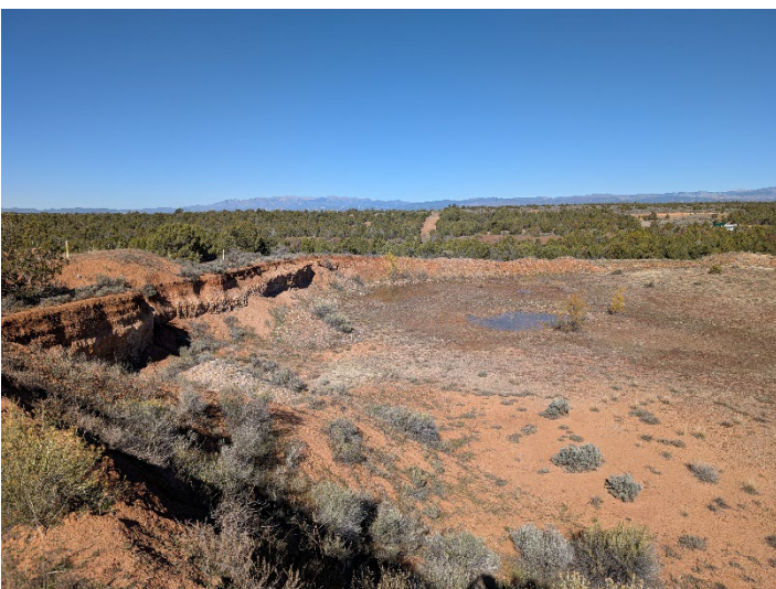
From south side of Phae 2 area, facing north