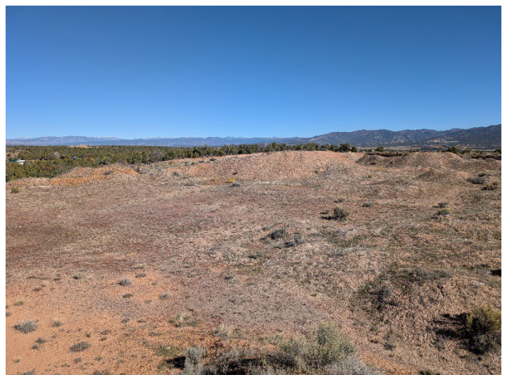
From south side of Phae 2 area, facing north