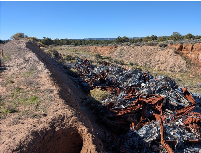
Construction debris approved for burial through TR1