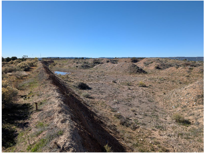
From NE corner of site, in Phase 2 area, facing south