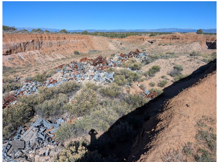
Construction debris approved for burial through TR1