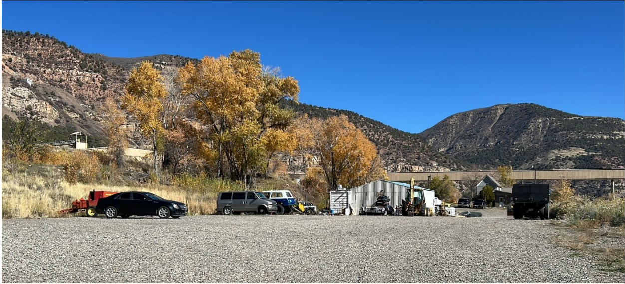
Figure 1: Upper pad