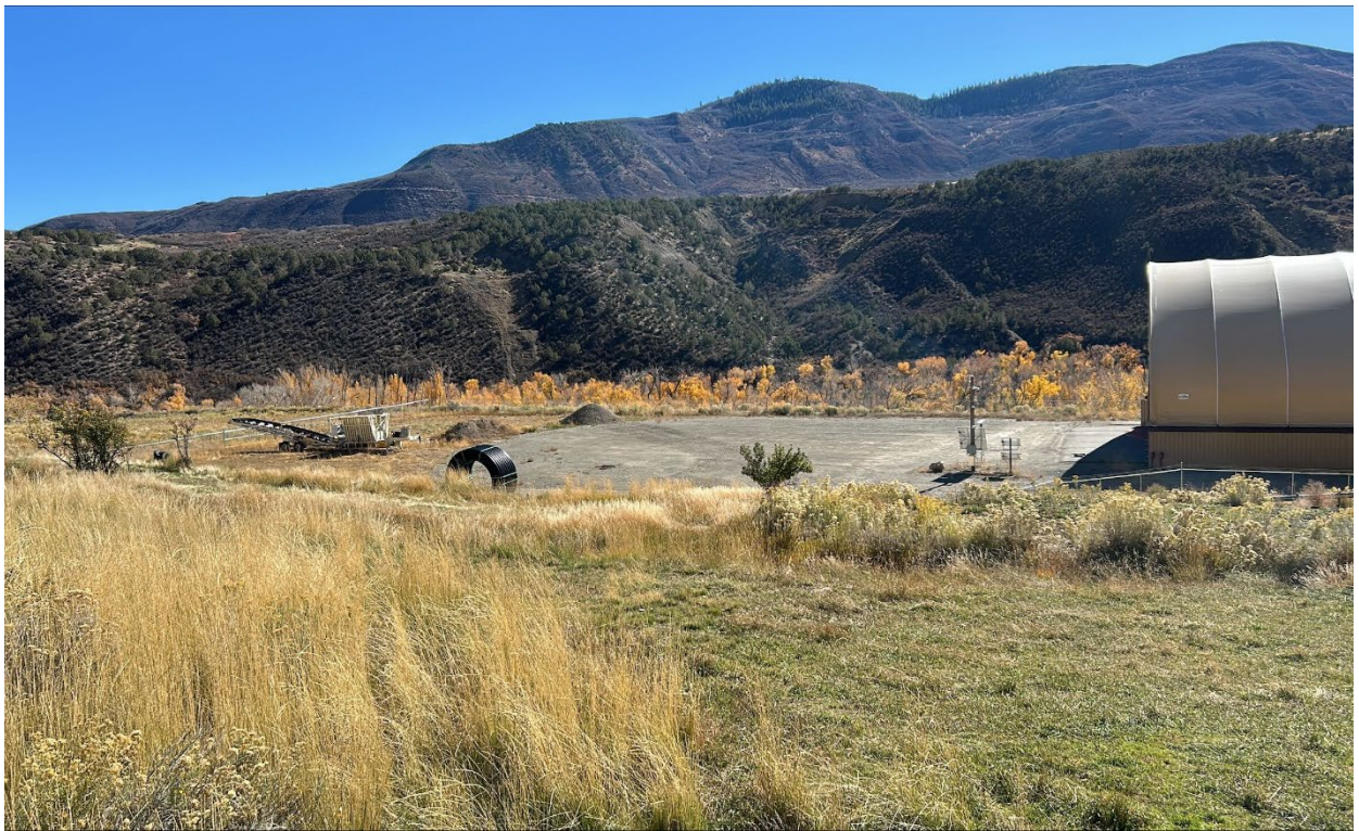
Figure 2: Lower pad (east)

Number of Partial Inspection this Fiscal Year: 3