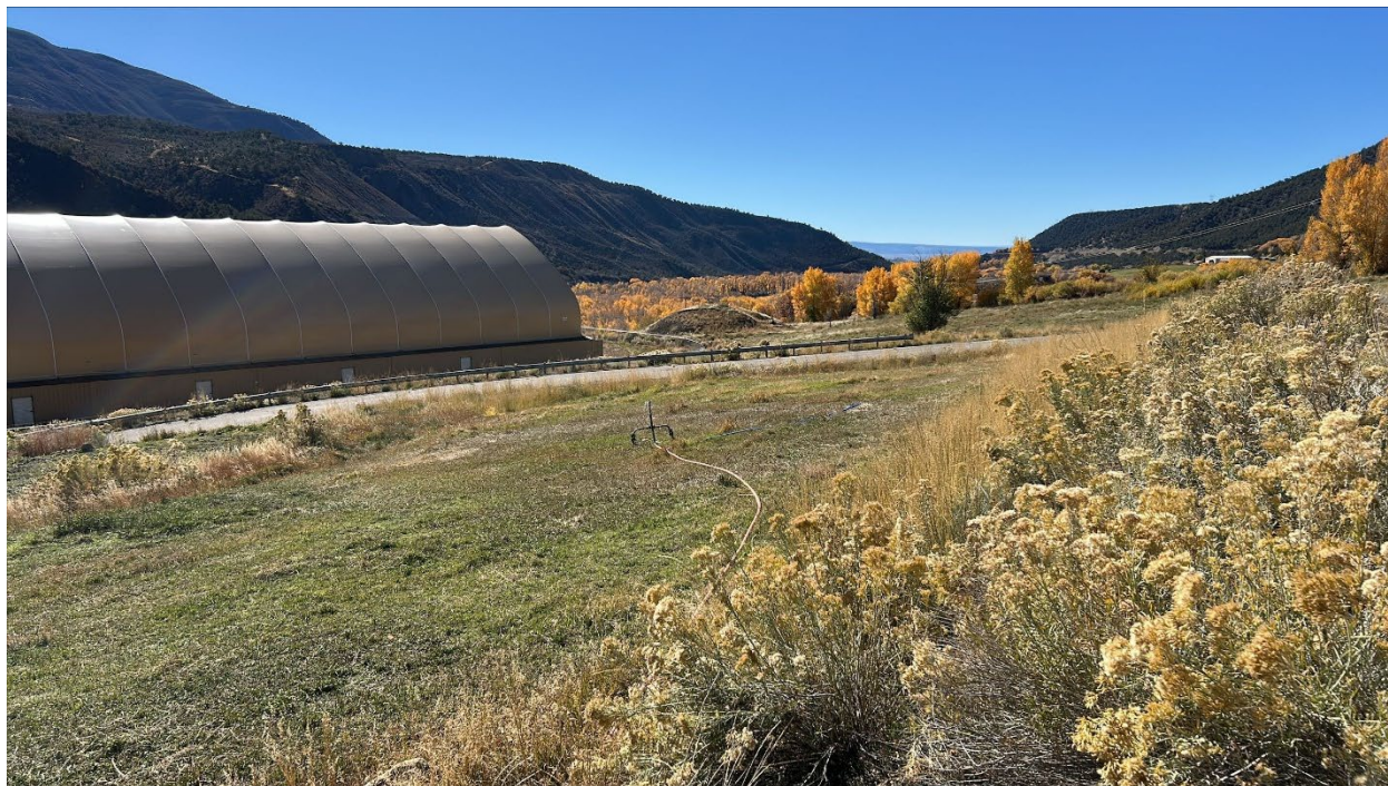
Figure 3: Lower pad (west)

Number of Partial Inspection this Fiscal Year: 3