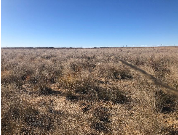
Looking south at good cover in Area 36 (reclaimed Long Term Spoil Area)