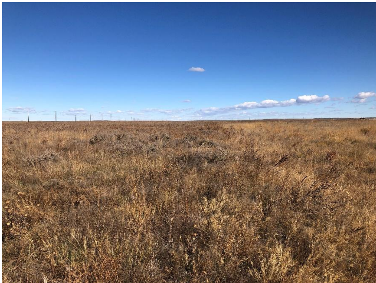
Good cover at west side of site, looking north with reclaimed area on right (note white permit boundary markers)

Number of Partial Inspection this Fiscal Year: 1