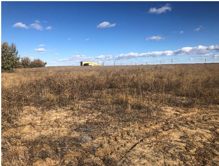
Looking north at good cover in Area 38 (south of facilities area)

Number of Partial Inspection this Fiscal Year: 1