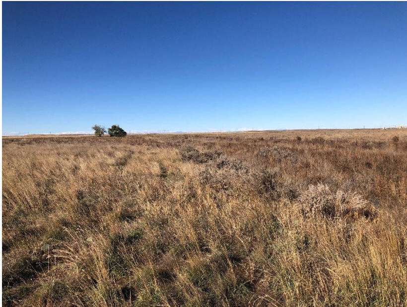
North side of permit area, with ditch (looking west)

Number of Partial Inspection this Fiscal Year: 1