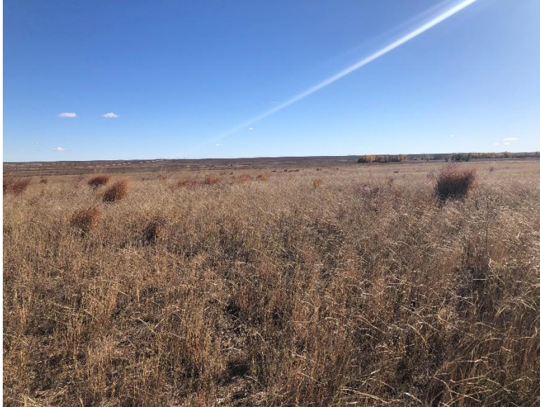
Good vegetation cover in Area 43