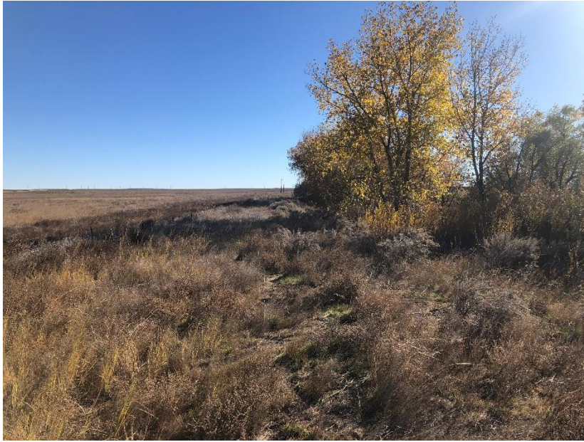
Area below Sediment Pond 2