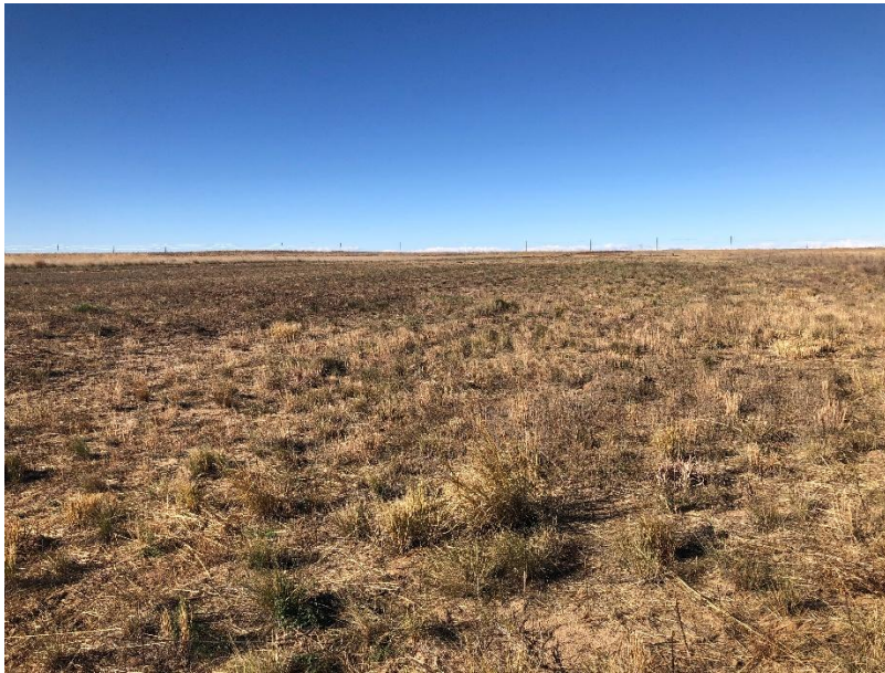
Mowed vegetation in Area 37 (north central portion of site)

Number of Partial Inspection this Fiscal Year: 1