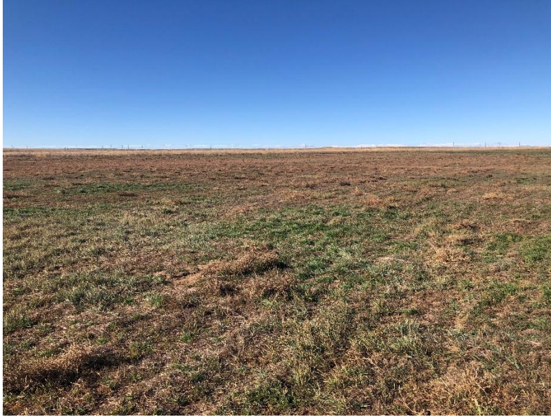
Mowed vegetation in Area 42 (west of Area 26)