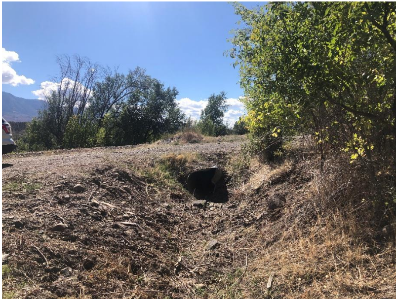
Lower end of 36-inch diameter culvert for ditch that flows to pond

Number of Partial Inspection this Fiscal Year: 3