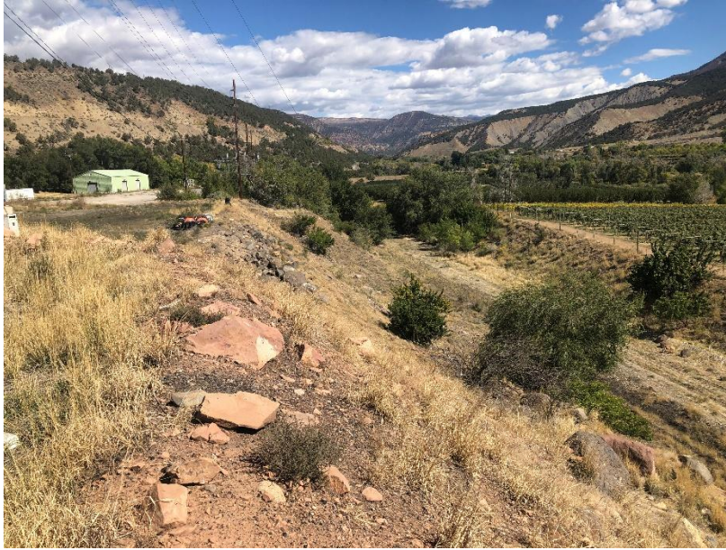
Slope below substation at loadout