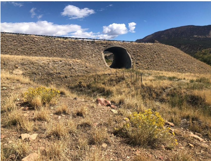
Pond at coal storage area by Highway 133

Number of Partial Inspection this Fiscal Year: 3