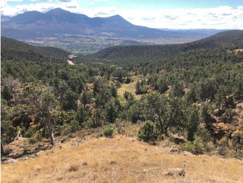
Area of reclaimed Ponds 3 and 4 at East Mine