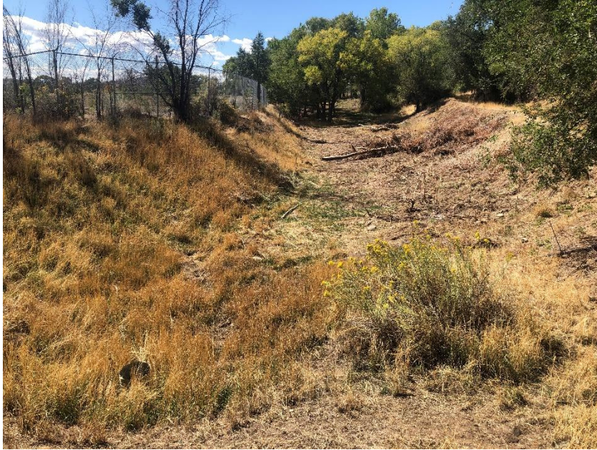
Pond at loadout