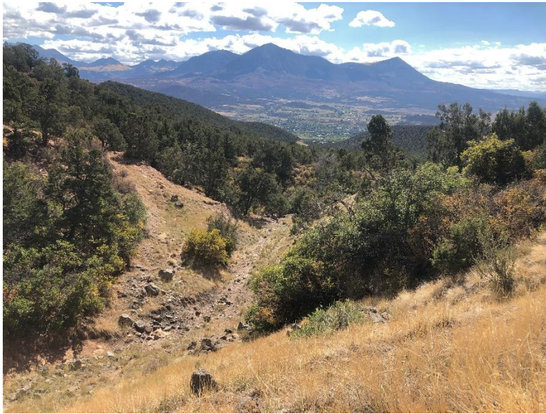
Area of reclaimed Pond 2 at East Mine

Number of Partial Inspection this Fiscal Year: 3