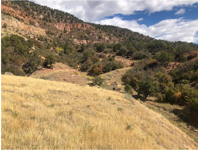
Area of reclaimed Pond 1 at East Mine