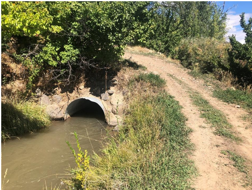
Lower end of 600-foot long culvert for the Farmers Ditch

Number of Partial Inspection this Fiscal Year: 3