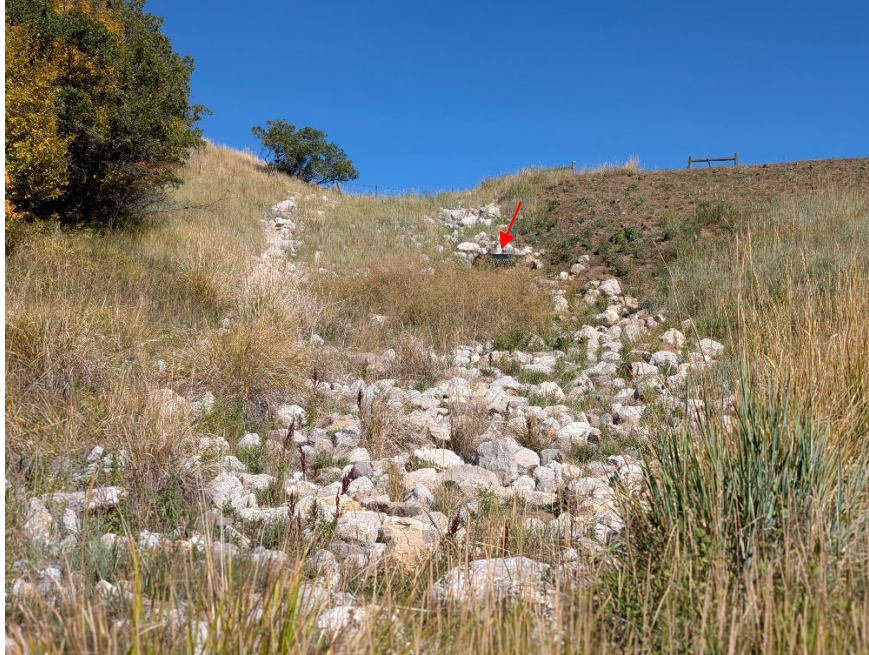
Photo 7: Spillway below Pond 14. No discharge at the time of inspection. Culvert noted by red arrow.