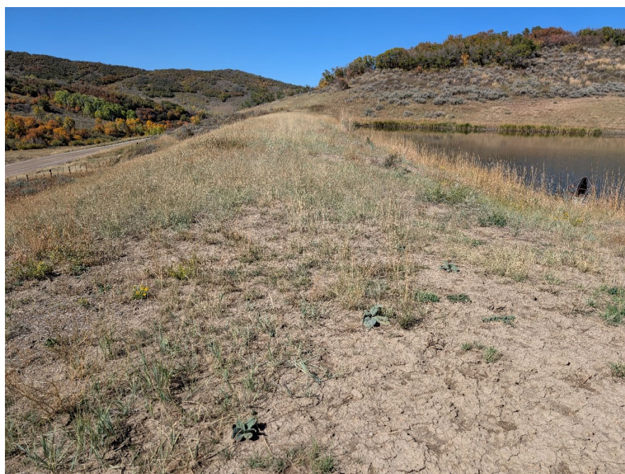
Photo 4: Vegetated embankment on Pond 13. A few houndstongue plants were observed in this area.

Number of Partial Inspection this Fiscal Year: 2