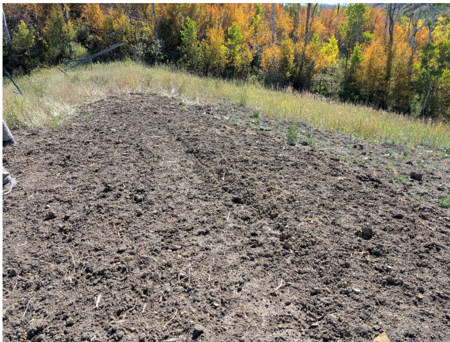
Photo 6: Top of the embankment on Pond 14. Cracks in the embankment were recently repaired across and down the slope here.

Number of Partial Inspection this Fiscal Year: 2