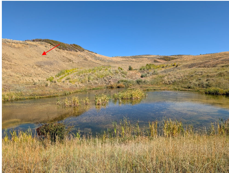
Photo 1: Looking east across Pond 12. Steep slope above the north side of the pond appeared stable (red arrow).