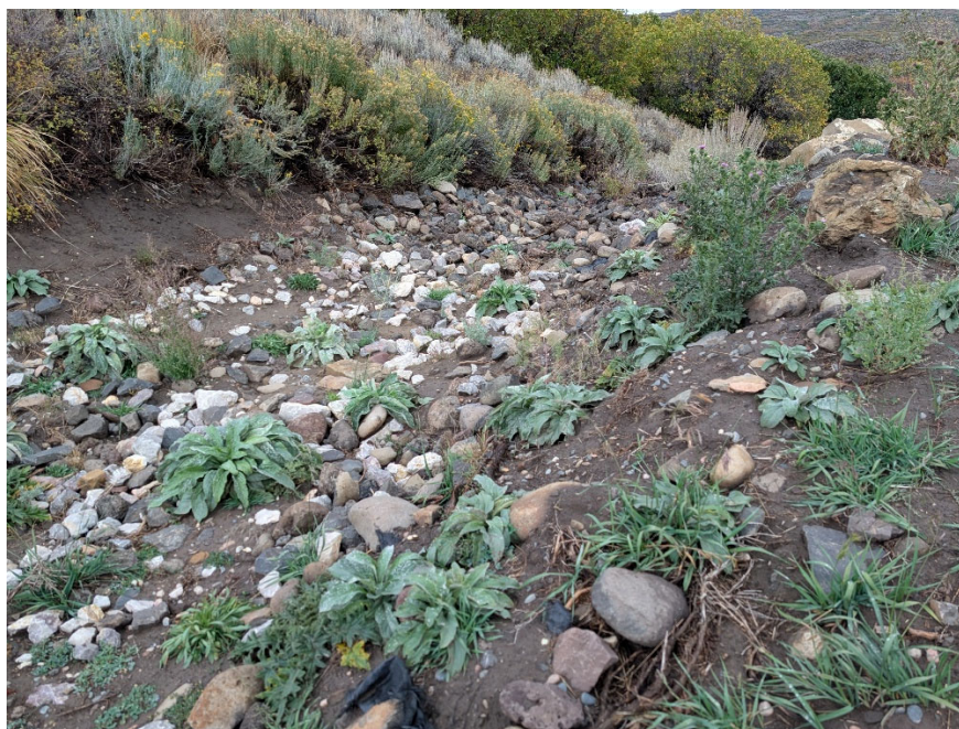
Photo 10: Houndstongue and thistle weeds noted in the spillway of Pond 11.

Number of Partial Inspection this Fiscal Year: 2