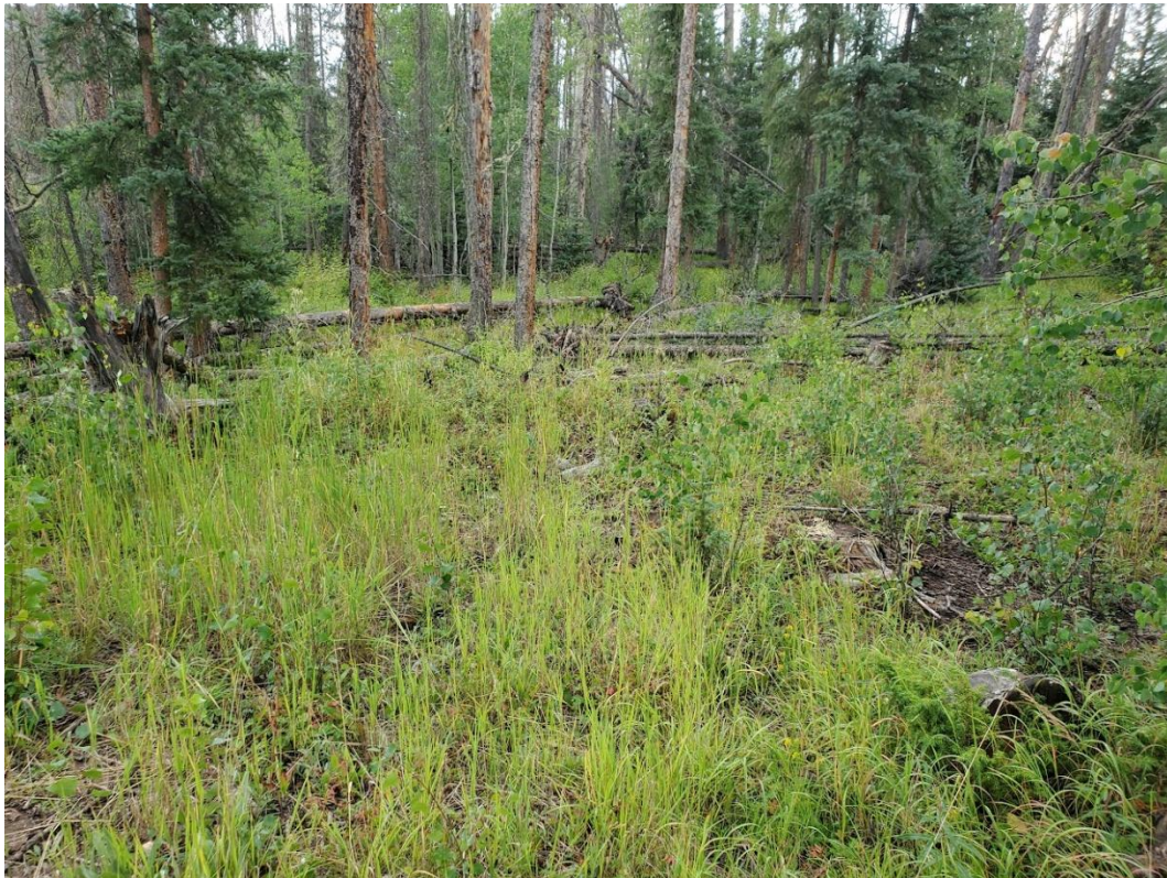
Photo 1: View to the south of undeveloped AC-1 pad location in Rat Creek drainage.