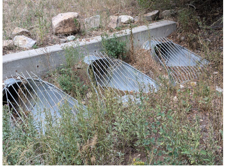
Little Deadwood Gulch culvert system

Conditions at the May Day 1 Area are mostly unchanged from previous inspections. Evidence of any recent mining activity was not observed in this area. The portal is secured with a locked gate. Wire mesh and rock bolts used to stabilize the highwall above the portal appear to be functioning effectively. The milling equipment that was removed from the collapsed mill portal is still located on the May Day 1 pad, along with several shipping containers. No stability or erosion concerns were noted here. Noxious weed infestations were not observed in this area. No problems or violations were noted in this area.