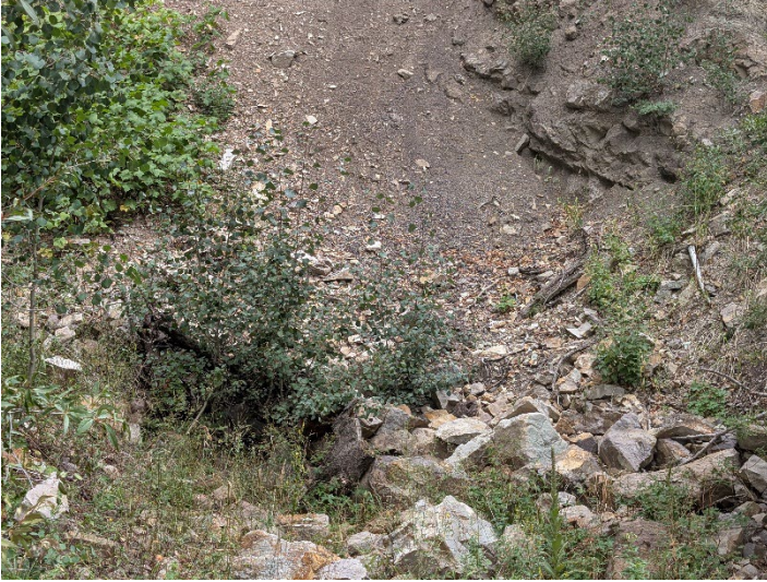
May Day 2 collapsed portal

Conditions at the May Day 2 area are unchanged from previous inspections. The culvert system located in Little Deadwood Gulch appears to be functioning as designed. The portal remains collapsed. No erosion or stability concerns were noted. Noxious weed infestations were not observed. No problems or violations were noted in this area.