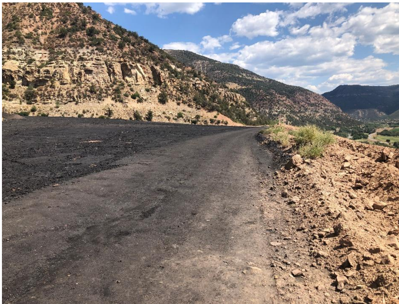
Upper portion of Gob Pile #2

Number of Partial Inspection this Fiscal Year: 1