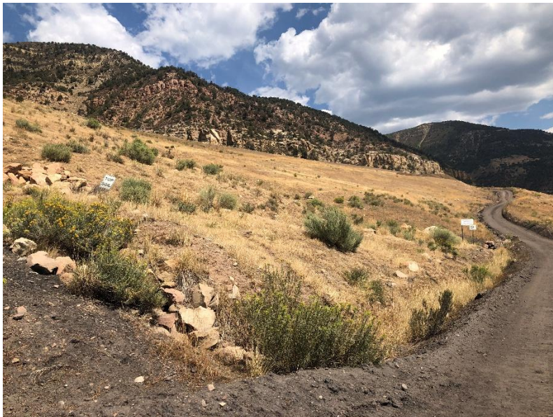
Topsoil Stockpile, with Gob Pile #2 in background

Number of Partial Inspection this Fiscal Year: 1