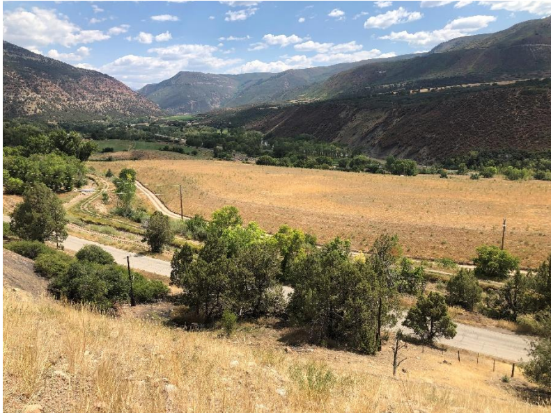
Gob Pile #3