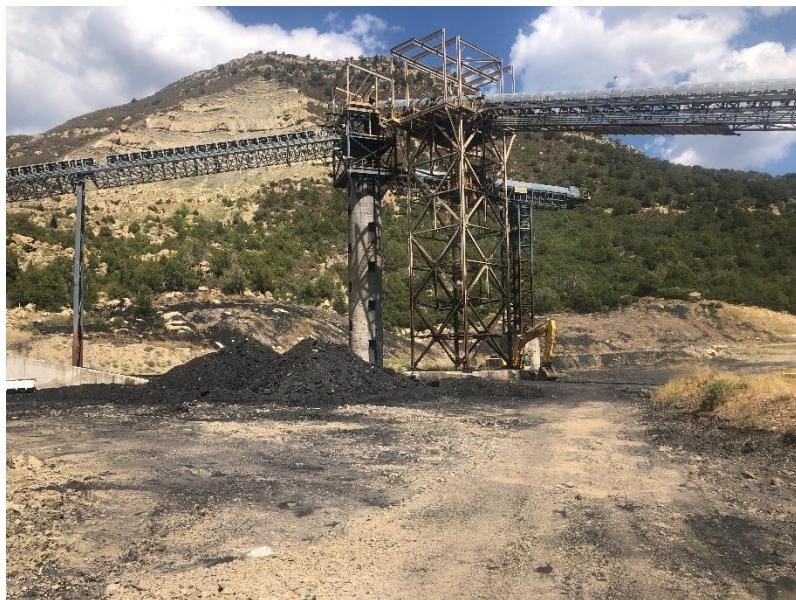
Piles of waste material on D Portal Bench