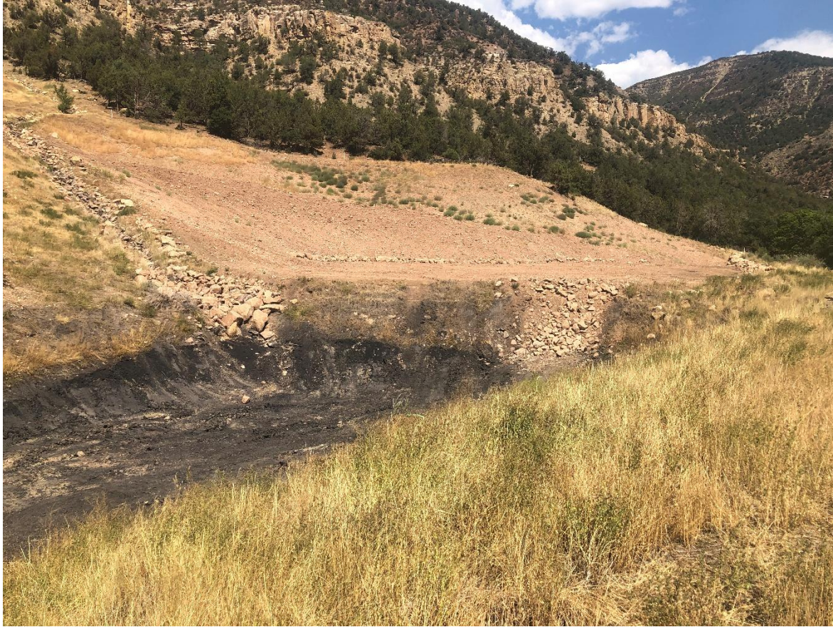
Pond F and former site of soil pile

Number of Partial Inspection this Fiscal Year: 1