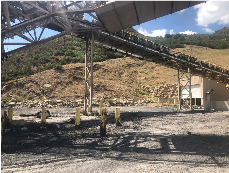
B Portal Bench