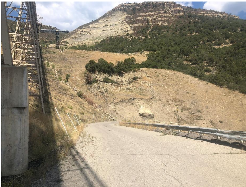
Slide at Curve 10

Number of Partial Inspection this Fiscal Year: 1