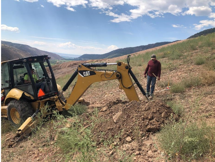
BRL staff checking coverfill depths at Gob Pile #2