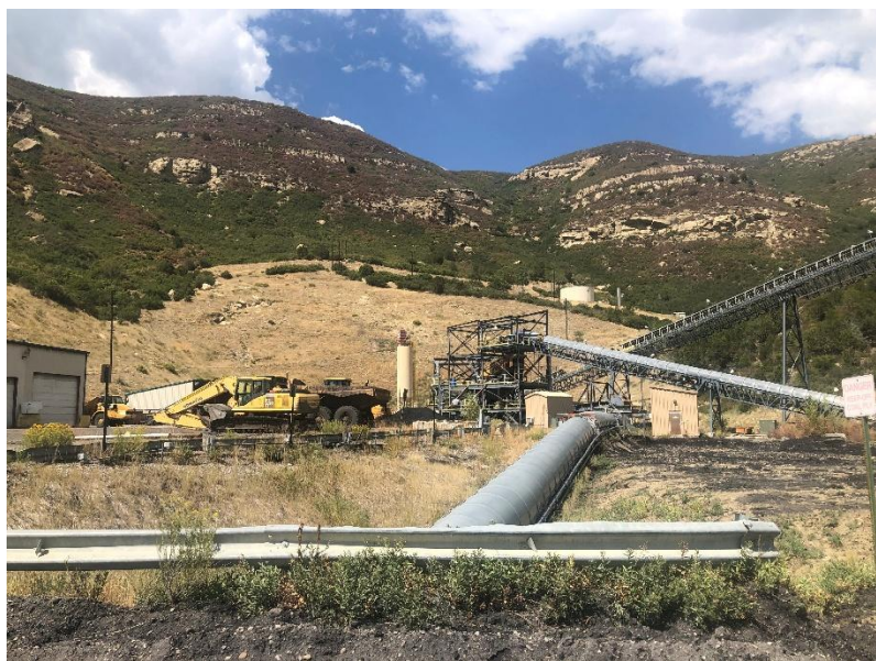
Hillside below the Utility Bench

Number of Partial Inspection this Fiscal Year: 1