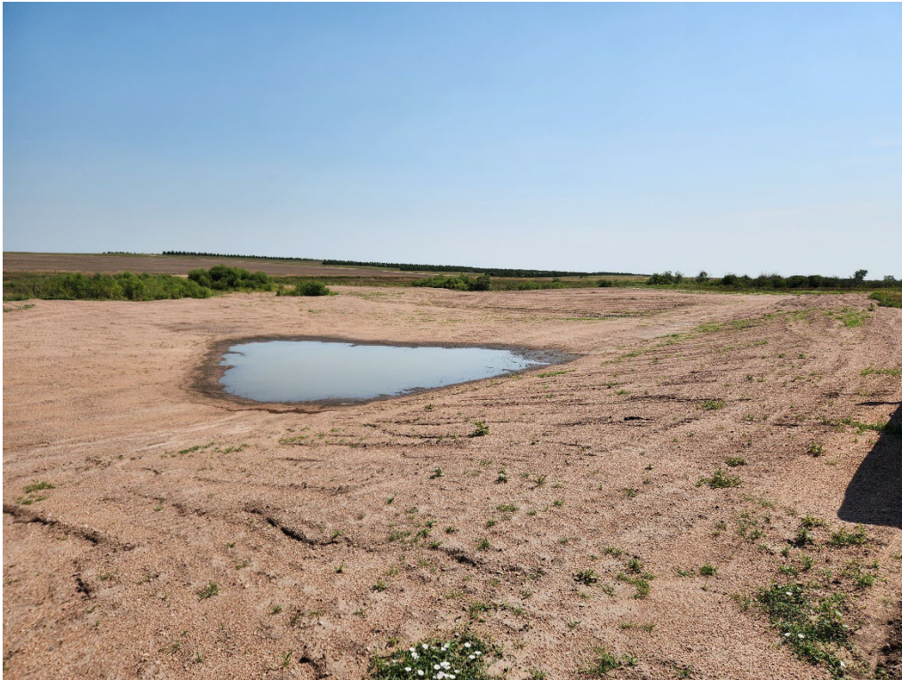
Photo 1. Mined area that has been graded, looking northeast.