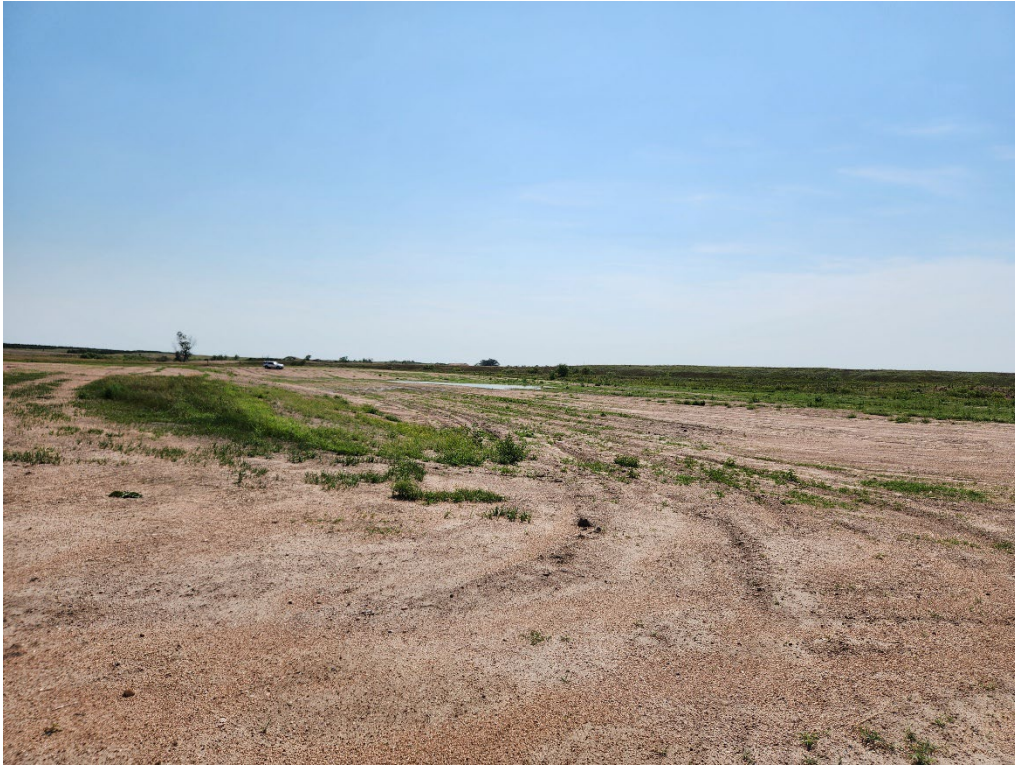
Photo 5. Graded pit floor, looking west.