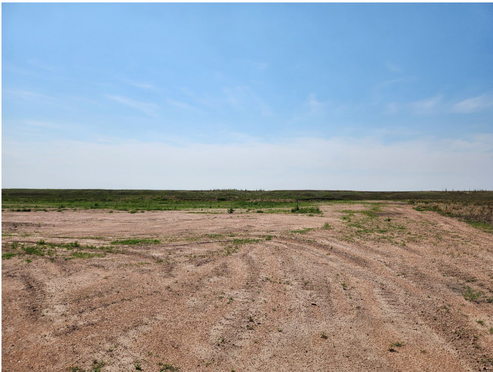
Photo 6. Graded edges of the pit floor, looking south.