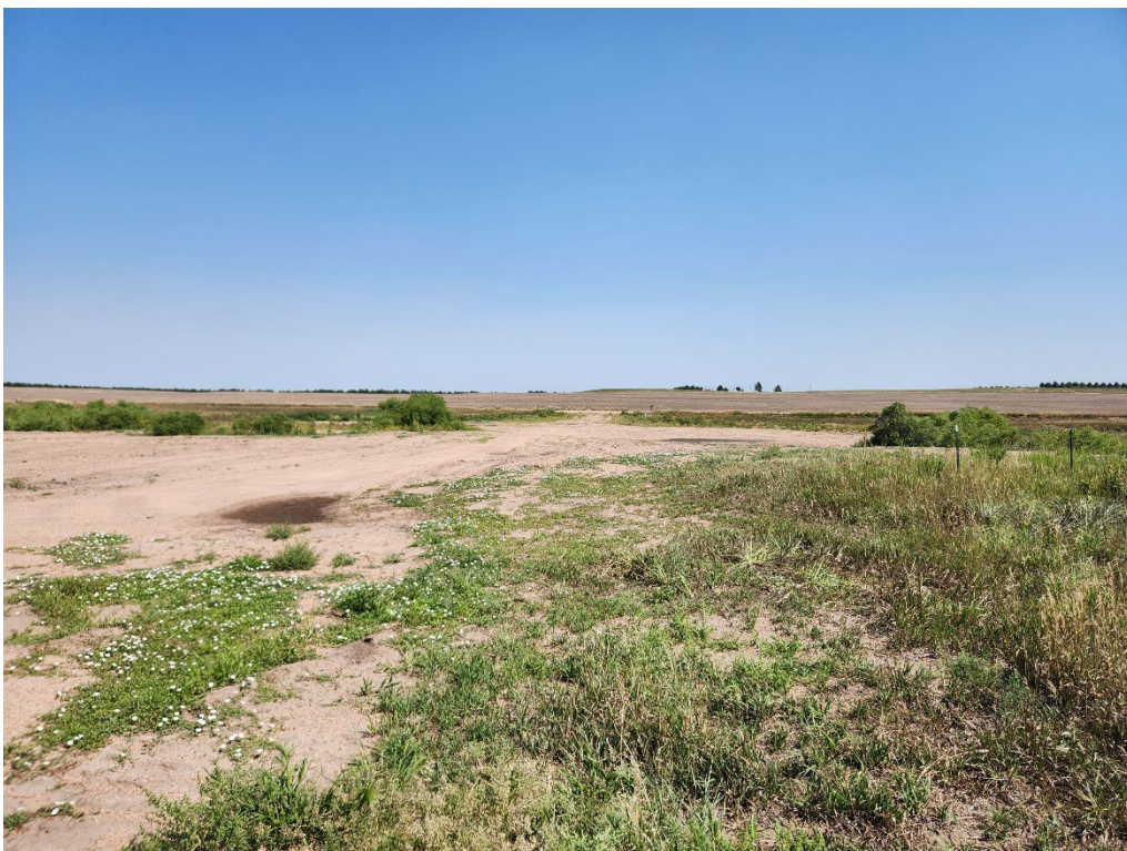
Photo 2. Access to mined area, looking north.