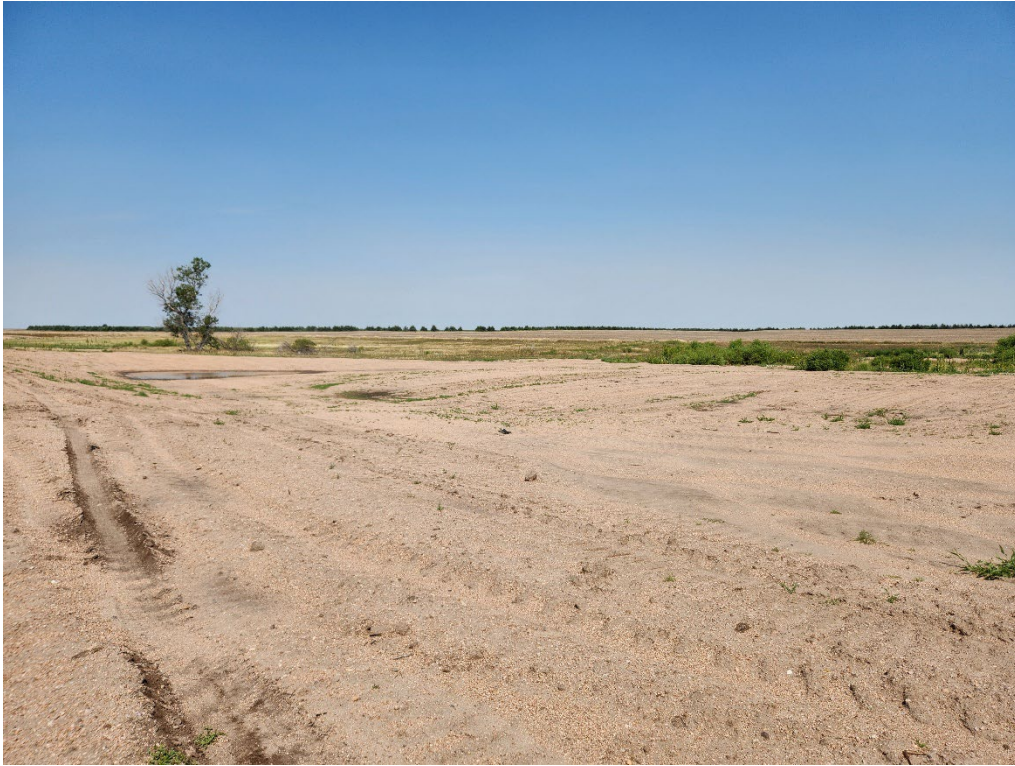
Photo 3. Graded pit floor located in the eastern permit area, looking northeast.