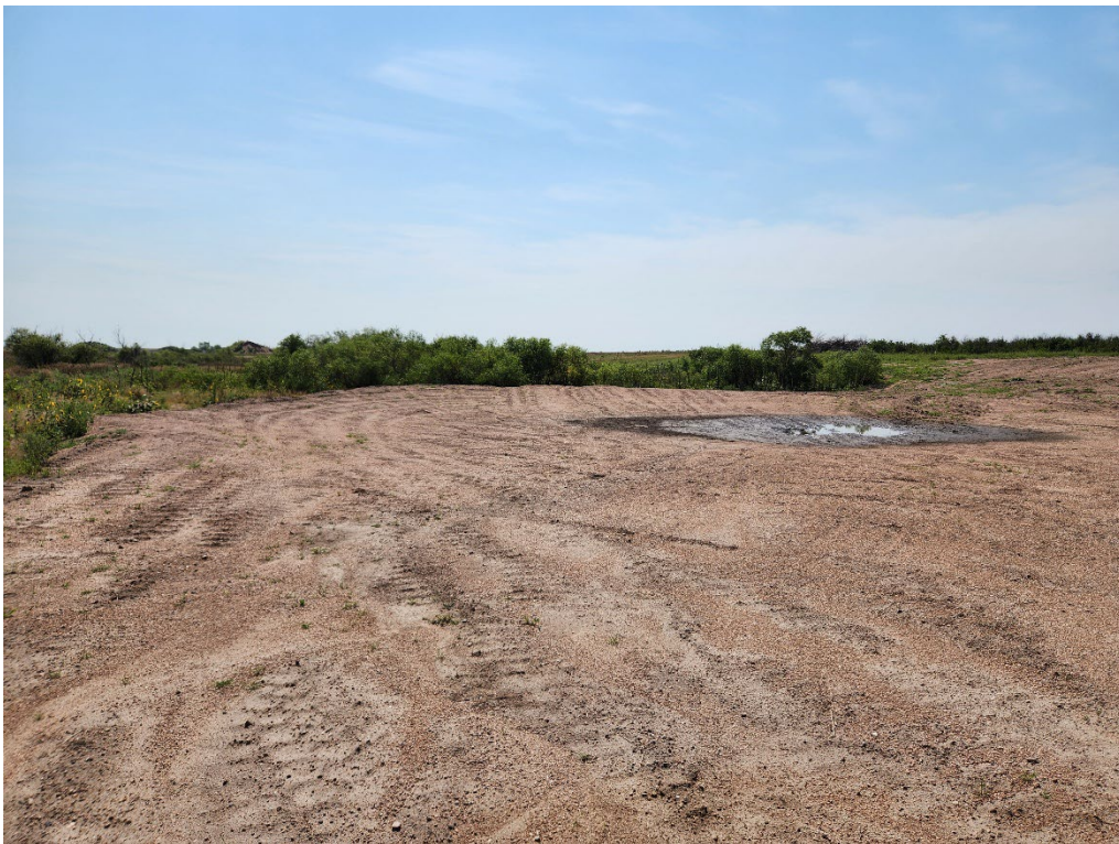
Photo 4. Slopes that have been graded to be steeper than 3H:1V, looking south.