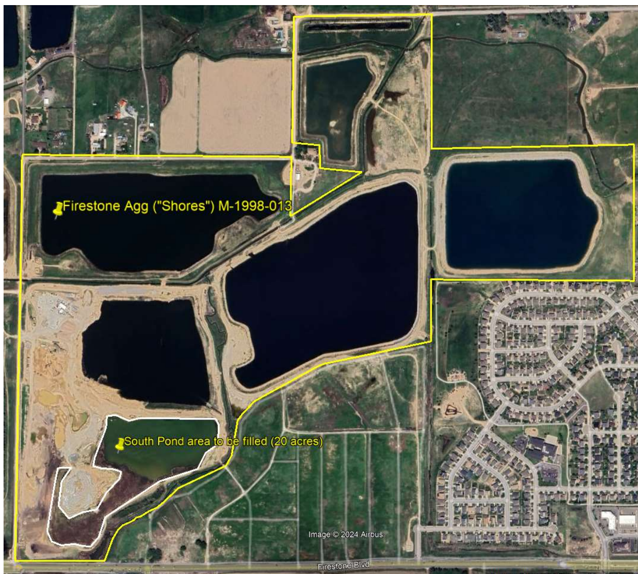
Exhibit 1 – BURNCO Firestone “The Shores” Pit