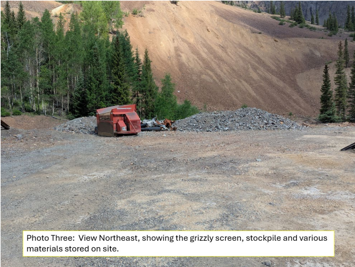
Photo Three: View Northeast, showing the grizzly screen, stockpile and various materials stored on site.