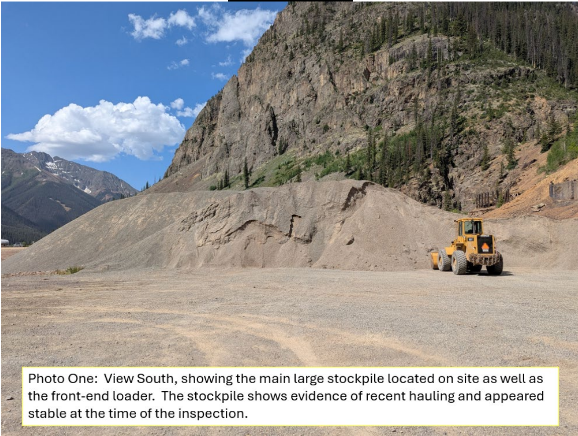
Photo One: View South, showing the main large stockpile located on site as well as the front-end loader. The stockpile shows evidence of recent hauling and appeared stable at the time of the inspection.