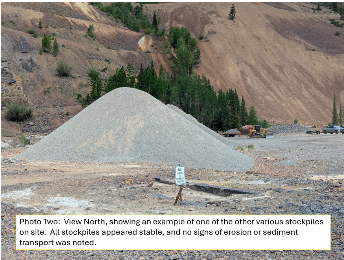
Photo Two: View North, showing an example of one of the other various stockpiles on site. All stockpiles appeared stable, and no signs of erosion or sediment transport was noted.