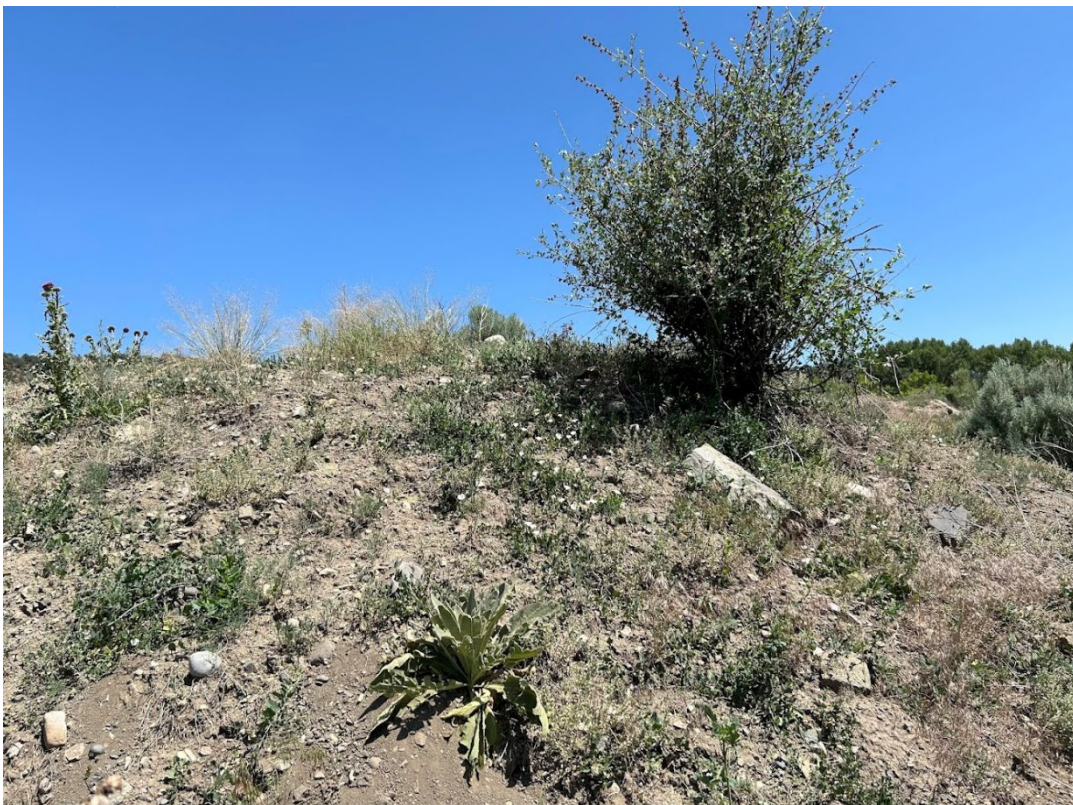
Photo 6: View of noxious weeds, including Common mullein, Oxeye daisy, and Musk thistle on the topsoil stockpile.