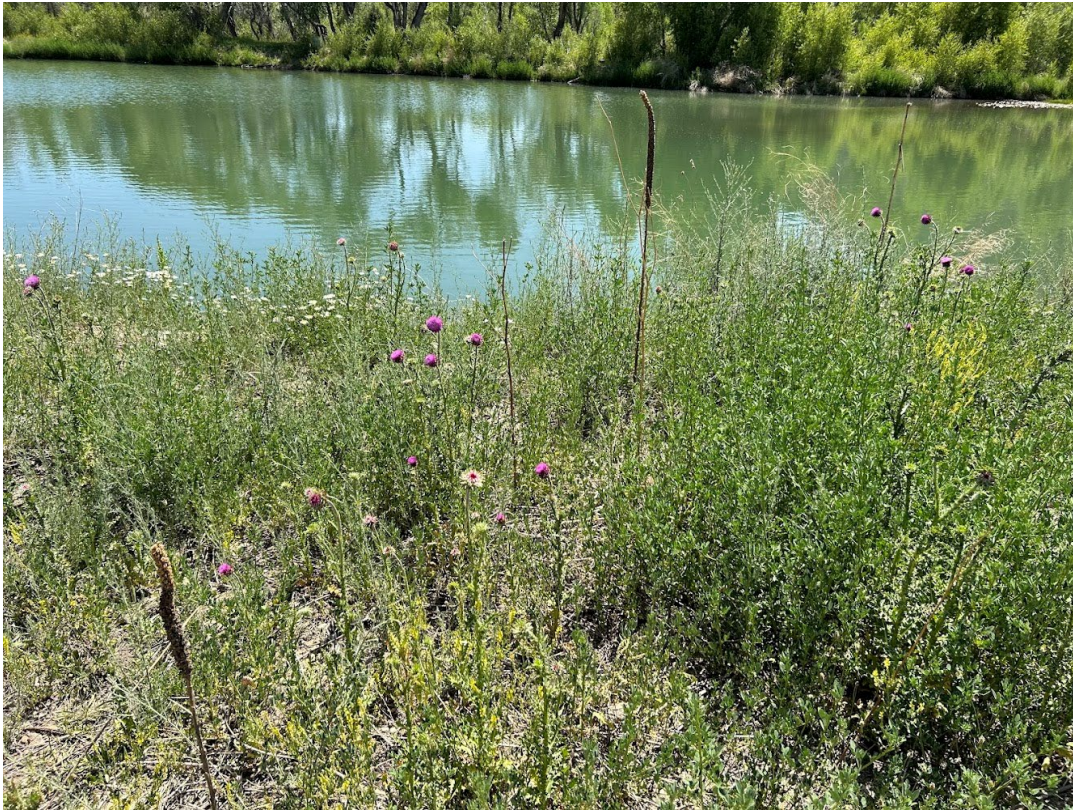
Photo 7: View of noxious weeds along the pond shoreline, facing south.