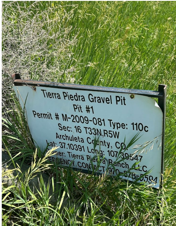
Photo 1: Mine entrance sign along access road to the north of the permit area.