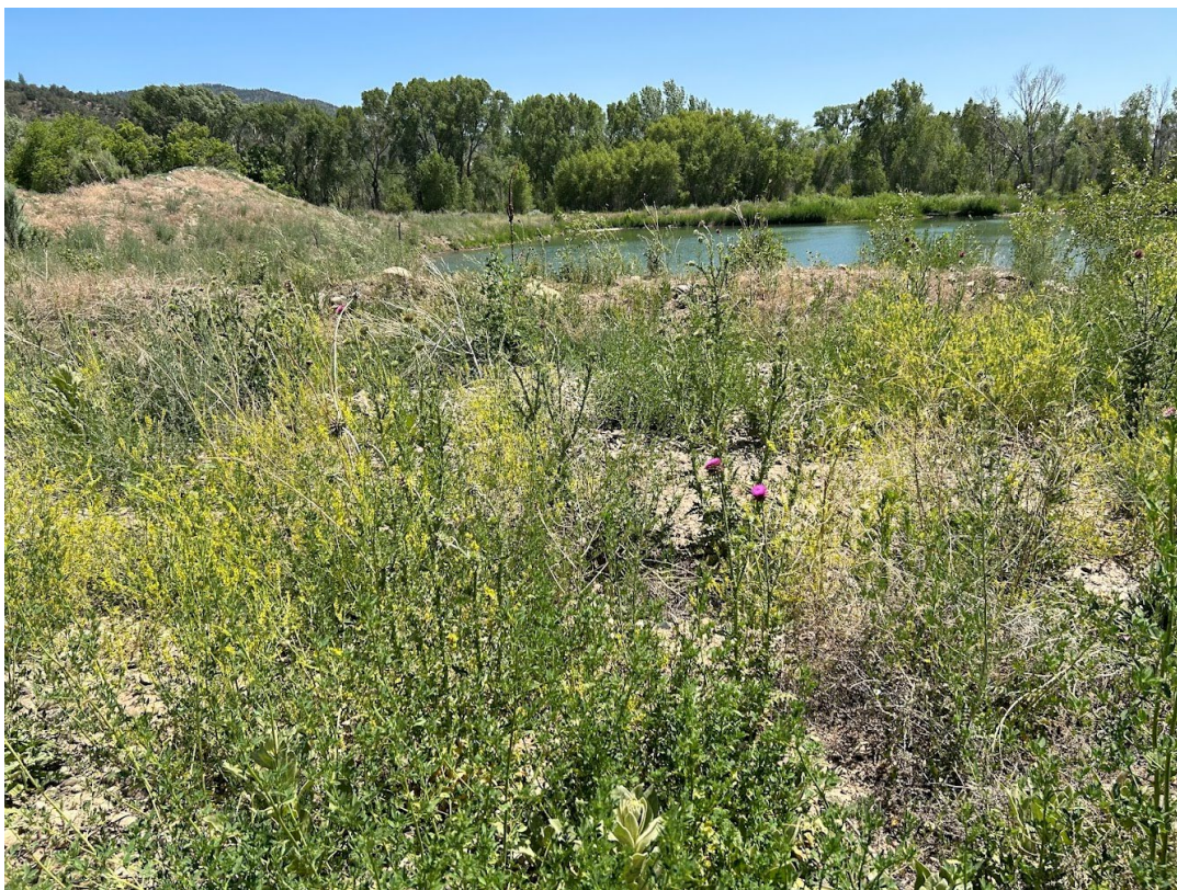
Photo 8: View permit area with noxious weeds north of the pond, facing southeast.