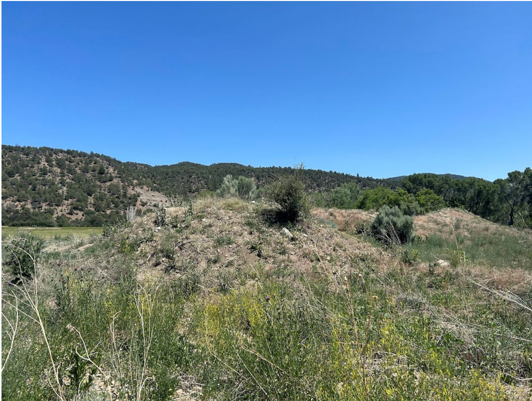
Photo 5: View of vegetated topsoil stockpile along the eastern shoreline of the pond, facing southwest.