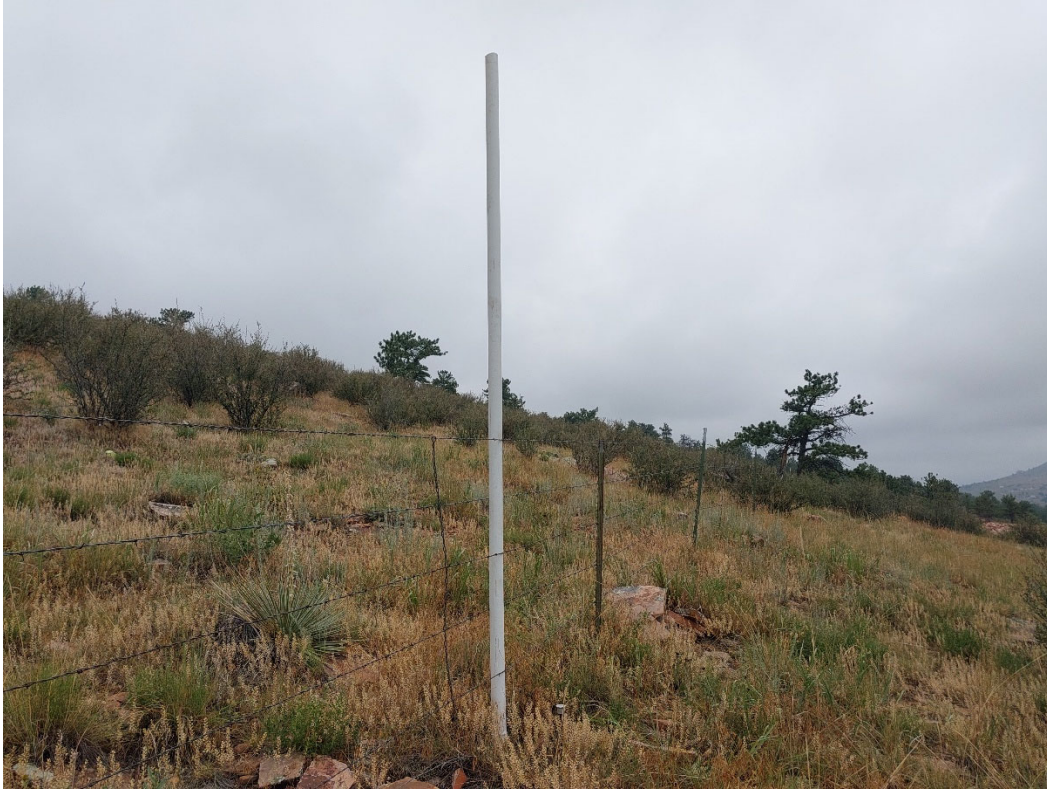
Photo #5: Proposed permit boundary marker at the NW corner, looking to the north.