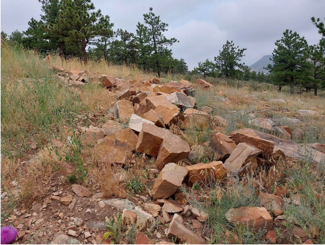
Photo #7: Pre-law disturbance observed in northwestern portion of the permitted area, looking northwest, up slope.

Bryce Bohl, Bret Ludwick, & Jat Panzarella Colorado Quarry I, LLC 901 S CR31 Berthoud, CO 80513