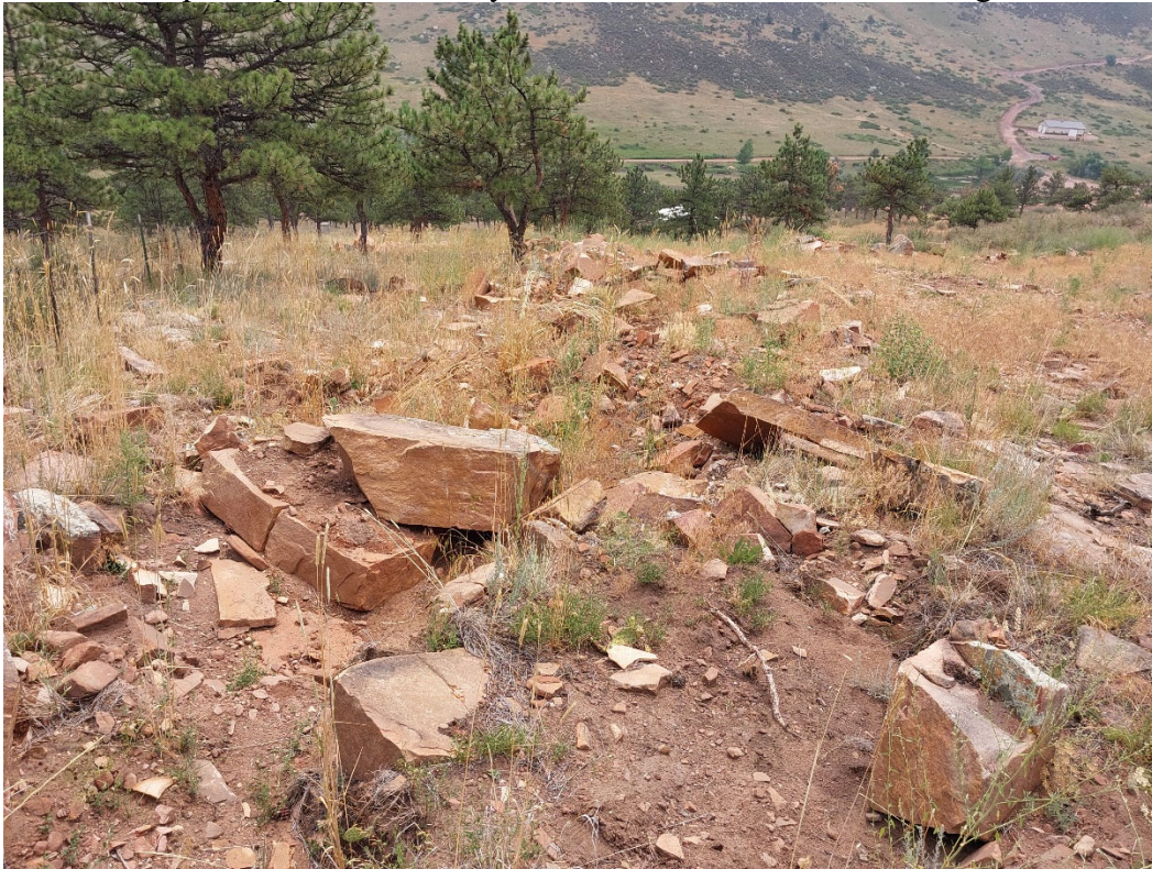
Photo #6: Pre-law disturbance observed in the northwestern portion of the proposed permitted area, looking east, down slope.