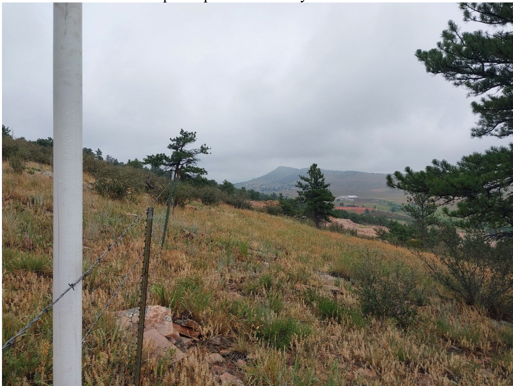
Photo #4: Proposed permit boundary marker at the SW corner, looking to the north.