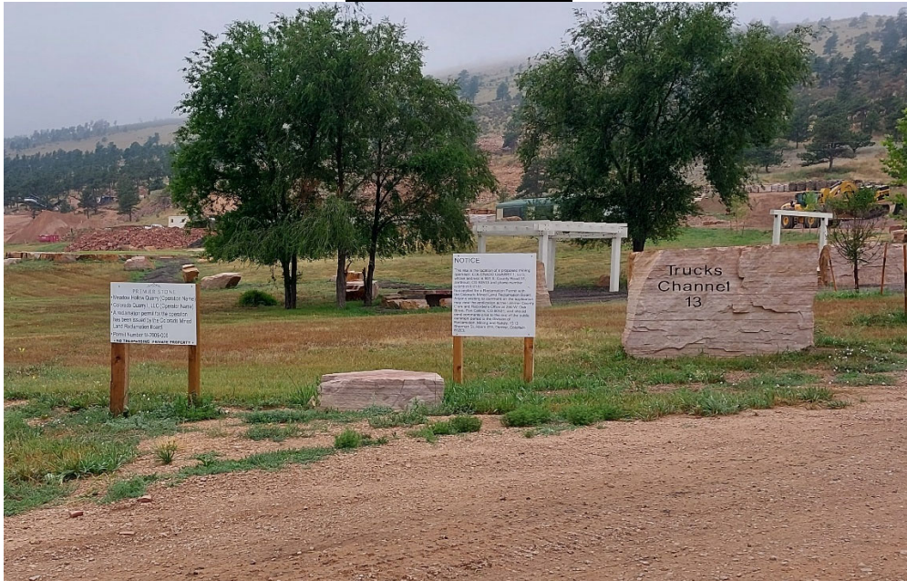
Photo #1: Mine sign and CN notification posted near the entrance of the permitted area.