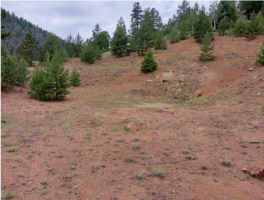
Photo #3: View of the southern portion of the permit area, looking south.