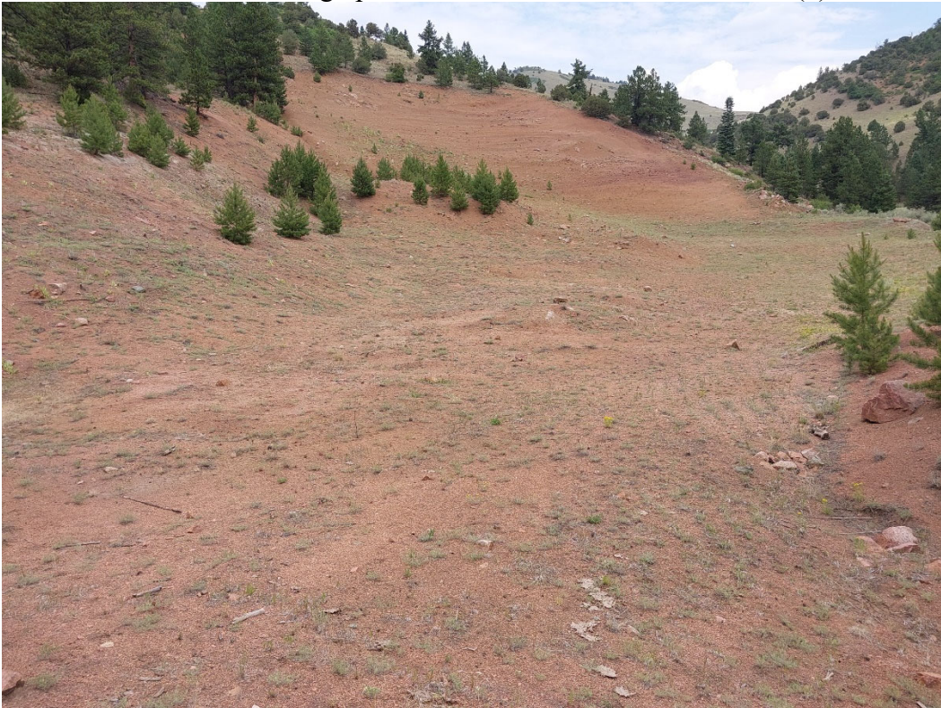
Photo #2: From the southern portion of the old pit, looking north. The pit floor can be seen with the contoured old high wall in the background.