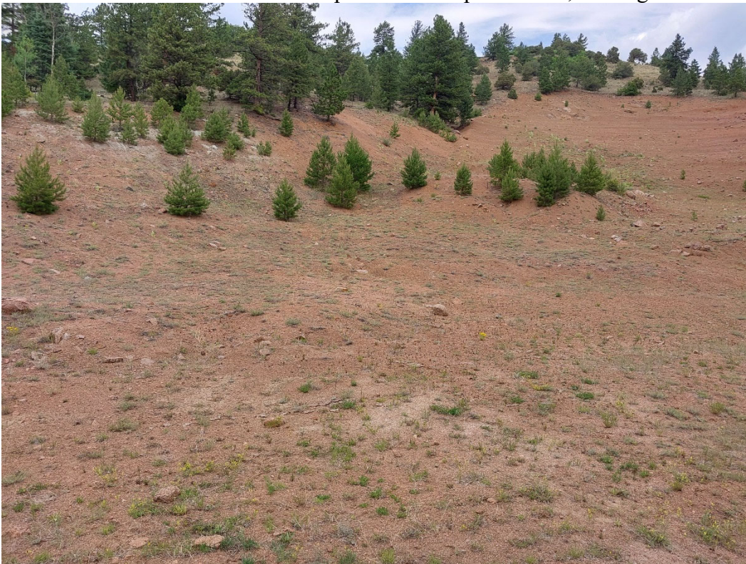
Photo #4: View of the contoured high wall, saplings can be seen with some common mullein in the background.