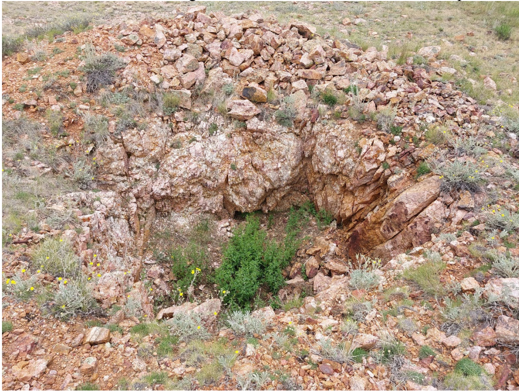
Photo #8: Per-law mining pit located between the southern boundary of the pit and the southern permit boundary.