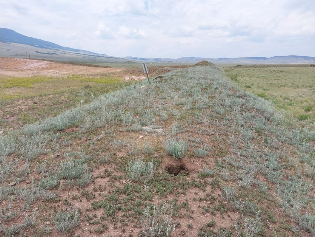
Photo #5: View along the top of the overburden and topsoil berm along the northern boundary of the pit, looking west.