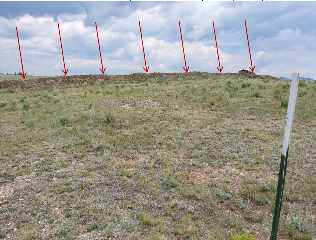
Photo #4: Permit boundary marker #5 on map below, looking to the northwest. The overburden and topsoil berm can be seen in the background.