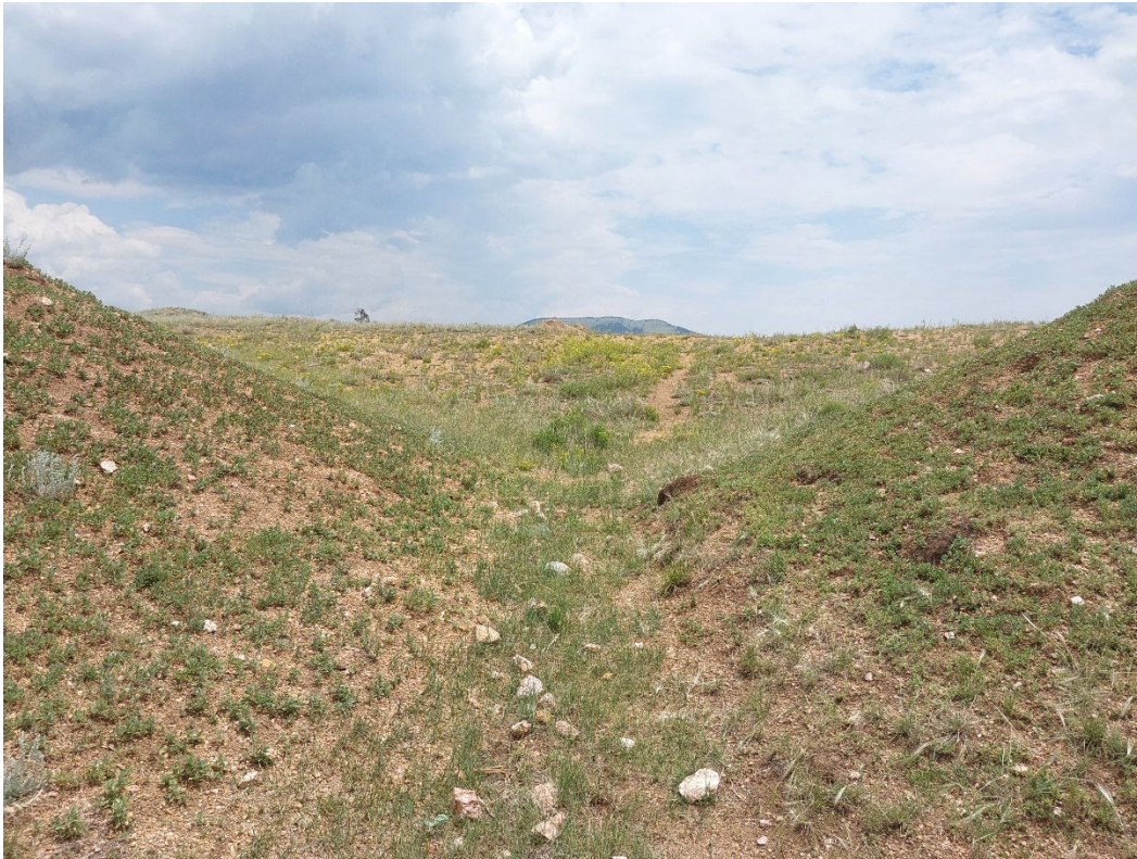
Photo #7: View of the stormwater drainage cut in the berm, on the west side of the pit area, looking east.