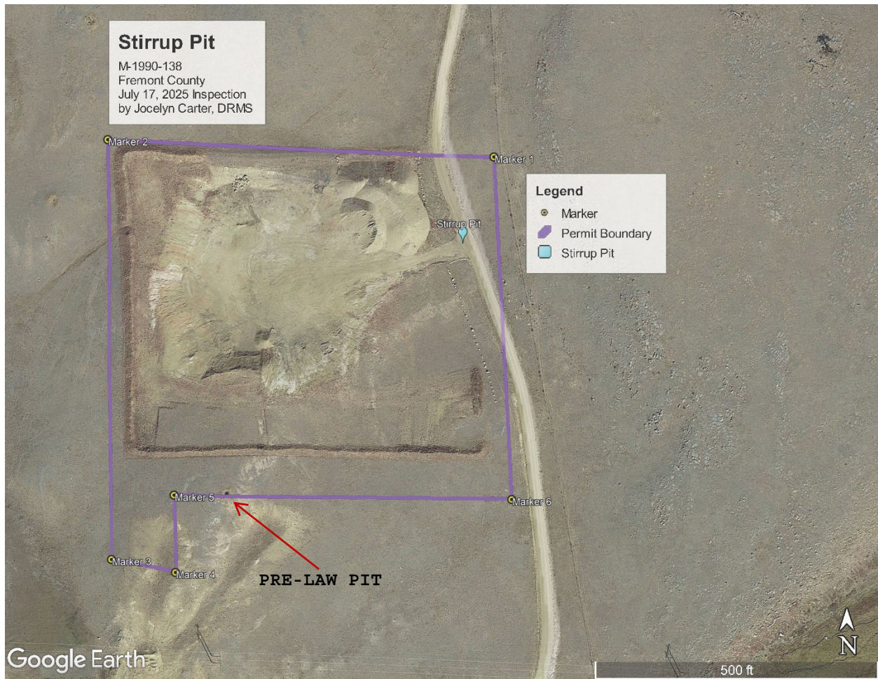
Figure #1: Map created based on inspection observations, the purple permit boundary was created based on the coordinates collected during the inspection for each of the permit boundary markers.

Mr. Scott Hileman Fremont County 1170 Red Canyon Road Cañon City, CO 81212