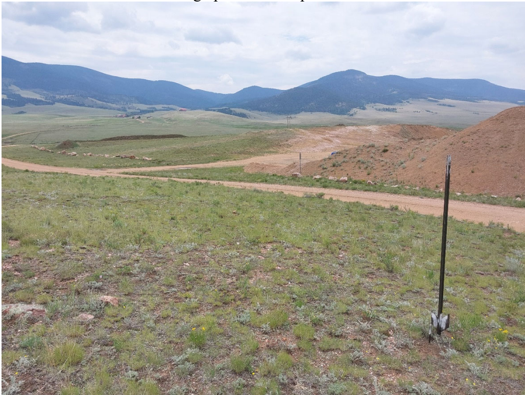
Photo #2: Permit boundary marker #1 on map below, looking southwest. The section of CR 2a within the permitted area can be seen.