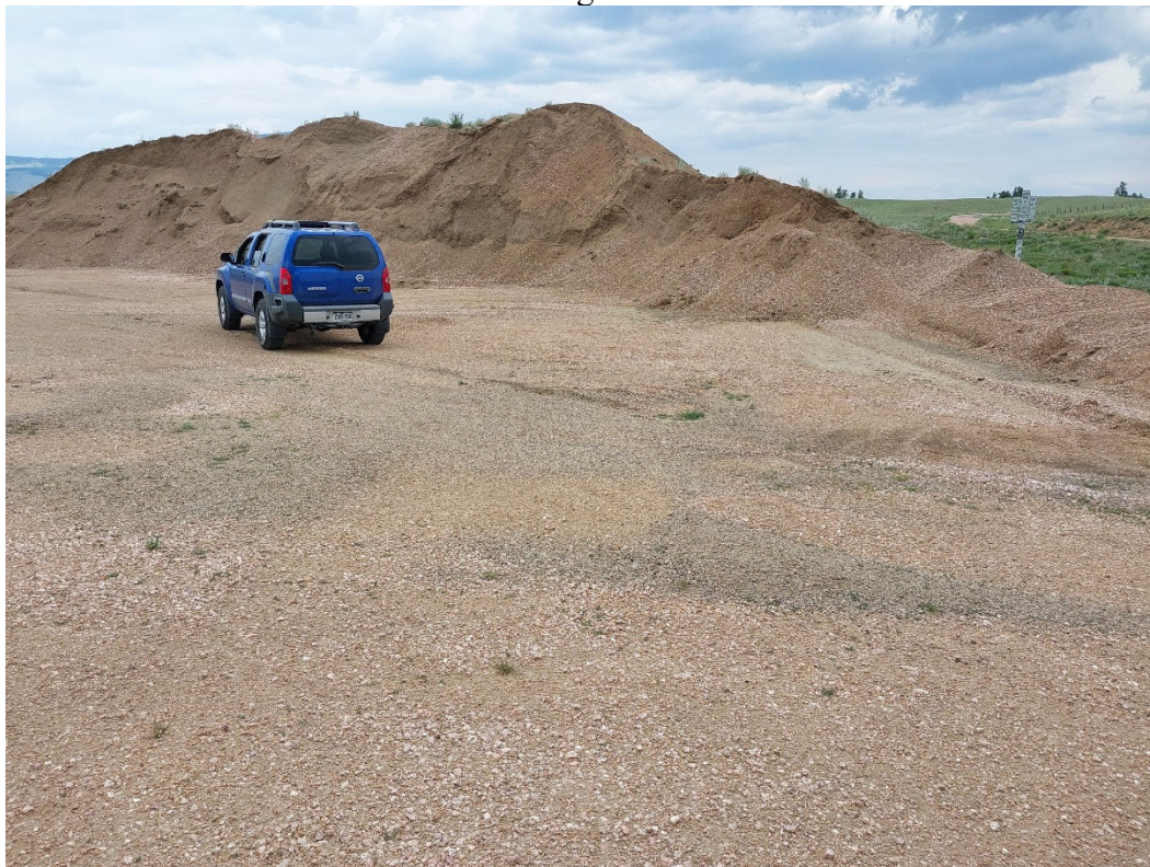
Photo #6: Stockpile of product material located on the north side of the pit near the entrance.