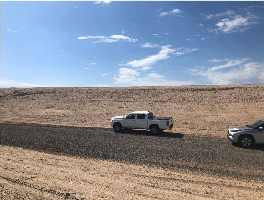
Large overburden pile along road