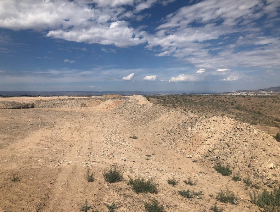
Berm on north side of affected area