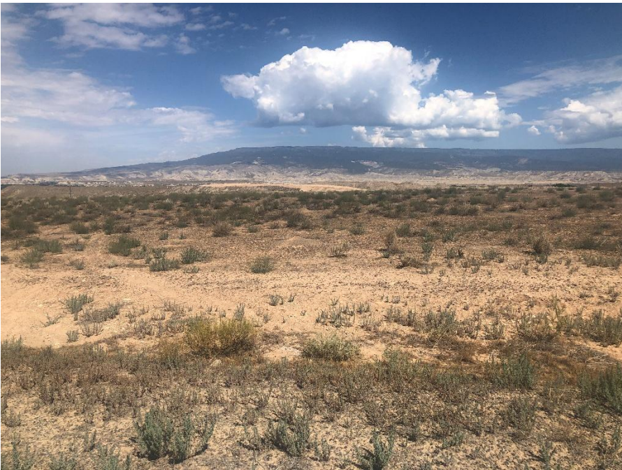
No mining activity at southwest portion of site