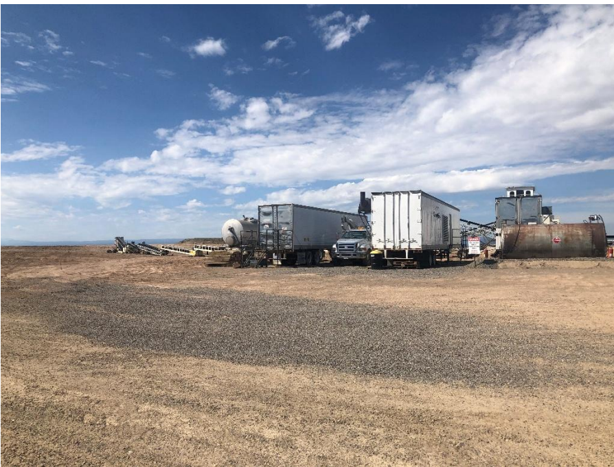
Processing site, with equipment, trailers, and diesel tank