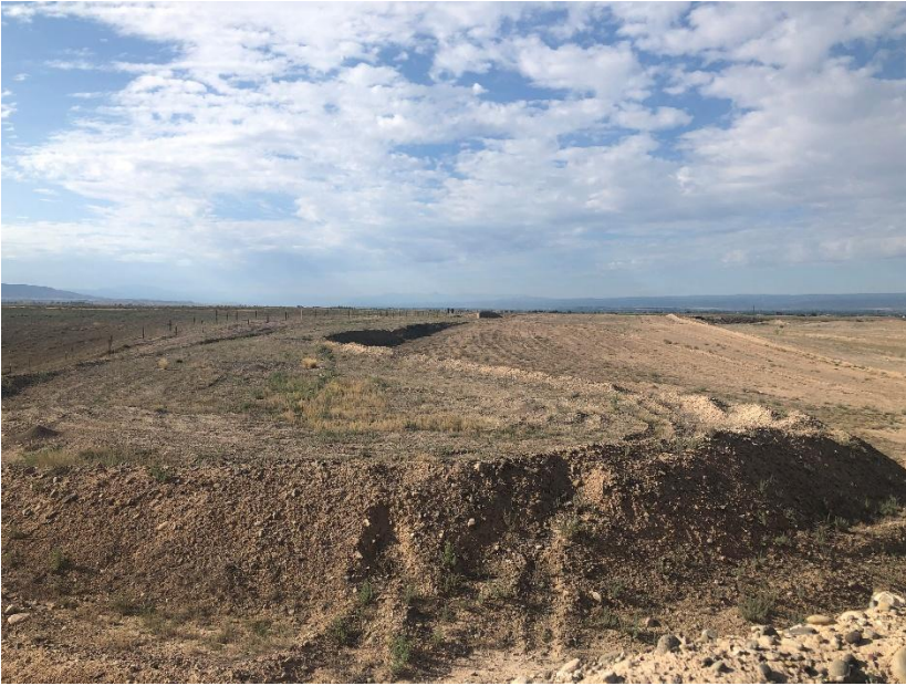
East end of site, looking south – affected area markers missing