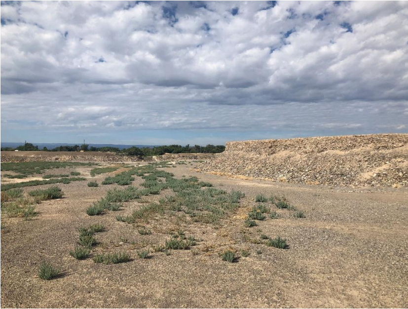
Mining area with halogeton