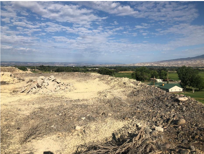
Berm at northeast corner of site