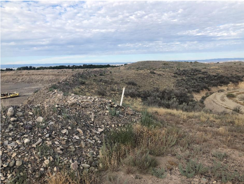
Affected area boundary, looking southwest from northwest corner of site