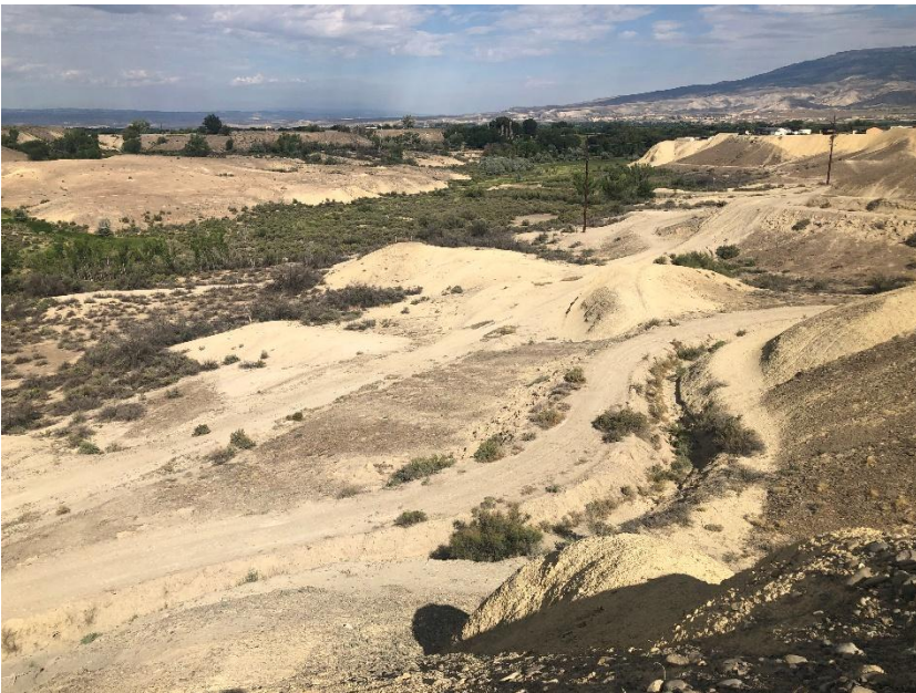
Southwest part of site – disturbance does not appear to be mining related