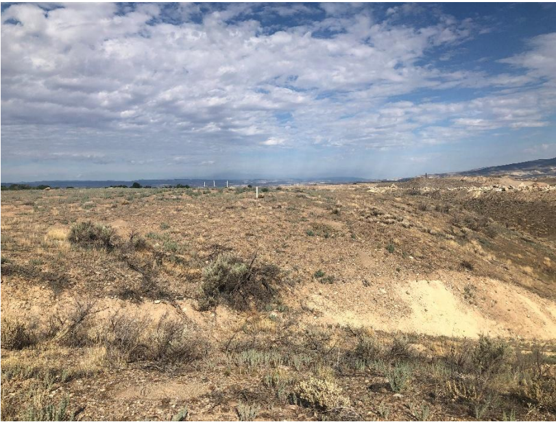
South end of site, looking west – affected area markers visible