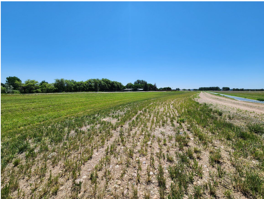
Photo 4. Reseeded area east of the Boxelder Ditch, looking south.