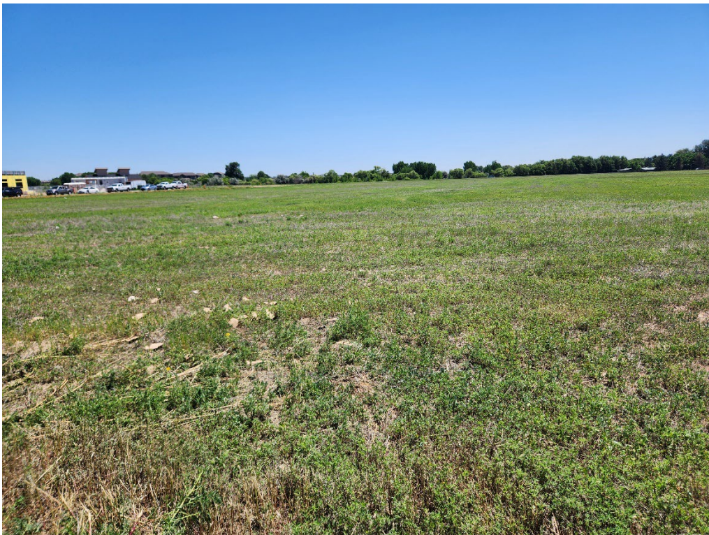
Photo 6. Revegetated field in the northern portion of the release block, looking east.