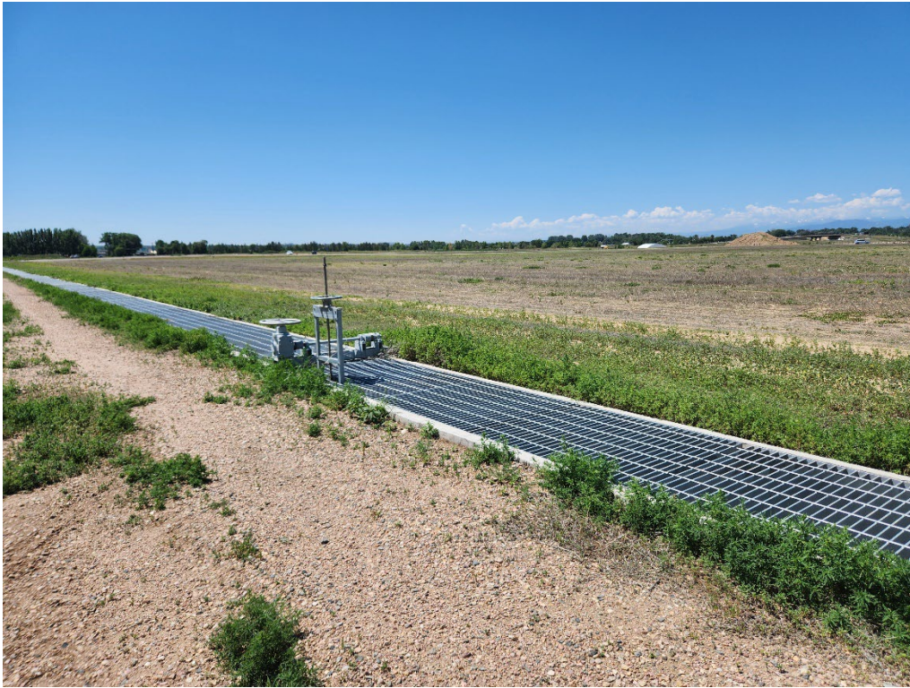
Photo 3. New Boxelder Ditch diversion along the eastern edge of the release block, looking west.