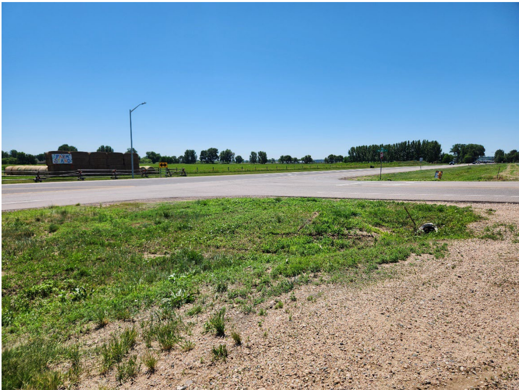
Photo 2. Southeast corner of the release block, looking southeast.