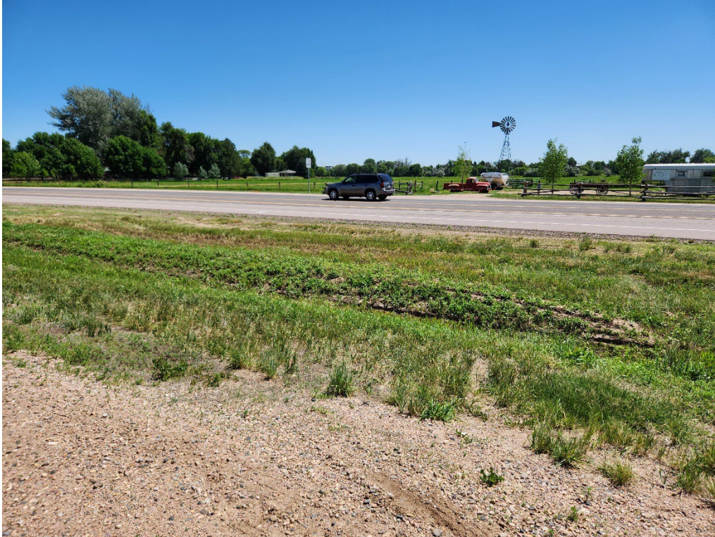
Photo 1. Southeast edge of the release block along S Co Rd 5, looking east.