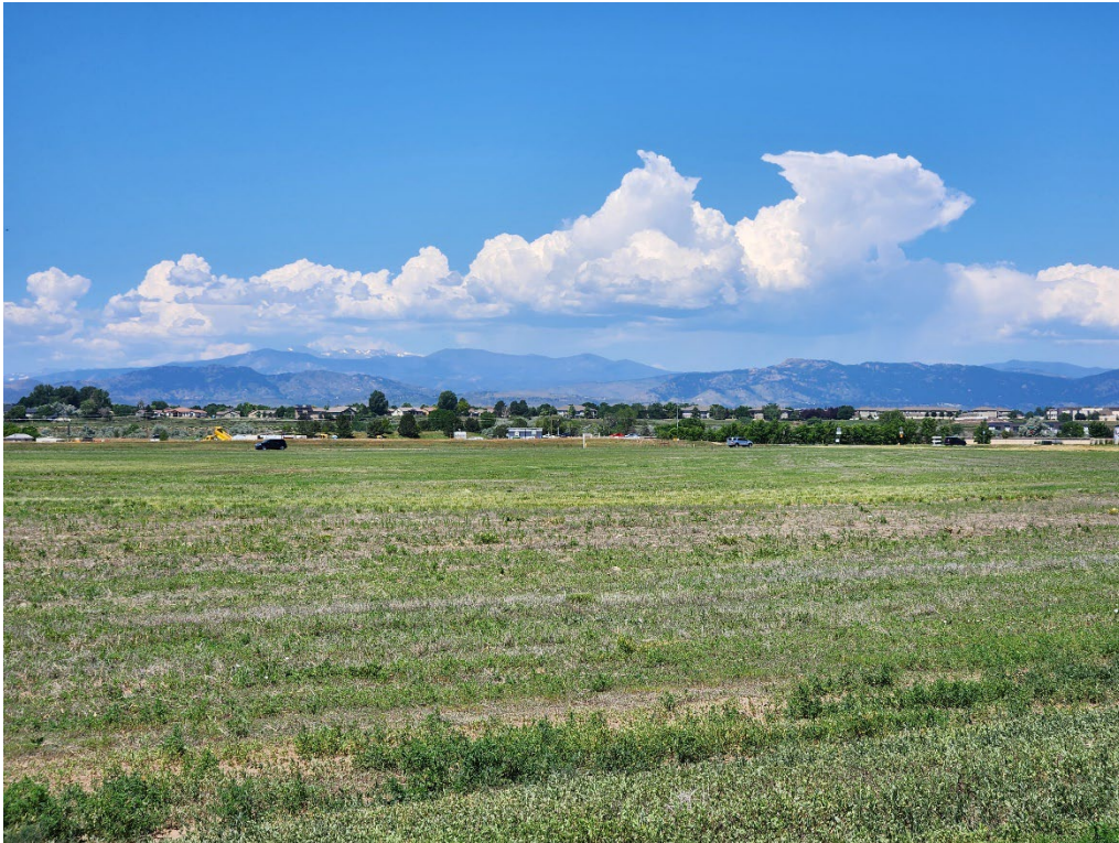
Photo 5. Revegetated field in the release block, looking west.