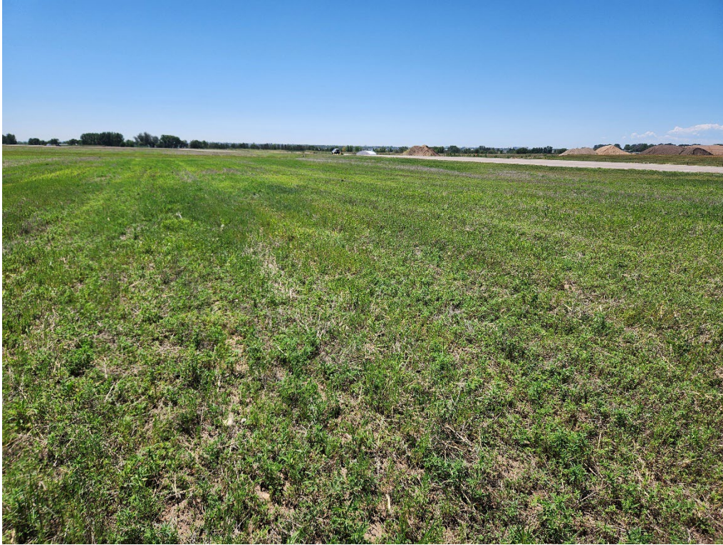
Photo 7. Revegetated field in the western portion of the release block, looking south.