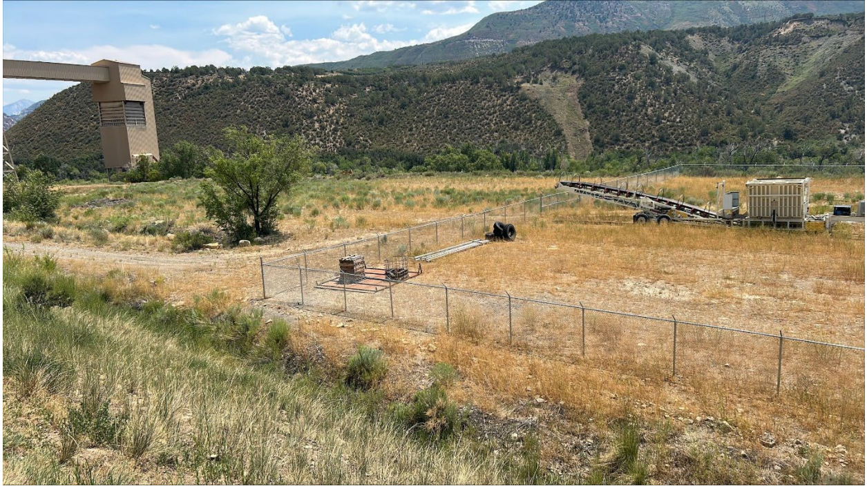
Figure 7: Eastern end of lower pad

Number of Partial Inspection this Fiscal Year: 1