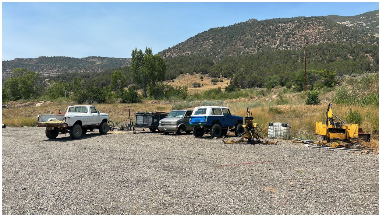
Figure 3: More equipment on upper pad