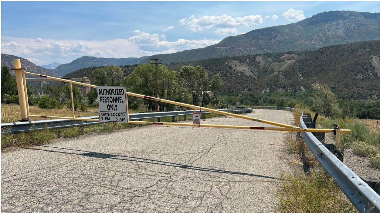
Figure 1: Site access secure