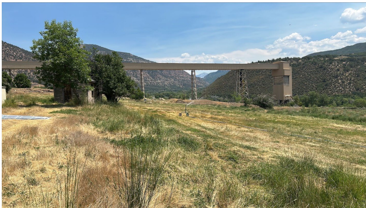
Figure 4: Irrigation on slope below upper pad

Number of Partial Inspection this Fiscal Year: 1