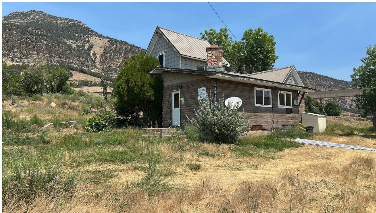
Figure 5: Office building, with cut hay in foreground