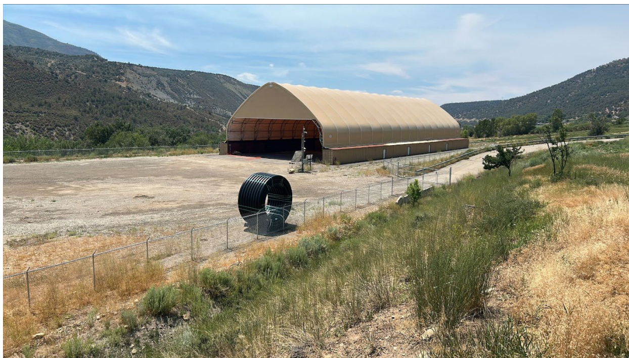
Figure 6: Temporary building on lower pad

Number of Partial Inspection this Fiscal Year: 1