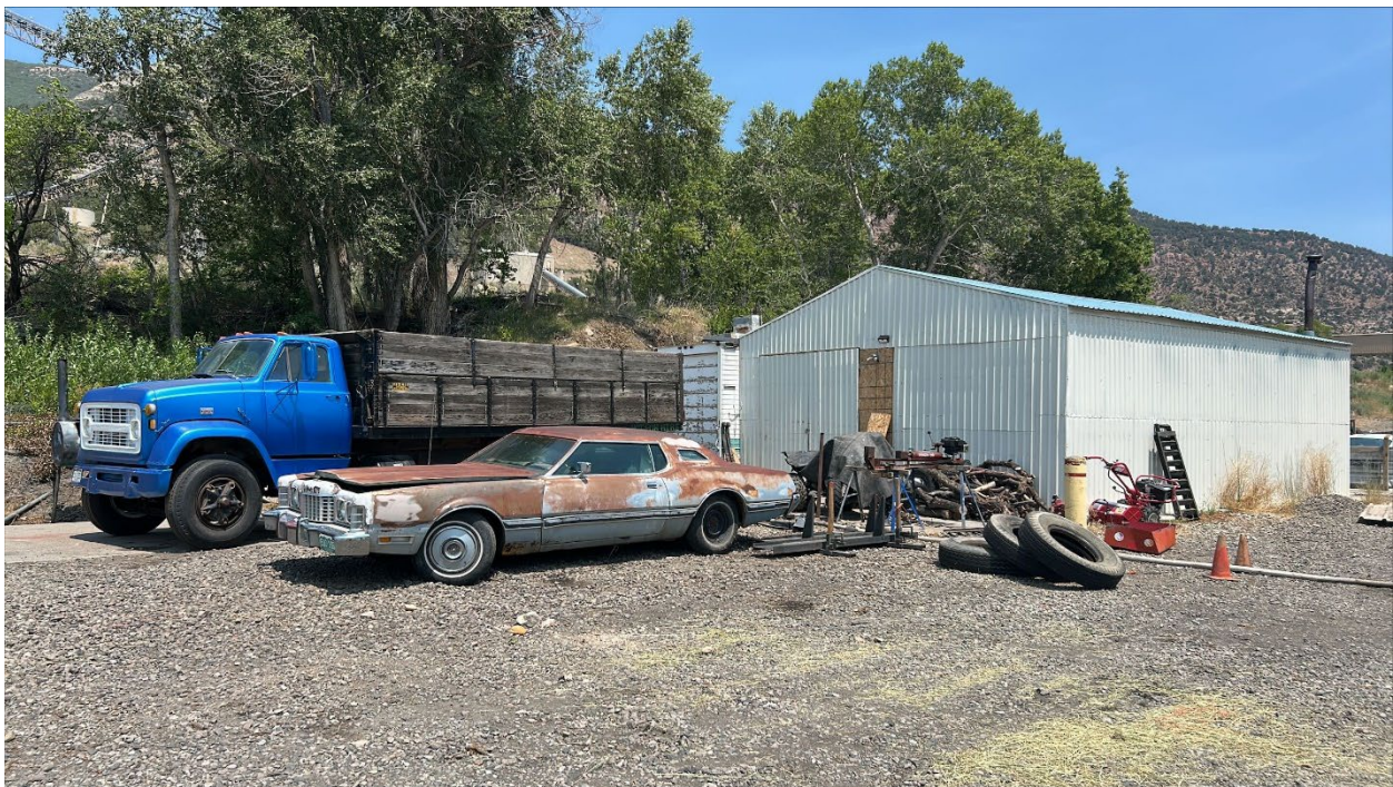
Figure 2: Equipment on upper pad

Number of Partial Inspection this Fiscal Year: 1