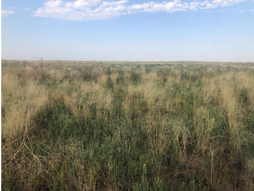
Middle of Area 37, with good vegetation cover