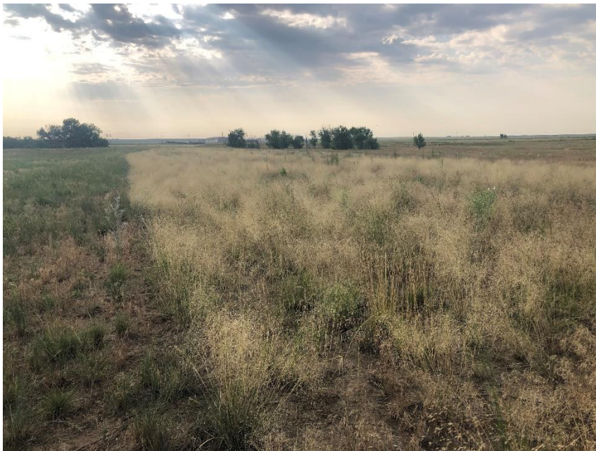
Indian ricegrass at reclaimed road south of Area 25

Number of Partial Inspection this Fiscal Year: 1