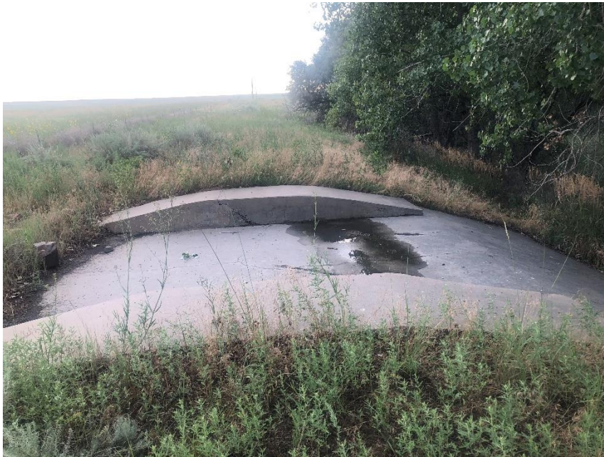
Spillway for Sediment Pond 2