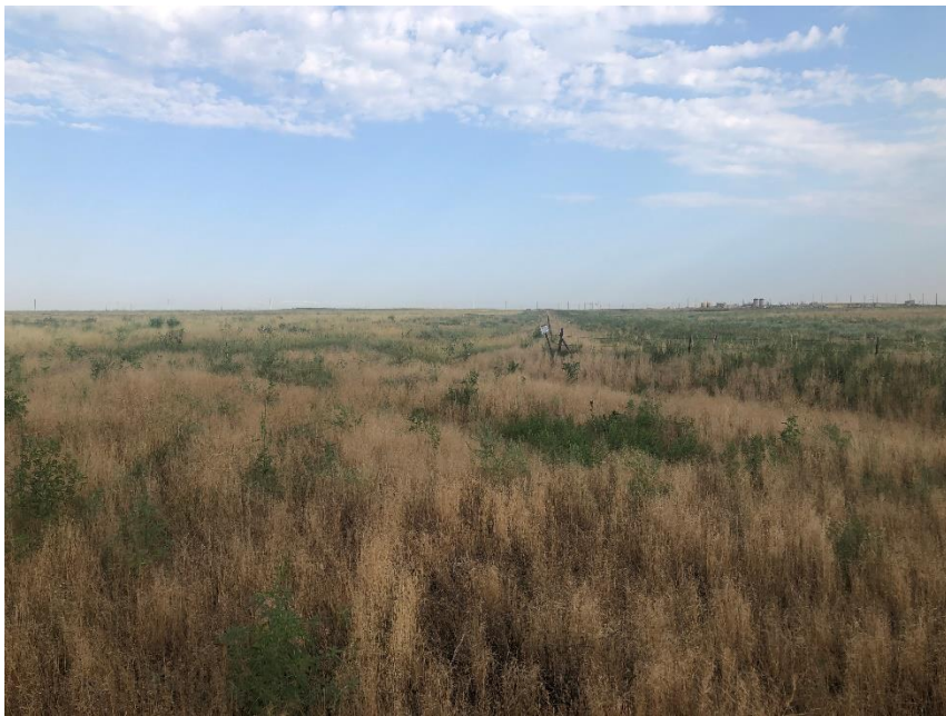
Northern boundary, looking northwest

Number of Partial Inspection this Fiscal Year: 1