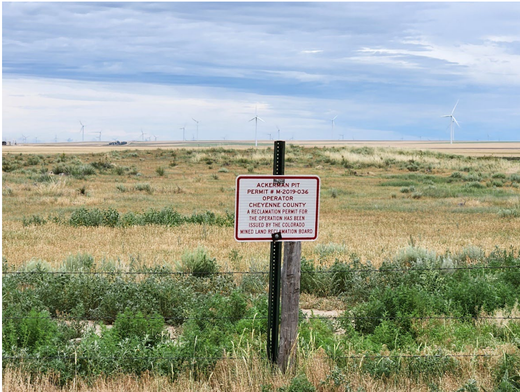
Photo 1. Mine entrance sign, looking north.