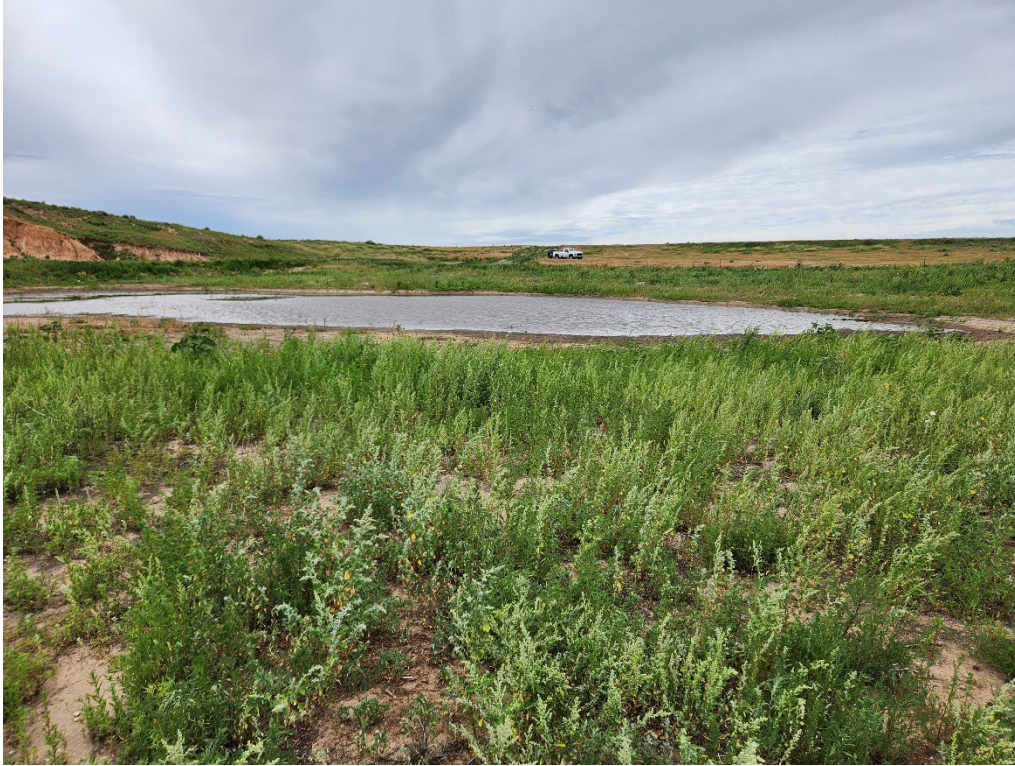
Photo 5. View of the pit in reclamation, looking west.