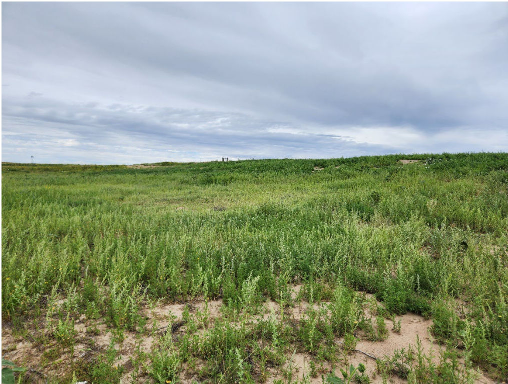
Photo 4. Northern portion of the permit area, looking north.