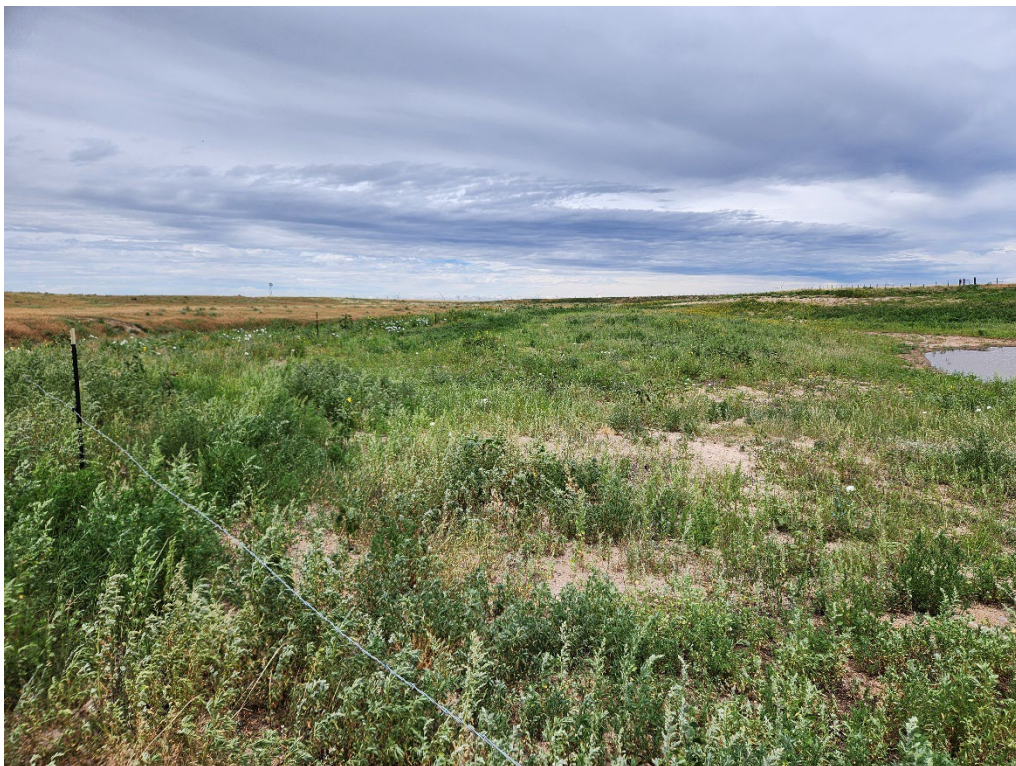
Photo 2. Southwest corner of the permit area, looking northwest.