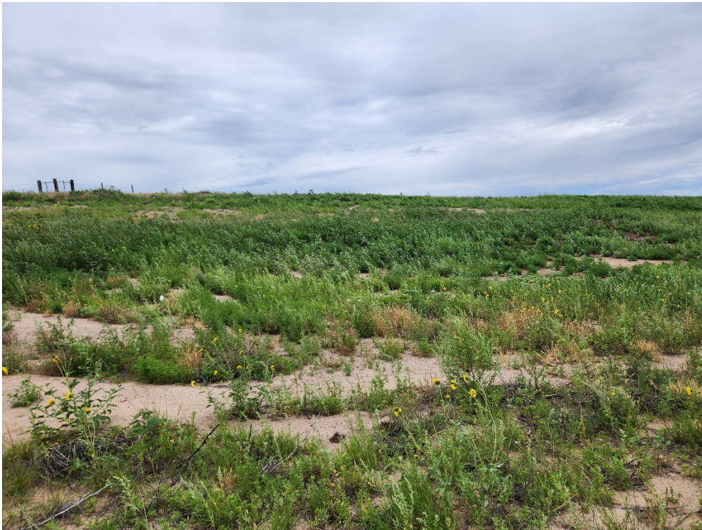
Photo 6. Western edge of the permit area, looking west.