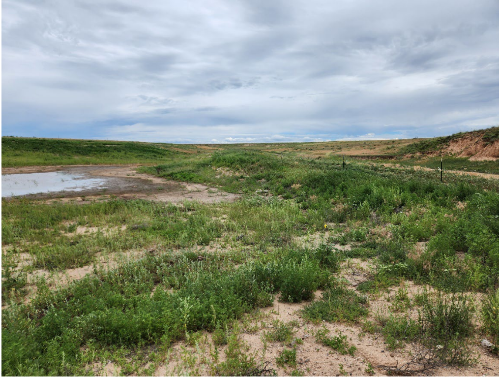
Photo 3. Southern edge of the permit area, looking east.