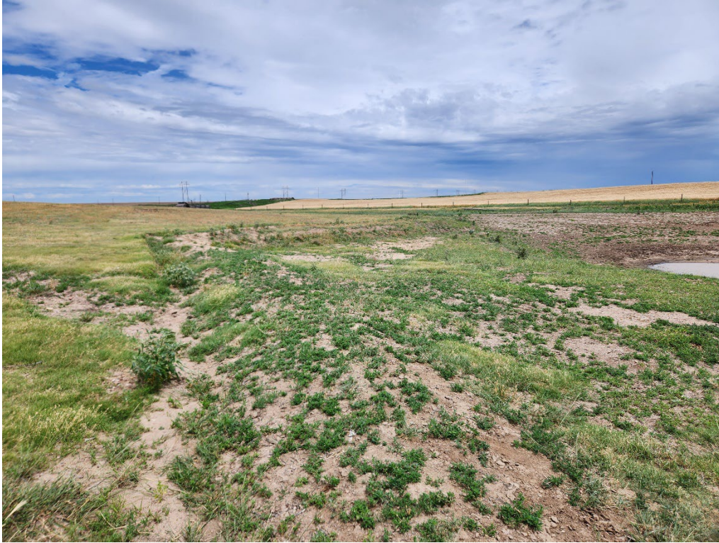
Photo 3. Northwestern edge of the pit, looking north.