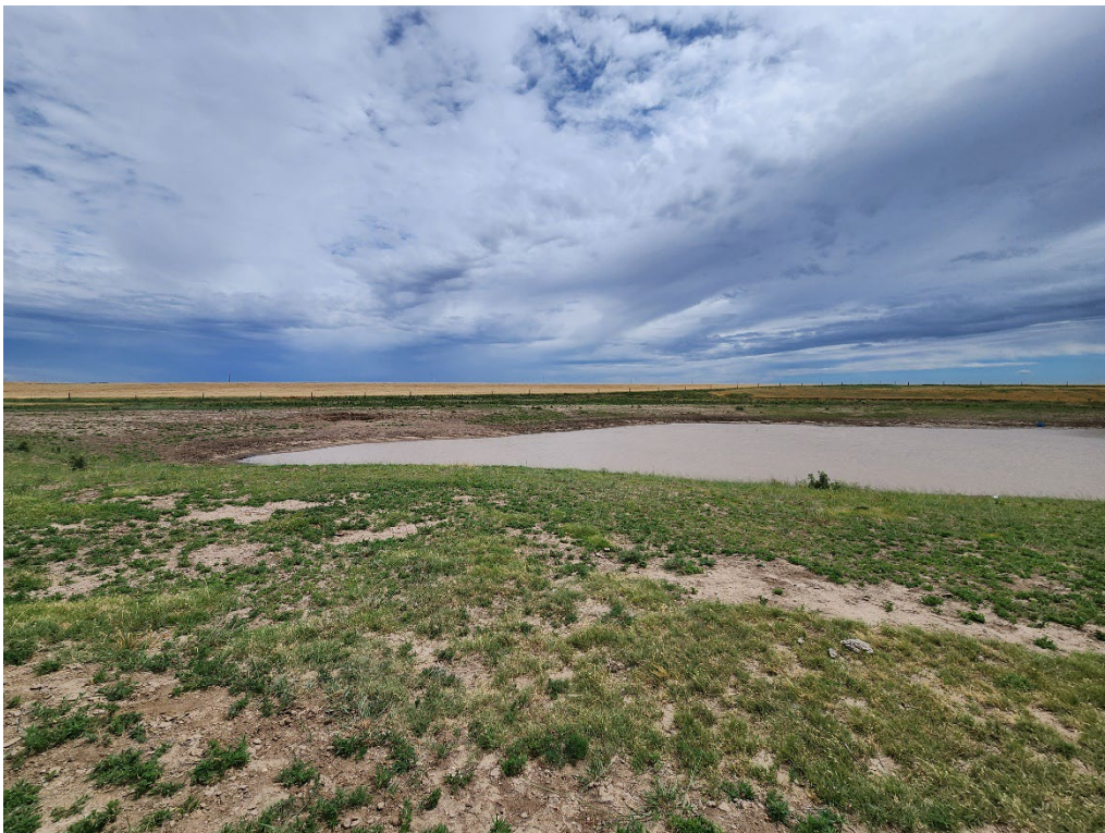
Photo 2. Mined pit, looking east.