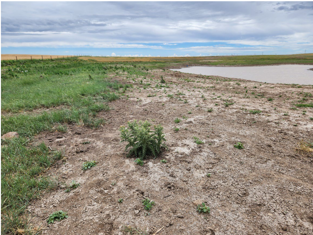
Photo 4. Northern edge of the pit, with a scotch thistle imaged, looking east.