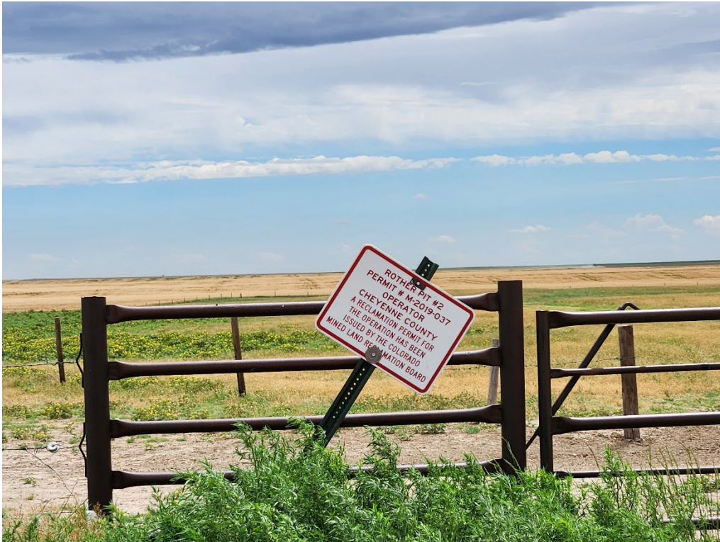
Photo 1. Mine entrance sign, looking east.